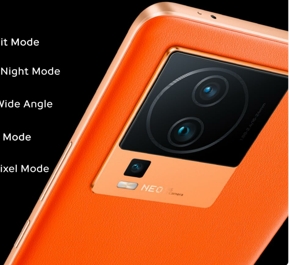
Figure 3.1: Rear view of the iQOO Neo 7 Pro 5G in Fearless Flame (Leather Design)