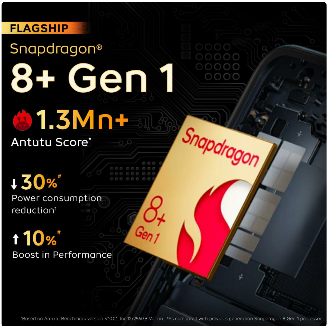
Figure 1.1: iQOO Neo 7 Pro 5G Smartphone Overview