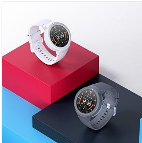
Figure 2: Example of customizable watch faces available for the Amazfit Verge Lite.