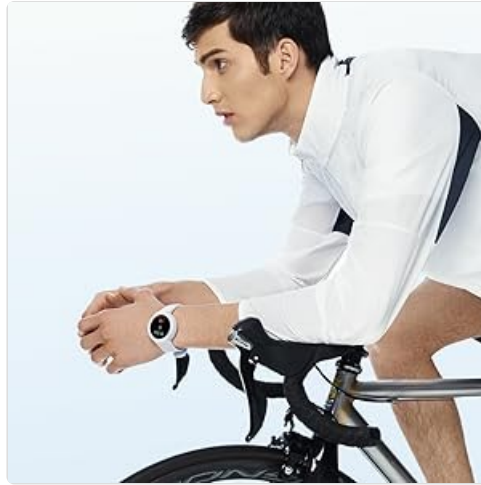
Figure 3: The Amazfit Verge Lite displaying various sports tracking modes.

To start a workout, swipe left from the watch face, select "Workout," choose your desired activity, and tap to begin. Ensure GPS is active for outdoor activities.