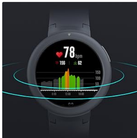
Figure 4: Heart rate monitoring interface on the Amazfit Verge Lite.

The watch provides continuous heart rate monitoring using its built-in optical sensor. You can view your current heart rate on the watch or detailed historical data in the Zepp app. The watch can also provide heart rate warnings if your heart rate exceeds a set value.