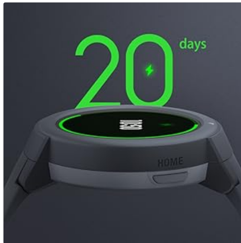
Figure 7: Illustration of the Amazfit Verge Lite's extended battery life.

To maximize battery life, avoid extreme temperatures. Charge the watch fully before long periods of inactivity. The watch features a 20-day battery life under typical usage and up to 40 hours with continuous GPS tracking.