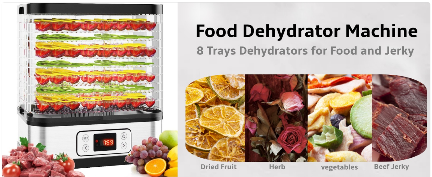
Figure 4: The intelligent control panel allows precise adjustment of drying time and temperature.