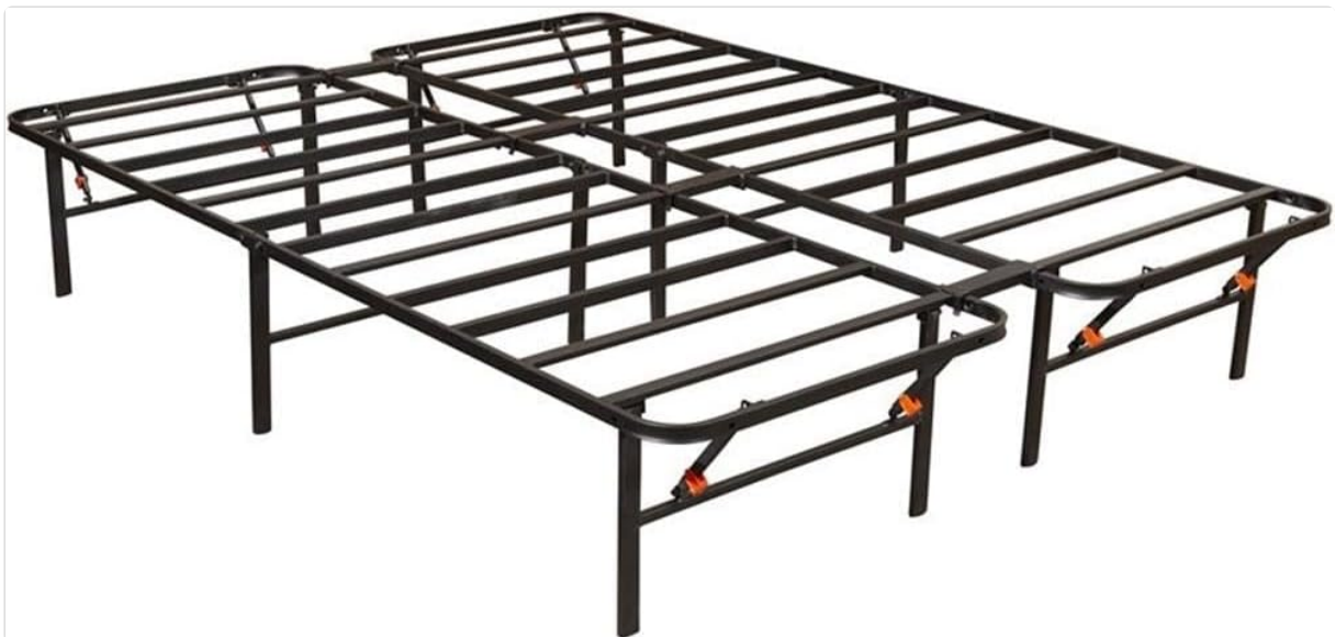
Image 1.1: Overall view of the Bedder Base Platform Bed Frame in its unfolded state.

The Hollywood Bed Frames Bedder Base Platform is an underbed support system designed for modern mattresses, eliminating the need for a traditional box spring or foundation. Its robust steel construction and heavy-duty cross bars provide stable support. The 14-inch height offers ample under-bed storage space. This product is designed for quick and tool-free assembly.