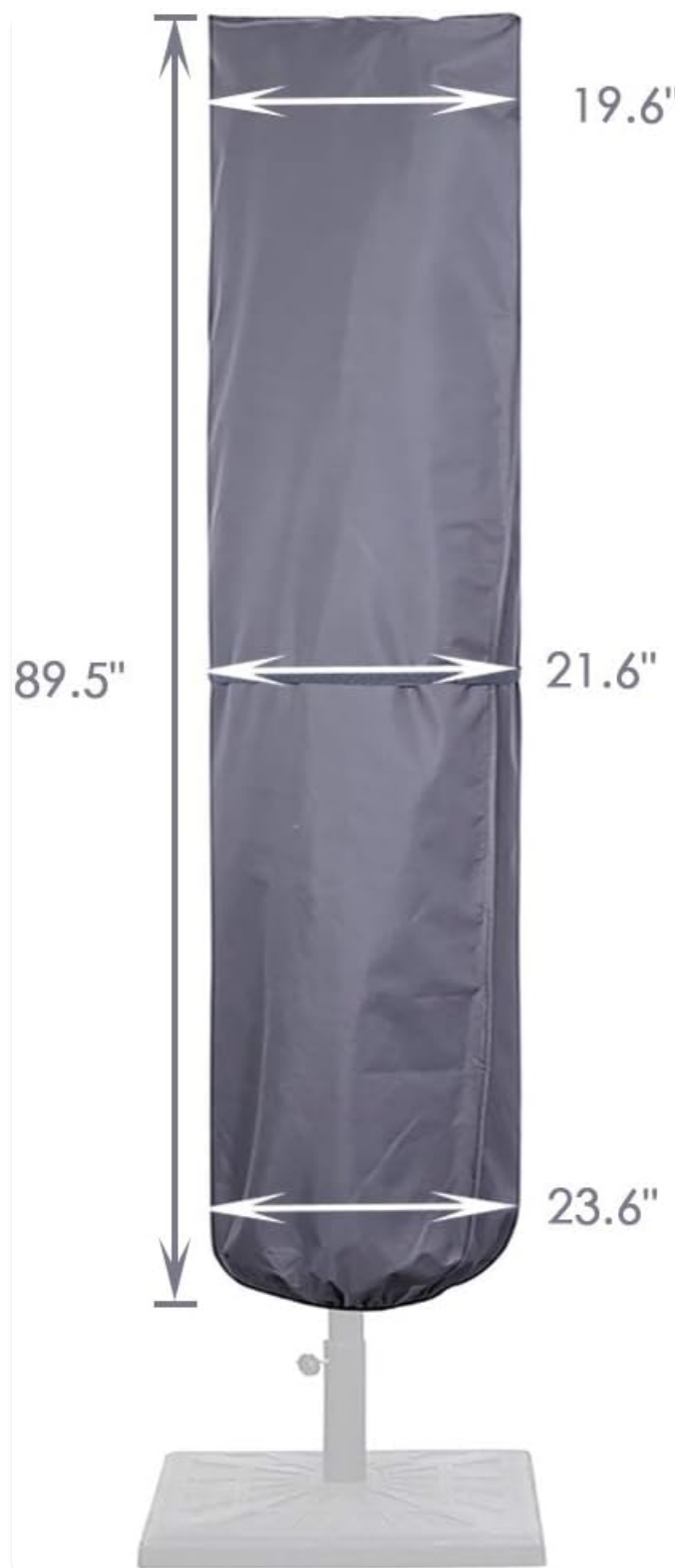
Figure 6.1: Detailed dimensions of the umbrella cover.