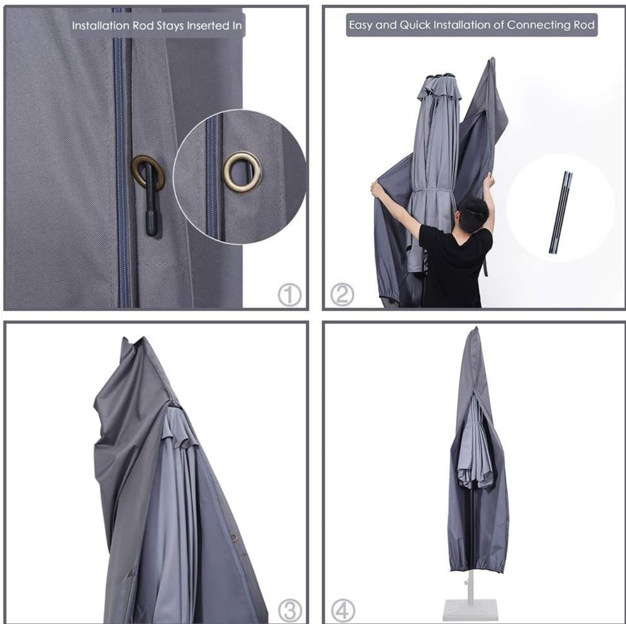
Figure 2.1: Visual guide for installing the umbrella cover using the rod and zipper.