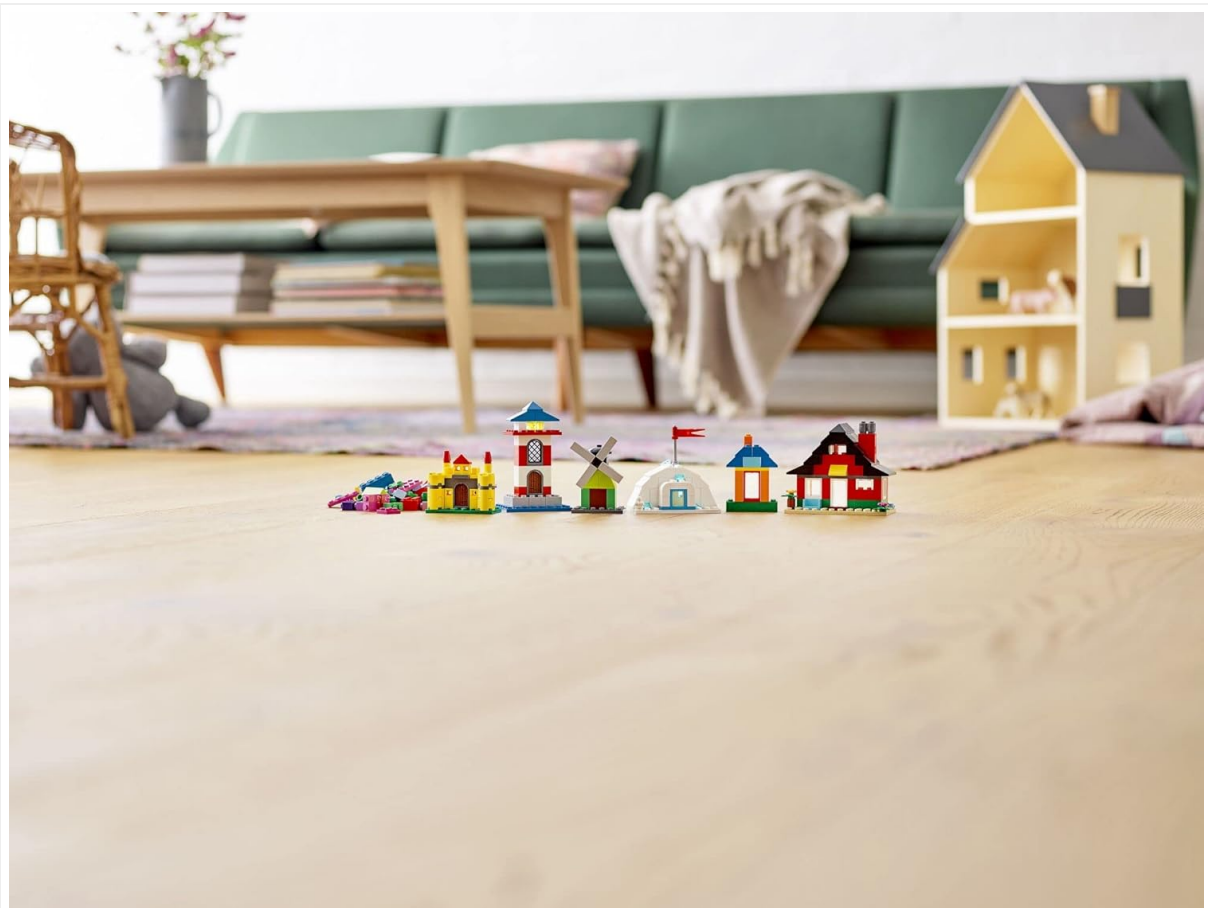
Image: A line of six diverse LEGO models, including various houses, an igloo, a lighthouse, a castle, and a windmill, showcasing the building possibilities of the set.