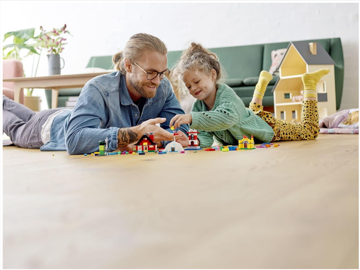
Image: A father and child engaged in building with LEGO bricks on a wooden floor, demonstrating collaborative play.