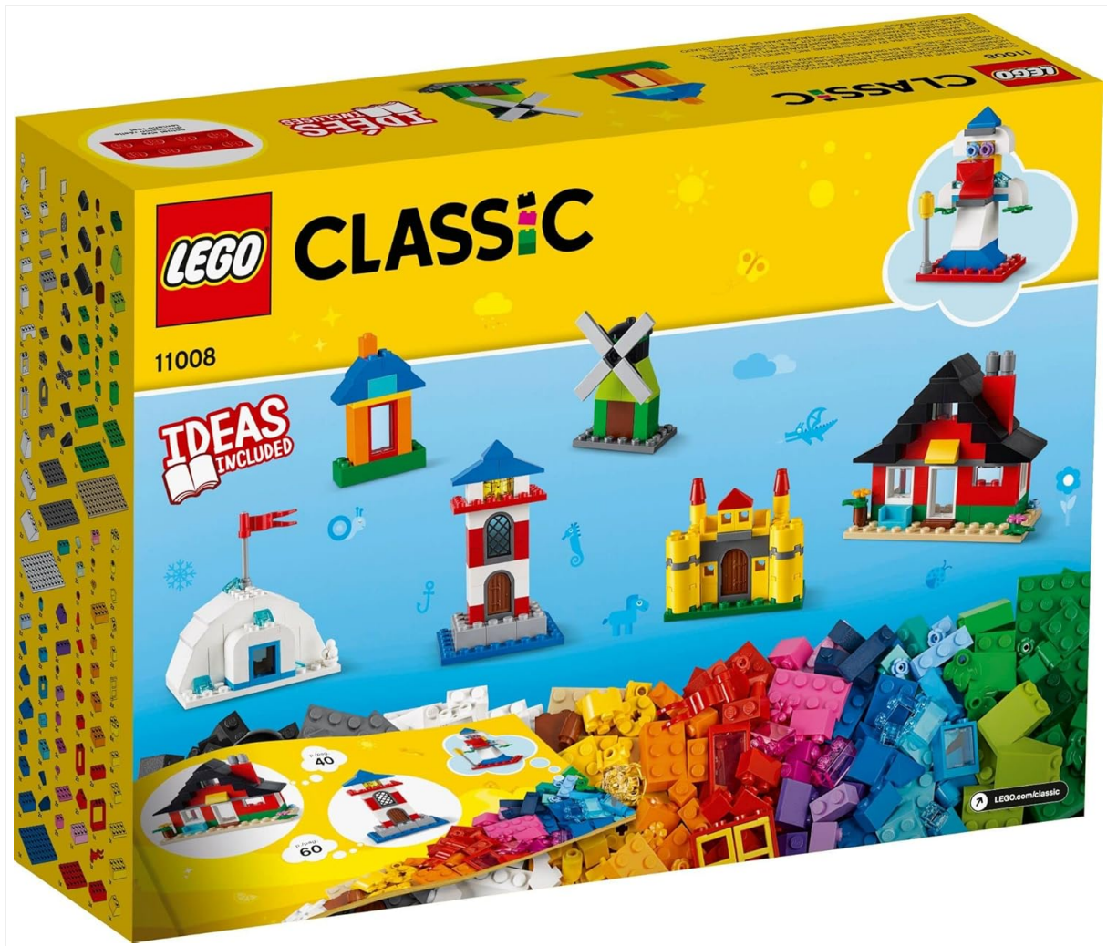
Image: The packaging for the LEGO Classic Bricks and Houses 11008 set, displaying the included bricks and examples of the six models that can be built.