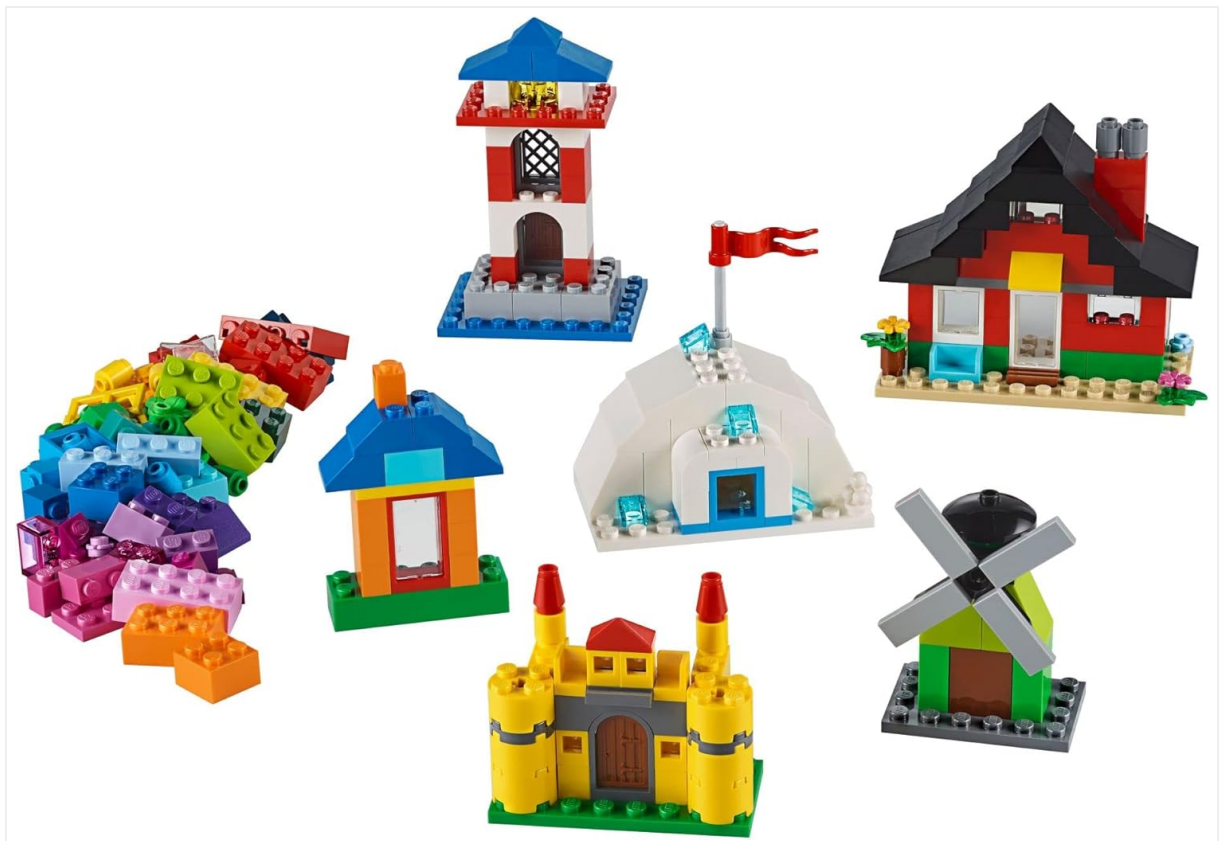
Image: A detailed view of several completed LEGO structures alongside a collection of loose, colorful bricks, illustrating the components and potential creations.

Your browser does not support the video tag.