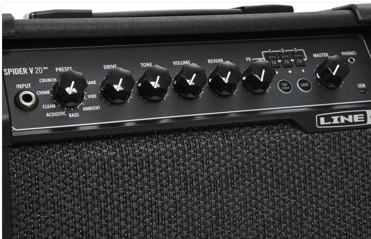
Figure 3.1: Close-up view of the Line 6 Spider V 20 MKII control panel. This image details the input jack, preset selector, Drive, Tone, Volume, Reverb, FX controls, Master volume, Phones output, USB port, Tap/Tuner button, and Save button.