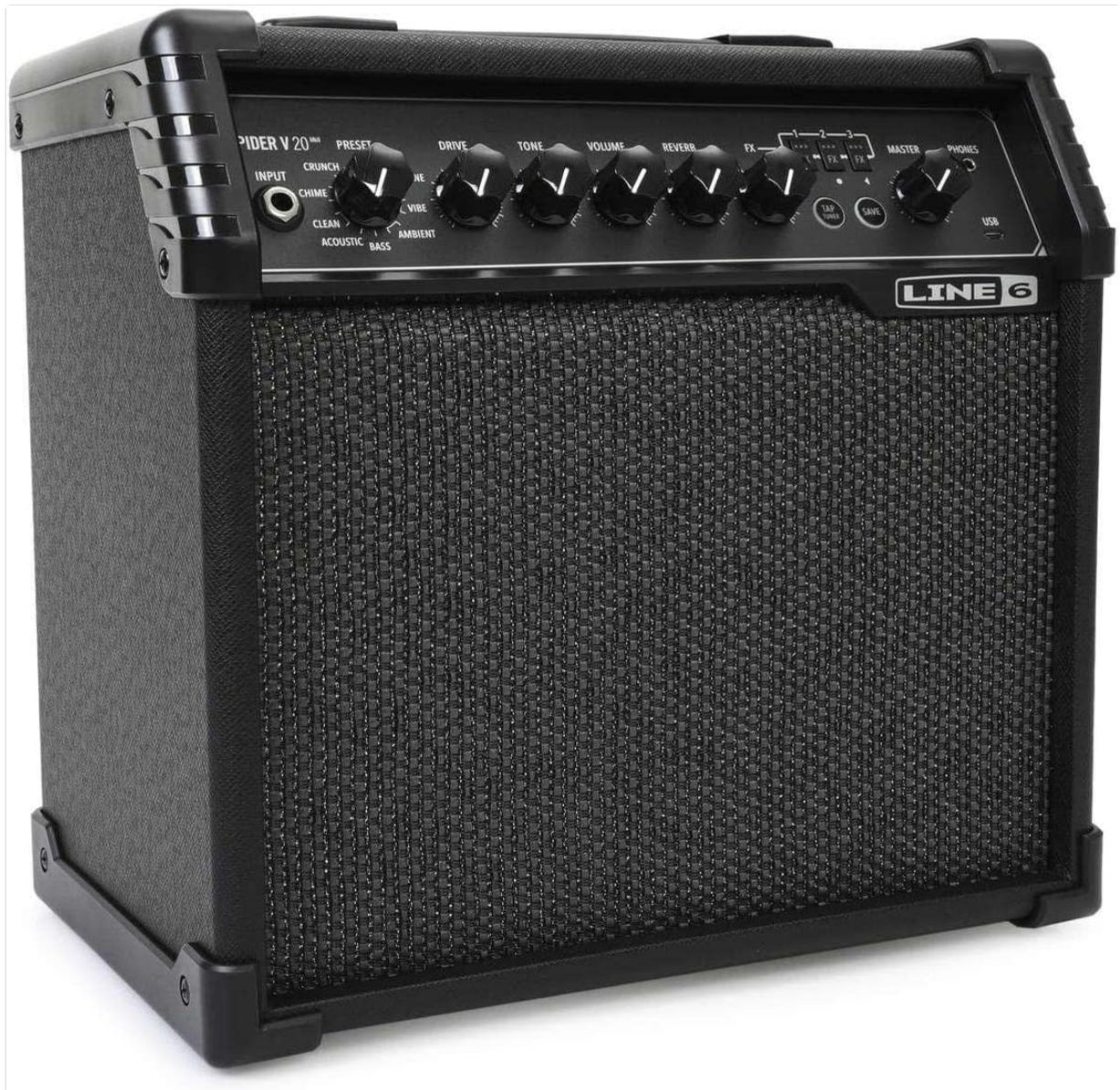
Figure 1.1: Front angled view of the Line 6 Spider V 20 MKII amplifier. This image displays the amplifier's overall design, including the speaker grille and the control panel at the top.