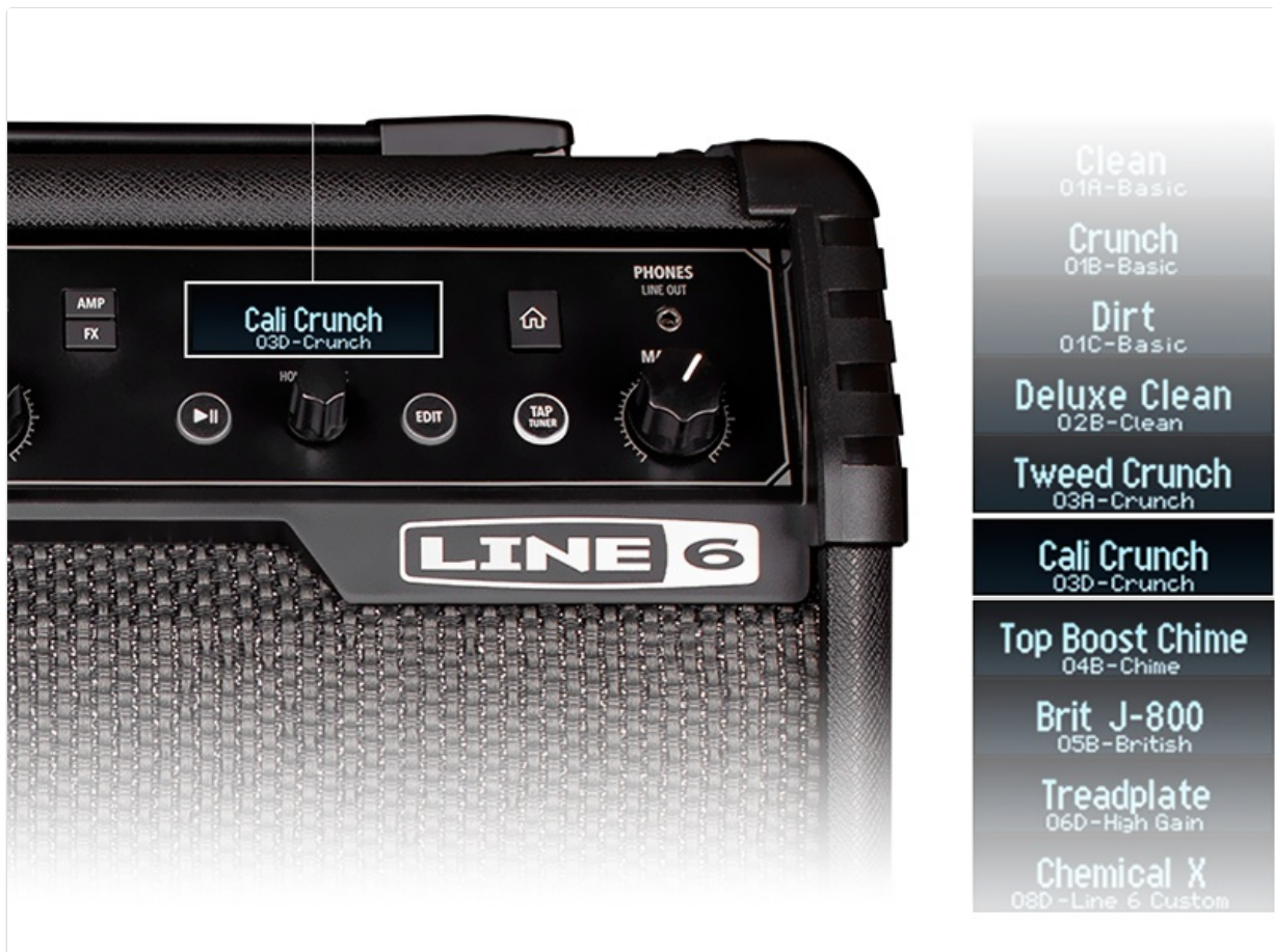
Figure 3.2: Diagram illustrating the front panel layout of the Spider V 20 MKII, showing the positions of the input, knobs, buttons, and ports.