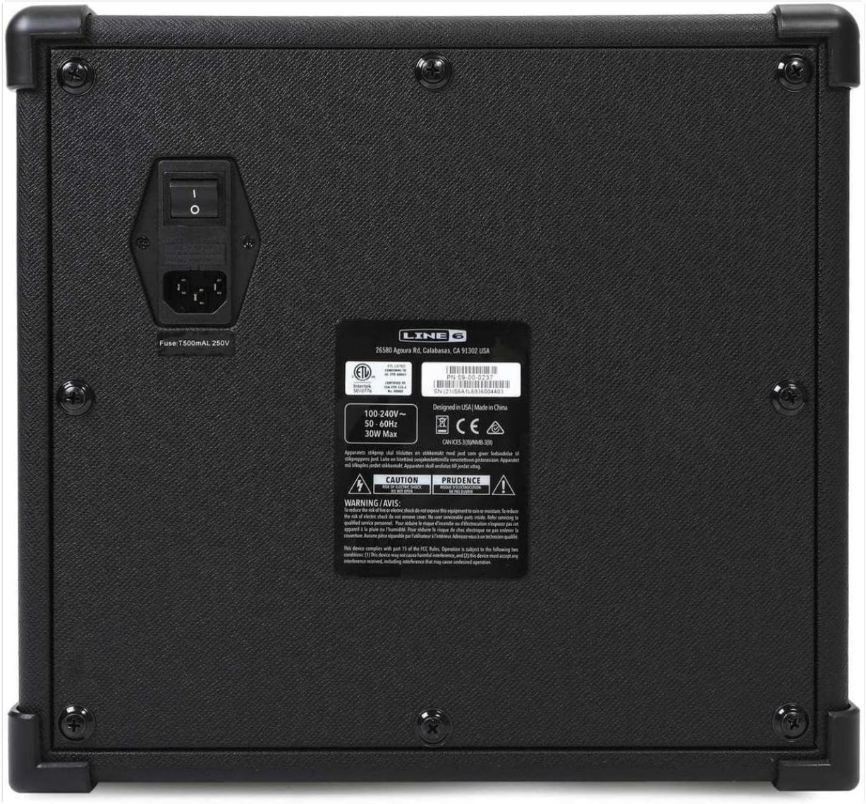
Figure 2.1: Rear panel of the Line 6 Spider V 20 MKII amplifier. This image highlights the AC power input, the power switch, and the product information label.

will power on, and the display will illuminate.