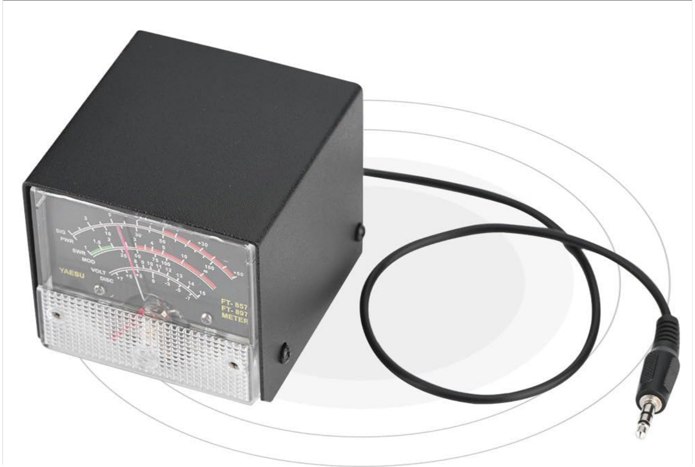
Figure 3: The meter clearly displays automatic level control voltage, modulation level, standing wave ratio, and supply voltage.