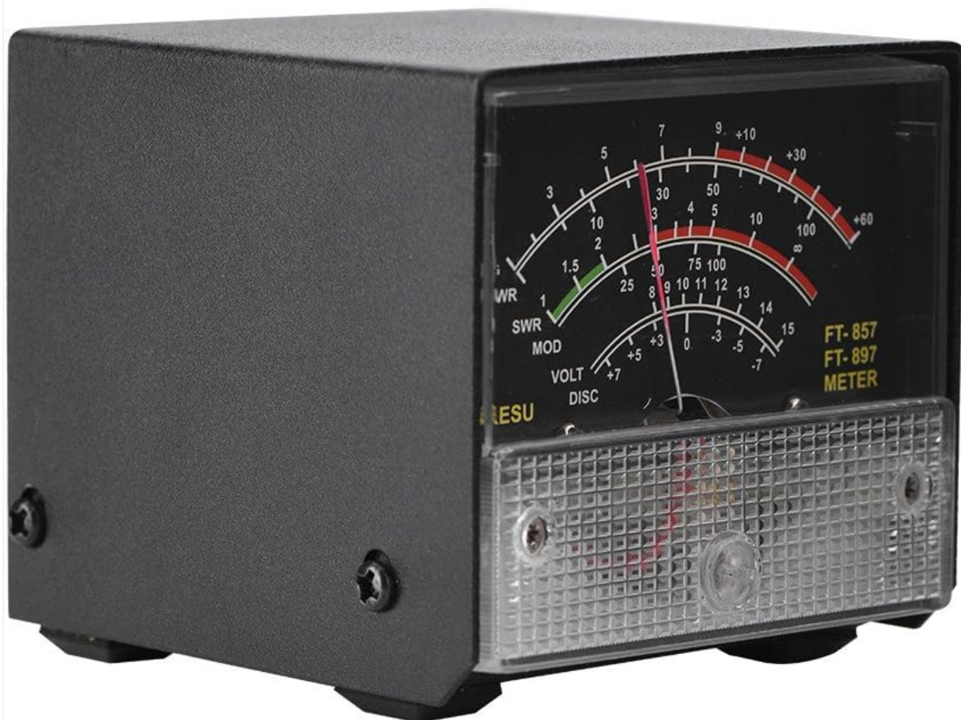
Figure 4: Dimensions of the Zerone External S Meter: 6.7 cm * 7 cm * 6 cm.