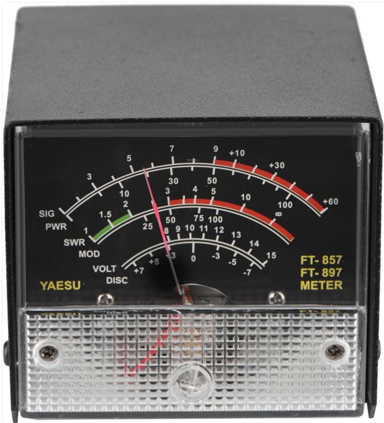
Figure 2: A detailed view of the meter's display face, showing SIG, PWR, SWR, MOD, VOLT, and DISC scales.