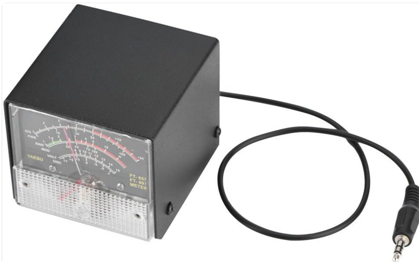
Figure 1: The Zerone External S Meter with its connecting cable.