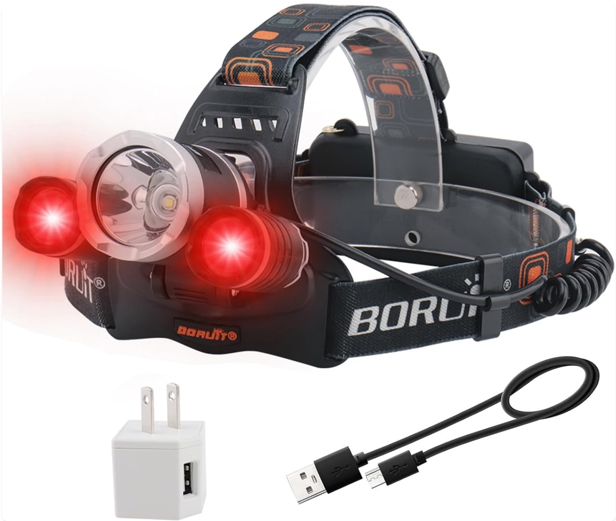
Figure 1: BORUIT RJ-3000 Headlamp with battery compartment visible.