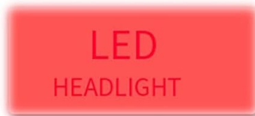
Red light: Charging