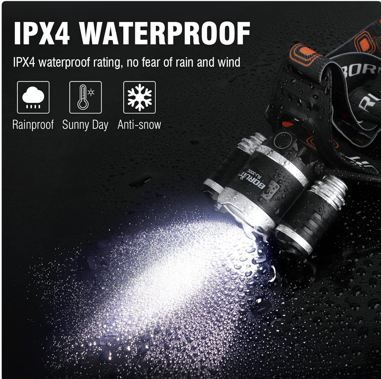
Figure 6: The headlamp demonstrating its IPX4 waterproof capabilities under simulated rain.

The headlamp has an IPX4 water resistance rating, meaning it is resistant to splashing water from any direction. It is not designed for submersion. Ensure the USB-C port cover is securely closed to maintain water resistance.