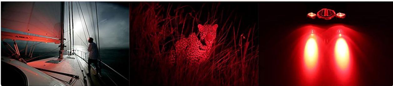
Figure 5: The headlamp operating in Red Light Mode, suitable for various low-light activities.