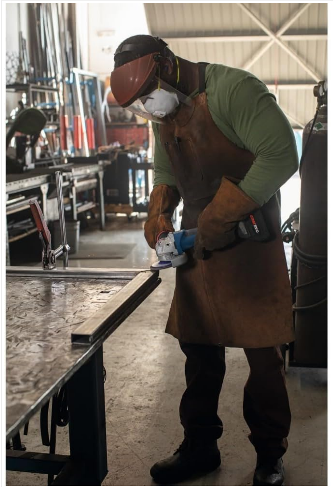
Figure 5.1: An individual wearing safety gear, including a face shield and gloves, operating the Bosch angle grinder to grind a metal workpiece.