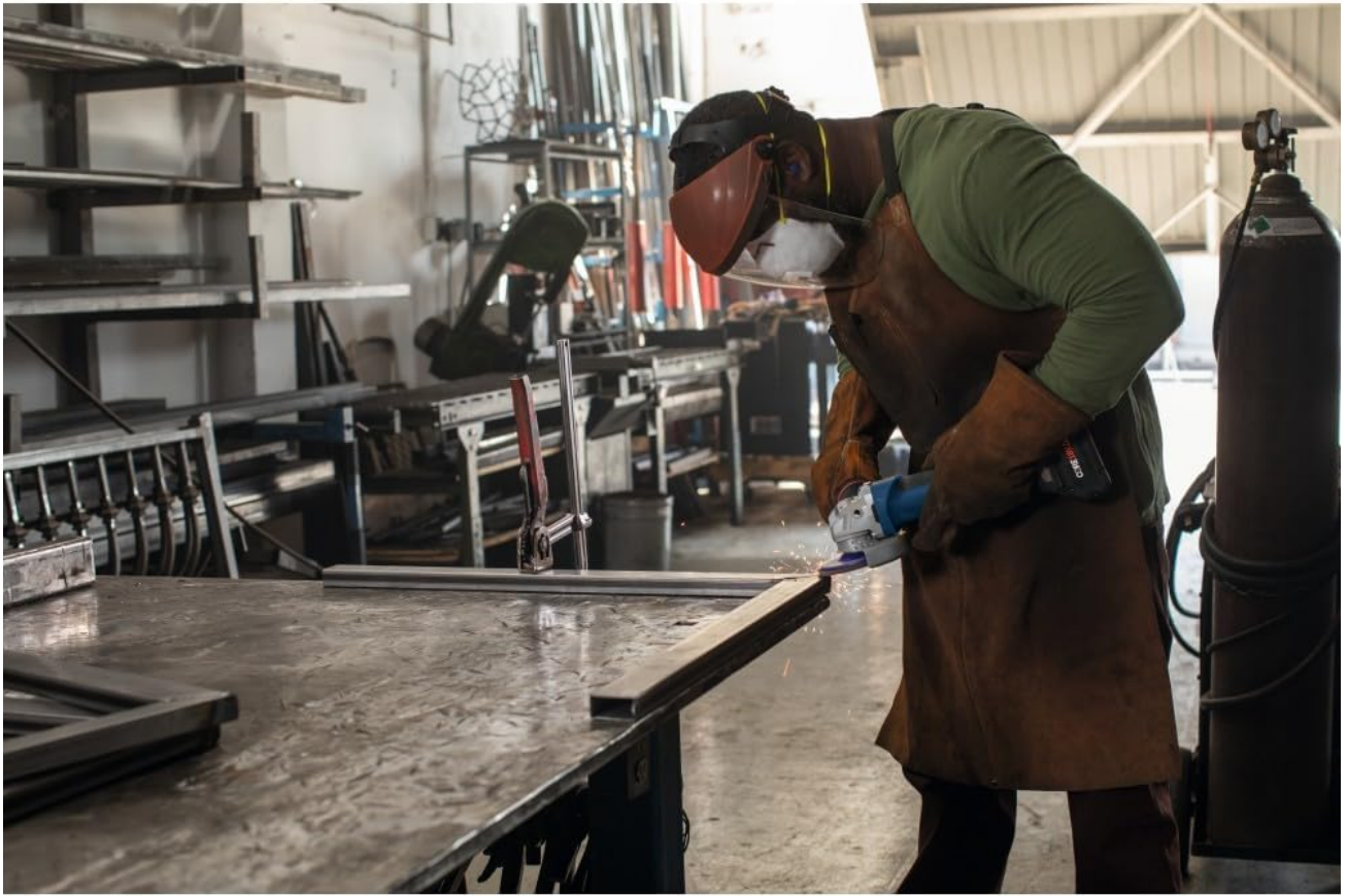
Figure 5.2: An individual wearing safety glasses and gloves using the Bosch angle grinder to cut a metal pipe.