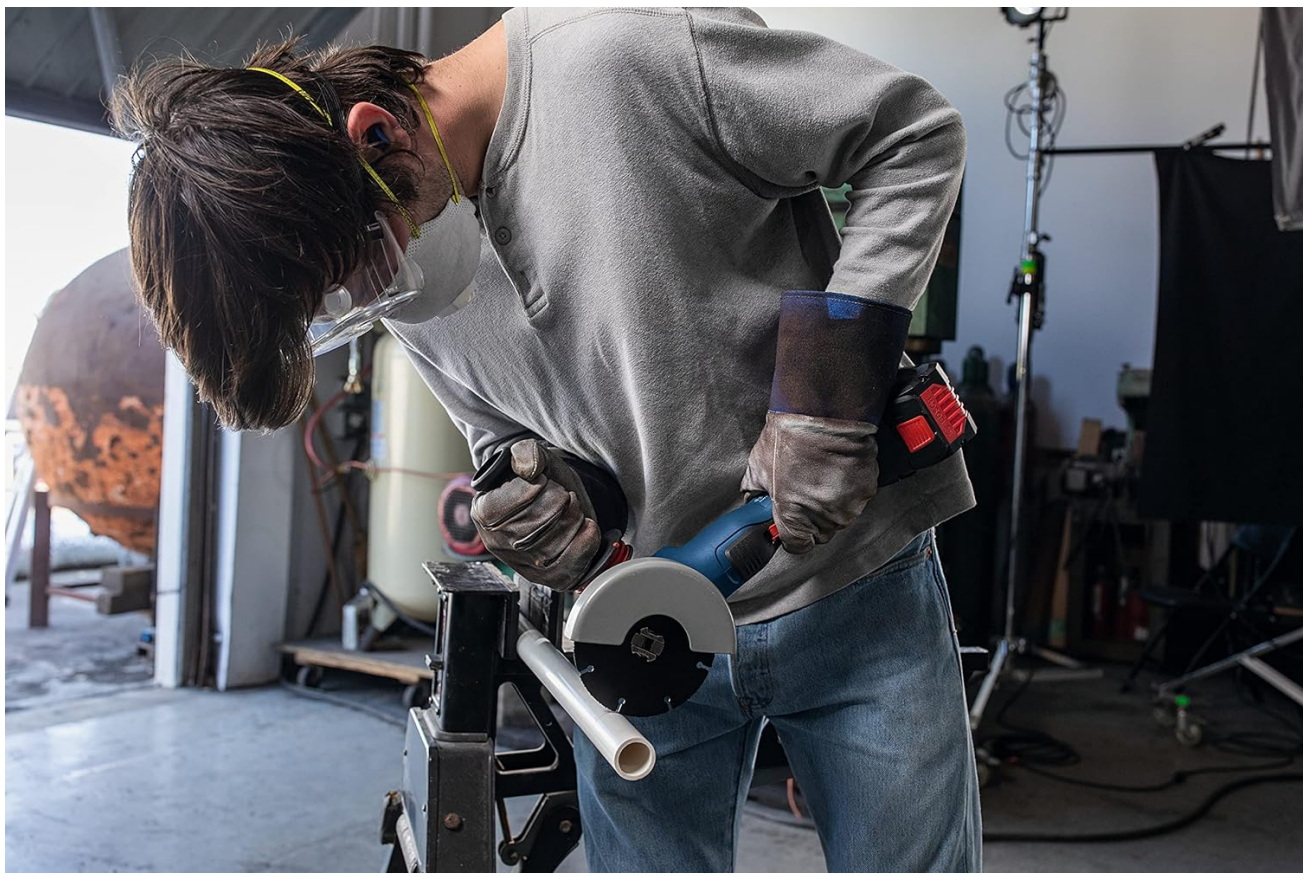
Figure 4.1: Image showing Bosch CORE18V 4Ah and 8Ah batteries, part of the AMPShare 18V Battery System, recommended for use with the tool.