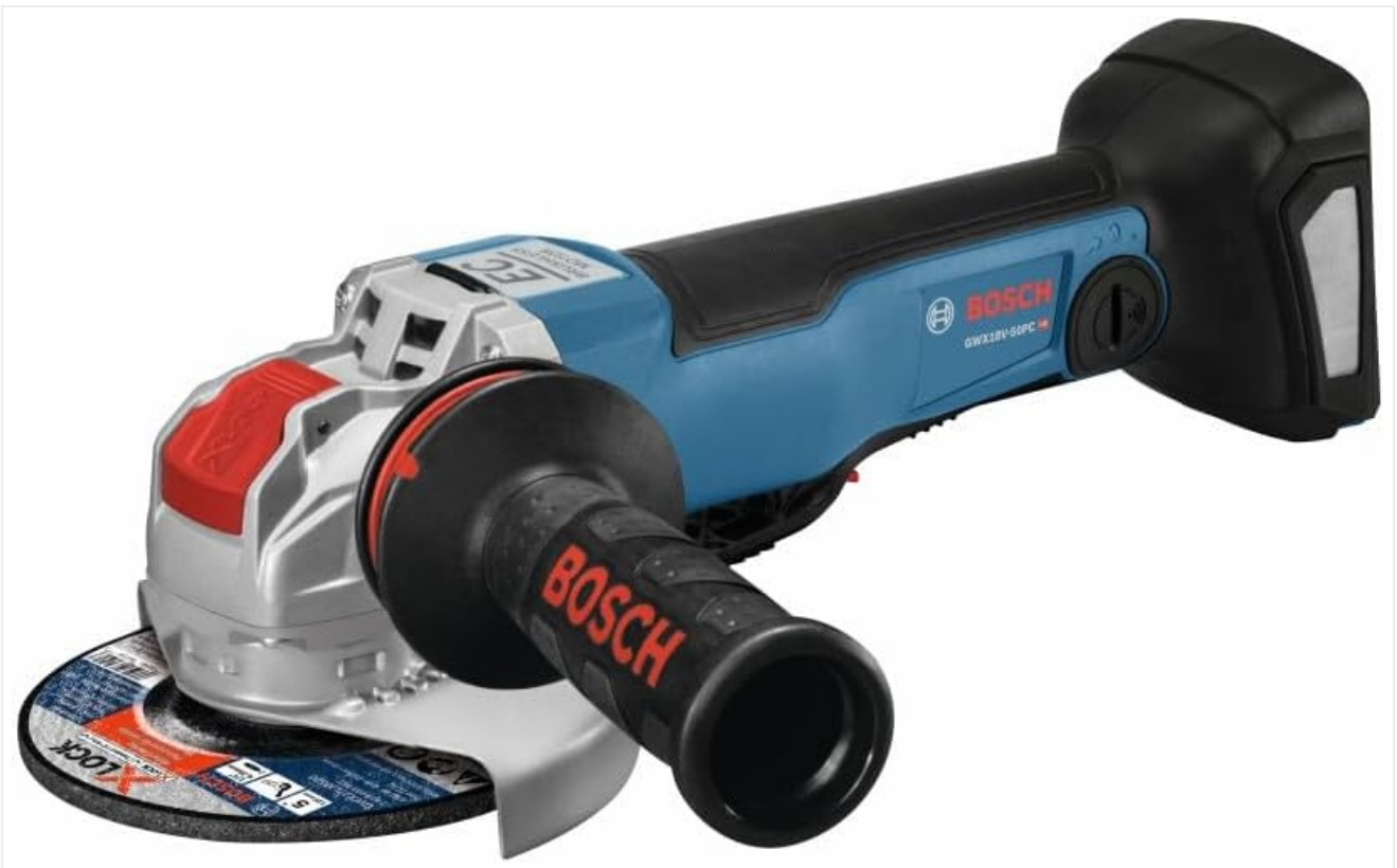
Figure 3.1: The Bosch GWX18V-50PCN angle grinder, showcasing its compact design and X-LOCK system.

The Bosch GWX18V-50PCN angle grinder is a robust cordless tool designed for professional use. Key components and features are illustrated below.