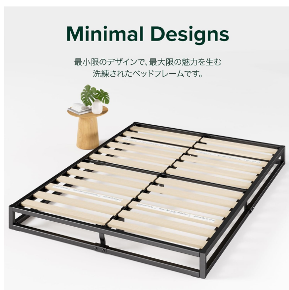
Image: A close-up view of the low-profile design of the bed frame, highlighting the under-bed clearance and the sturdy construction.