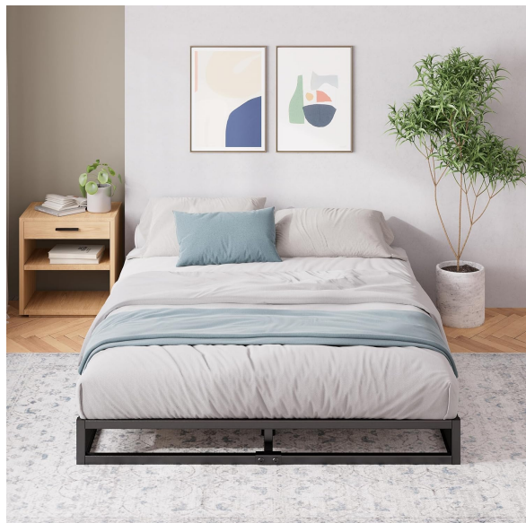
Image: A front view of the ZINUS Joseph Metal Platform Bed Frame with a mattress and bedding, demonstrating its low-profile design and how it appears in a bedroom setting.