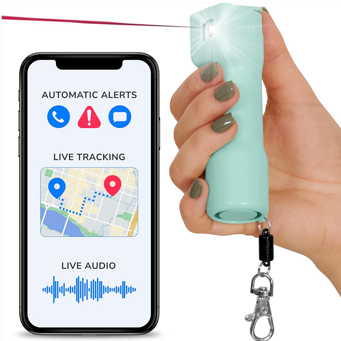
Image 1.1: The Plegium Smart Pepper Spray in mint green, shown alongside a smartphone displaying its integrated app features for automatic alerts, live tracking, and live audio.