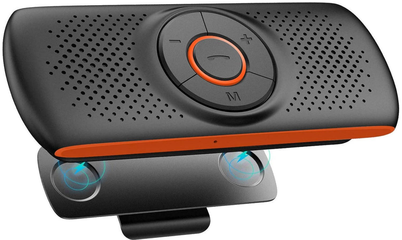
Figure 3: Speakerphone attached to a car sun visor using the magnetic clip.