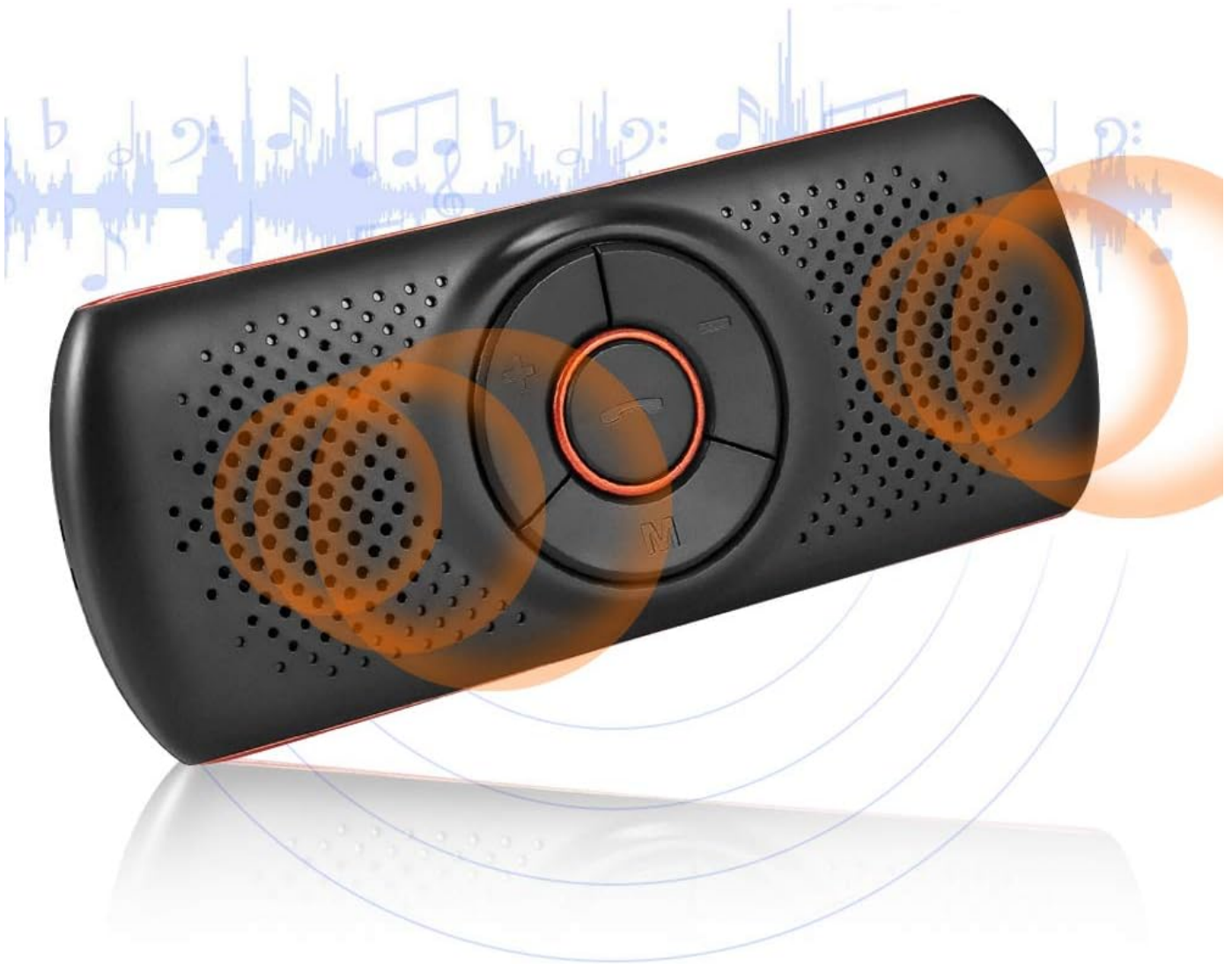
Figure 4: The speakerphone delivers excellent sound quality for calls and music.