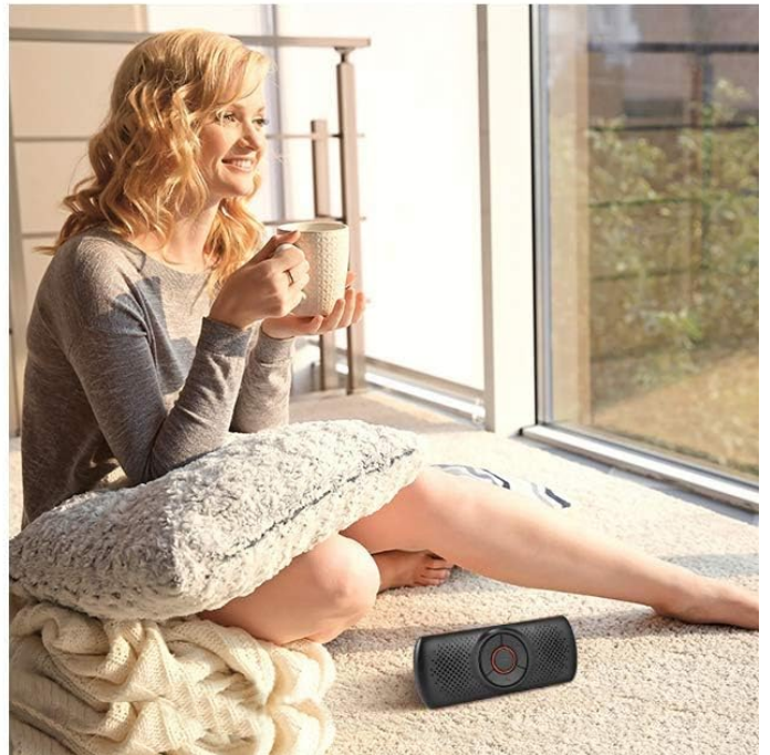
Figure 1: NETVIP Bluetooth Speakerphone in various usage environments.