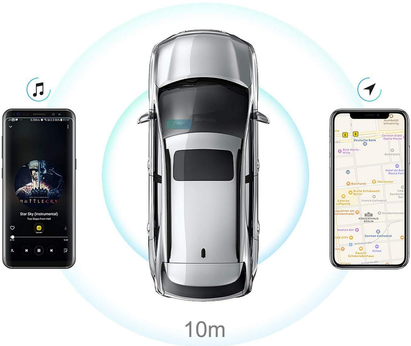
Figure 6: Simultaneous connection of two phones to the speakerphone.