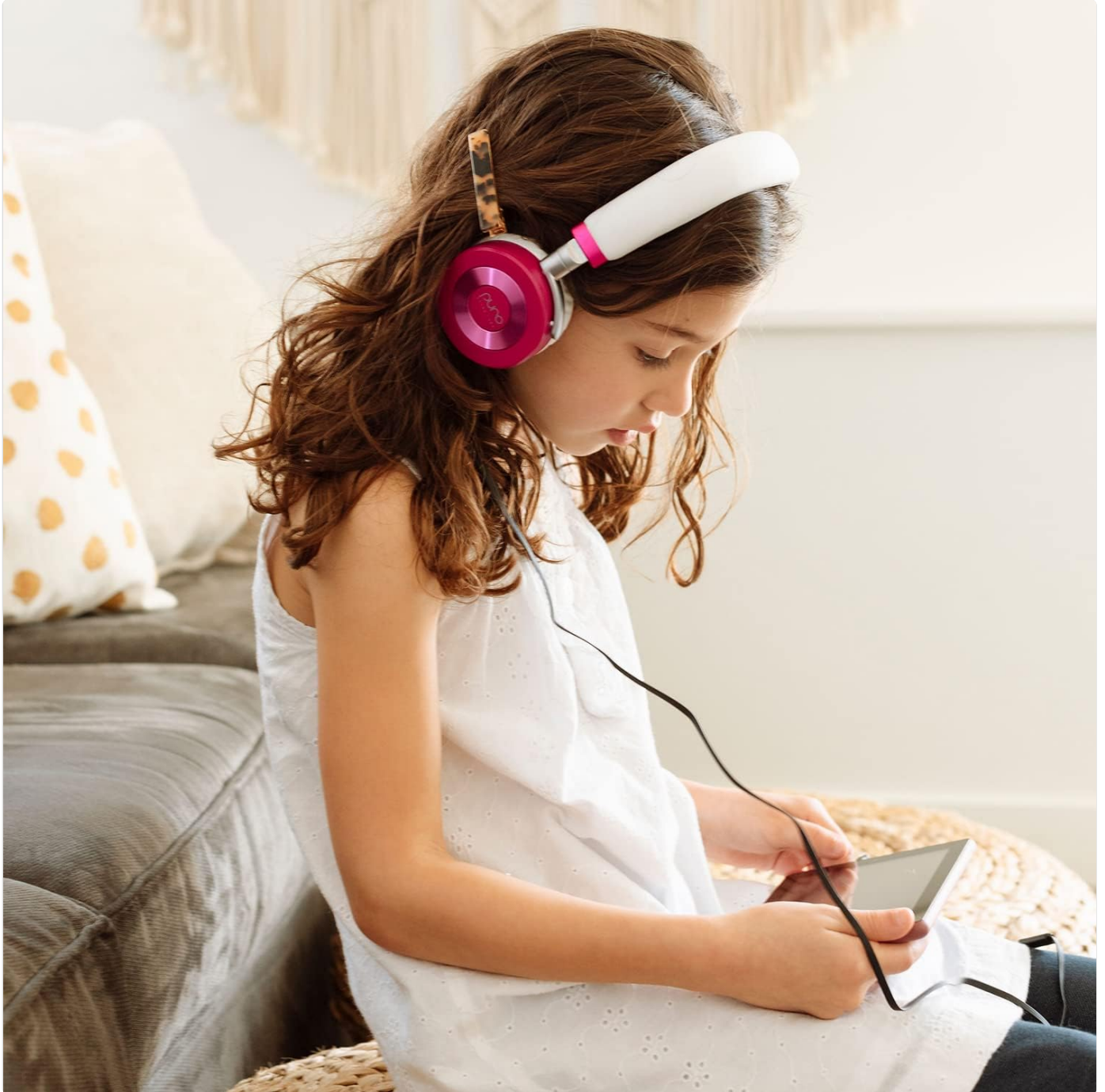
Image: A child using the headphones with a wired connection to a tablet.

To use the headphones in wired mode or when the battery is depleted, connect one end of the included audio cable to the headphone's audio jack and the other end to your device's audio output.