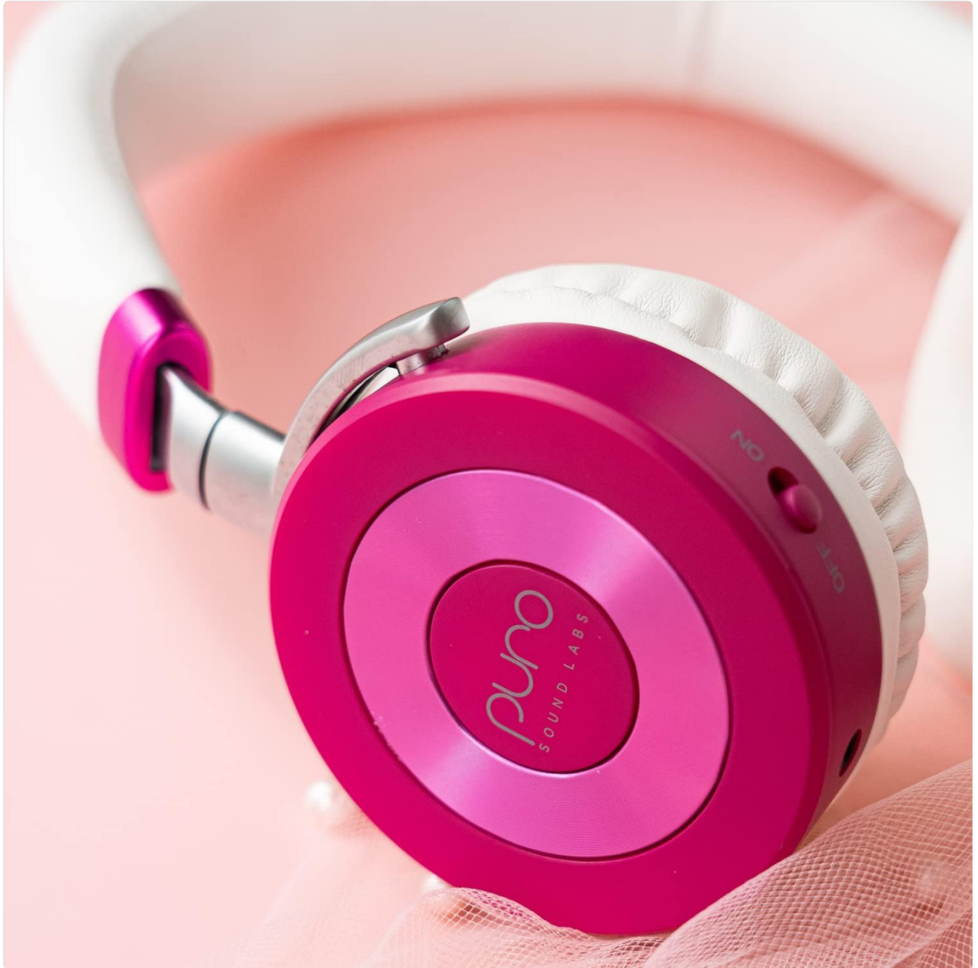
Image: Close-up of the headphone earcup, highlighting the charging port and control buttons.

Before first use, fully charge the headphones. Connect the charging cable to the charging port on the headphones and the other end to a USB power source. The LED indicator will show charging status and turn off when fully charged. A full charge provides approximately 22 hours of battery life.