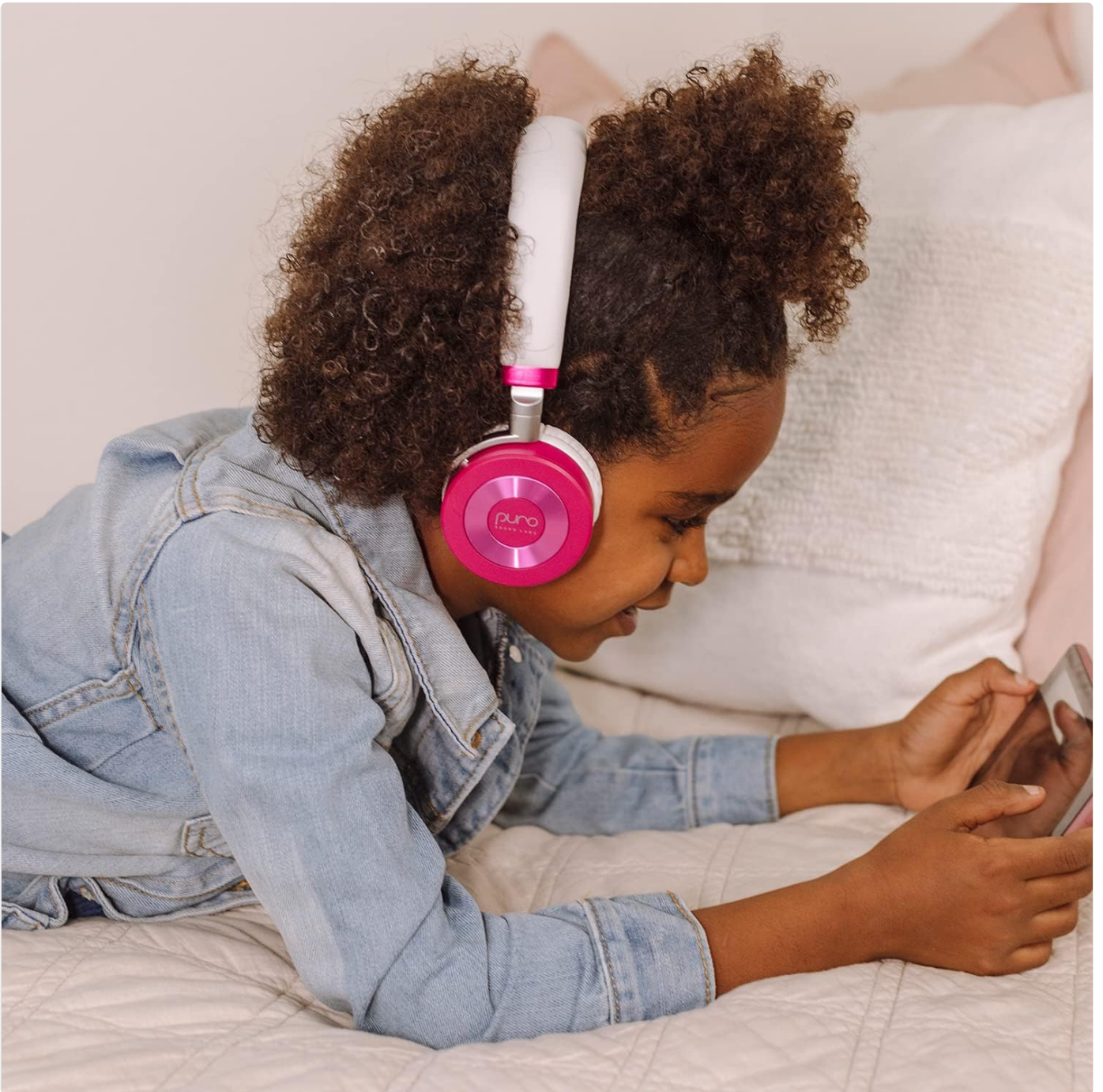
Image: A child enjoying content with the JuniorJams headphones.