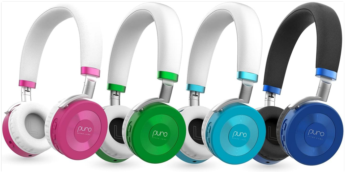
Image: Various color options available for the JuniorJams headphones.

Your browser does not support the video tag.