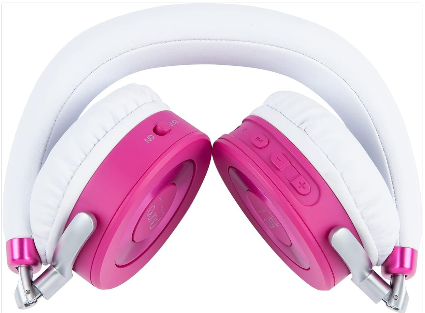
Image: The headphones in their folded position, suitable for storage in the travel bag.