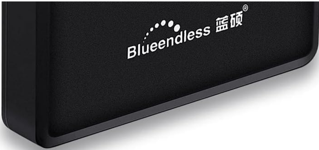
Image: The Blueendless external hard drive connected to a laptop, illustrating a typical setup for immediate use.