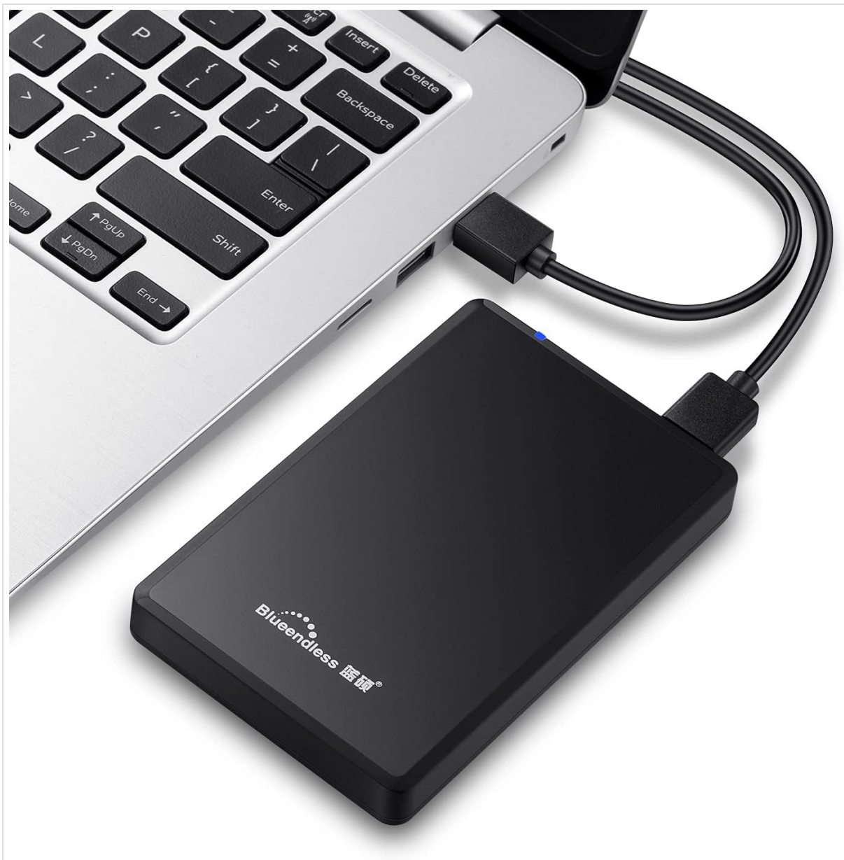
Image: Diagram illustrating the compact dimensions of the Blueendless external hard drive.