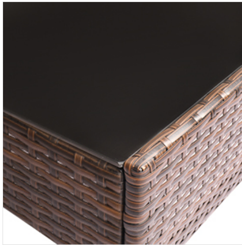
Image: Detail of the tempered glass coffee table top.

Video: Official Homall video demonstrating the assembly and features of the 4-Piece Outdoor Patio Furniture Set.