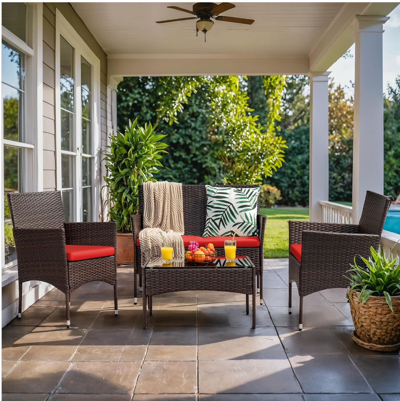
Image: The patio set on a porch, demonstrating its adaptability to different outdoor spaces.