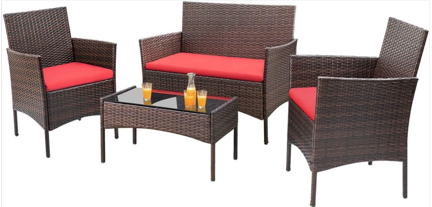
Image: The complete Homall 4-Piece Patio Rattan Furniture Set with red cushions, suitable for outdoor use.

Thank you for choosing the Homall 4-Piece Patio Rattan Furniture Set. This manual provides essential information for the safe assembly, operation, and maintenance of your new furniture. Please read these instructions carefully before beginning assembly and retain them for future reference.