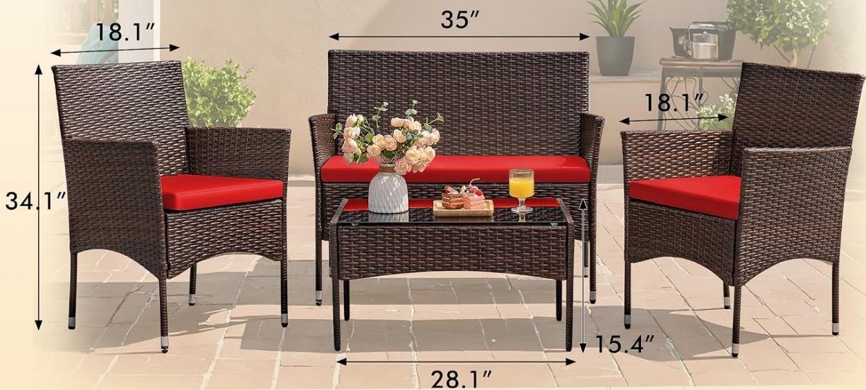
Image: Demonstrating the easy-to-clean soft cushions.