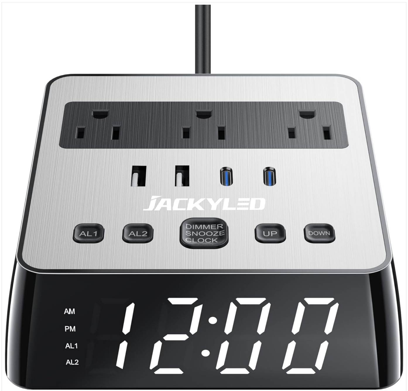
Image: Front view of the JACKYLED Alarm Clock with USB Charger Power Strip, showing the digital display and top-mounted outlets and USB ports.