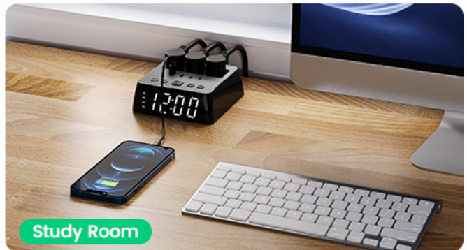
Image: The alarm clock being used in various environments like a bedroom, study room, and office, demonstrating its versatility as a charging station.