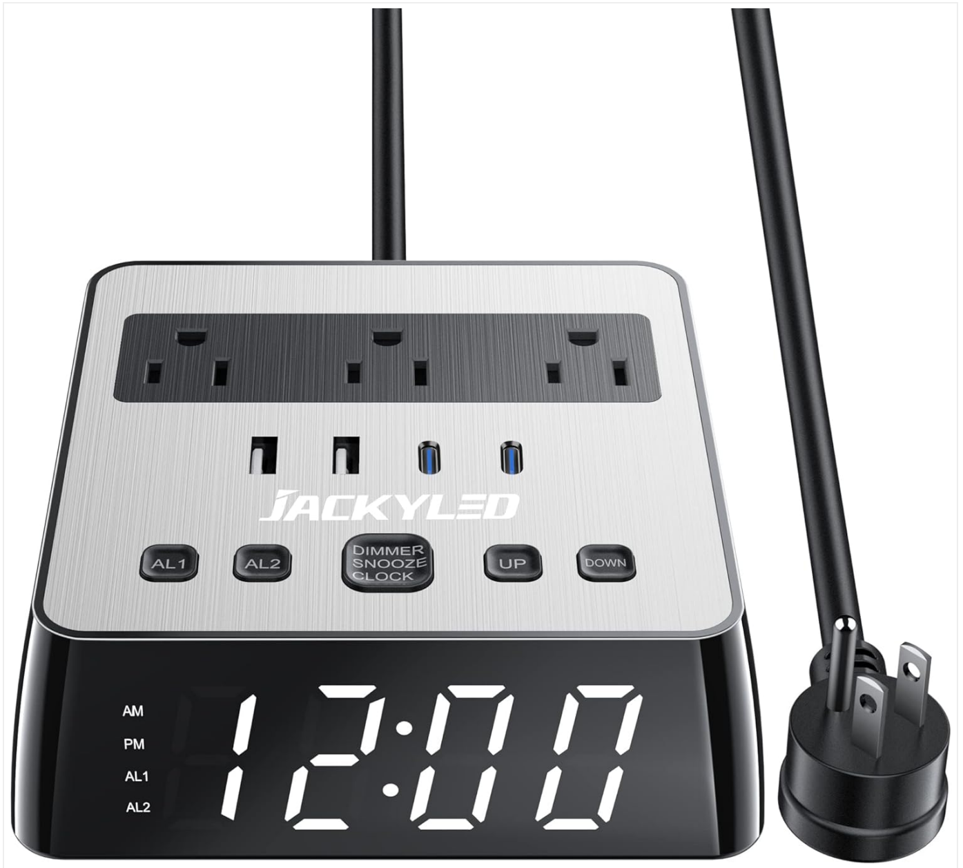
Image: The alarm clock with its power cord and plug, ready for connection to a wall outlet.

Plug the power cord into a standard AC outlet. The clock display will illuminate, indicating the unit is powered on.