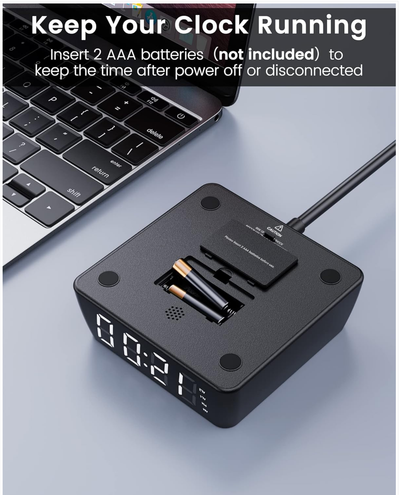
Image: Underside of the alarm clock showing the battery compartment with two AAA batteries inserted.

Insert 2 AAA batteries (not included) to keep the time after power off or disconnected