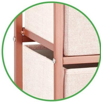
STRONG STEEL FRAME