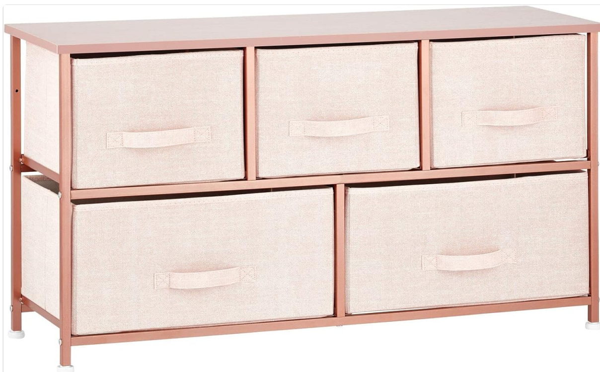
Image: The mDesign 5-Drawer Storage Chest, showcasing its five fabric drawers and wooden top in a light pink/rose gold finish.

The mDesign 5-Drawer Storage Chest offers a practical and stylish solution for organizing various items in your home. Featuring a durable steel frame, a sturdy wooden top, and five removable fabric drawers, this unit is designed for versatility and ease of use.