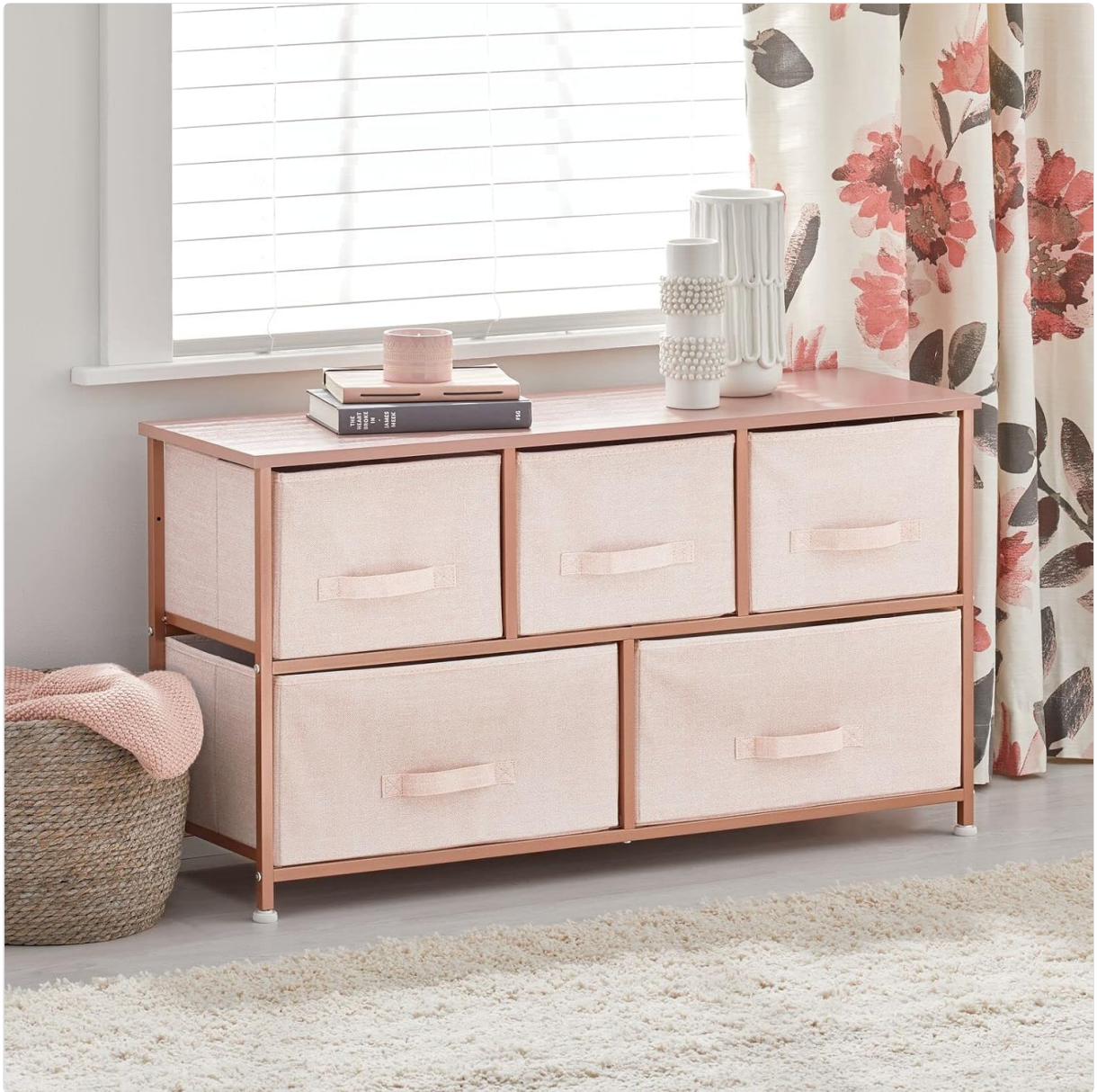
Image: The dresser integrated into a living space, demonstrating its use for storage and as a surface for decorative items.