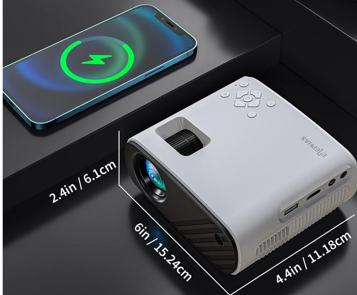
Image: The compact size of the ELEPHAS BL128 Mini Projector compared to a smartphone.