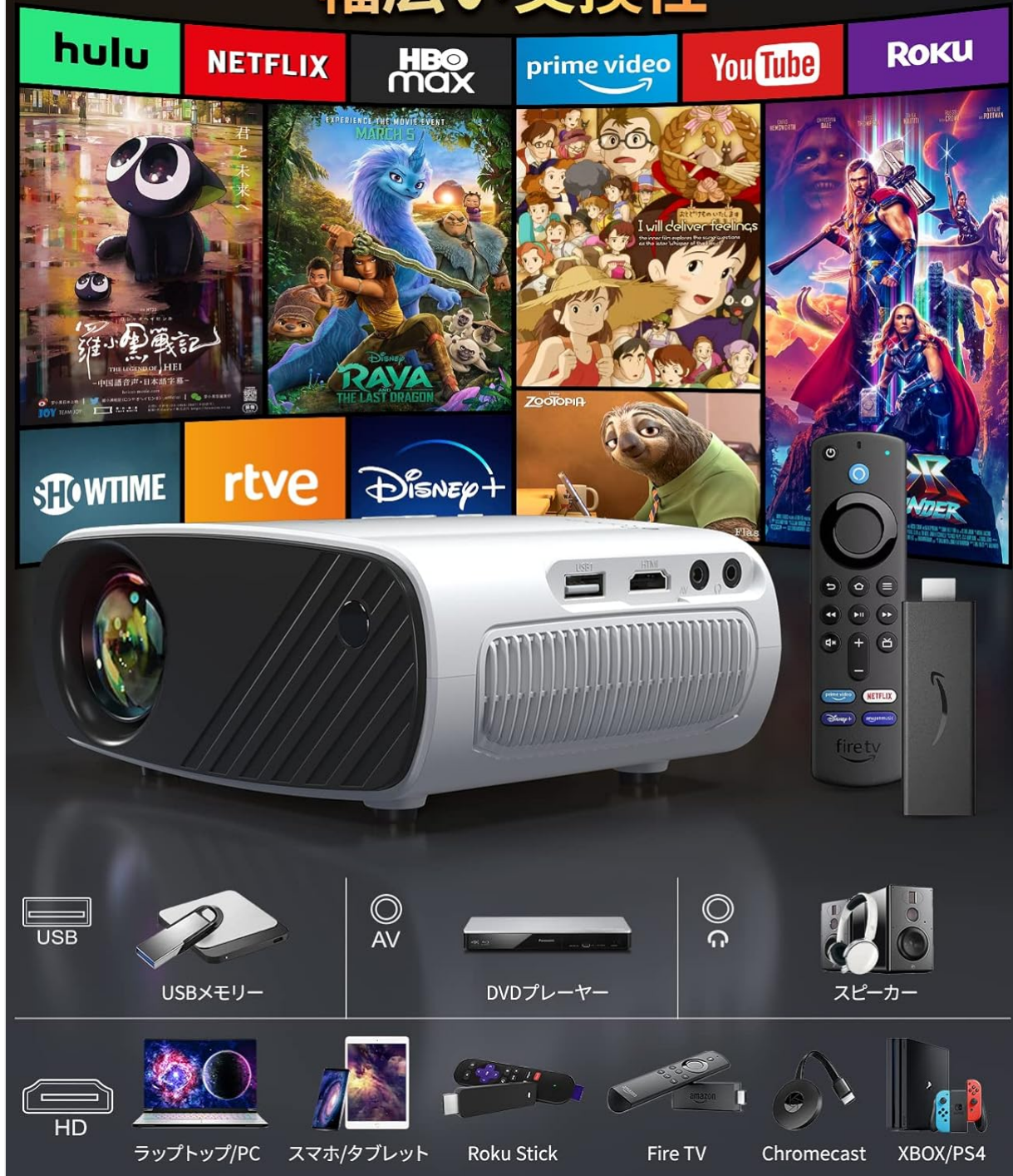
Image: Overview of the projector's connectivity ports and compatible devices.