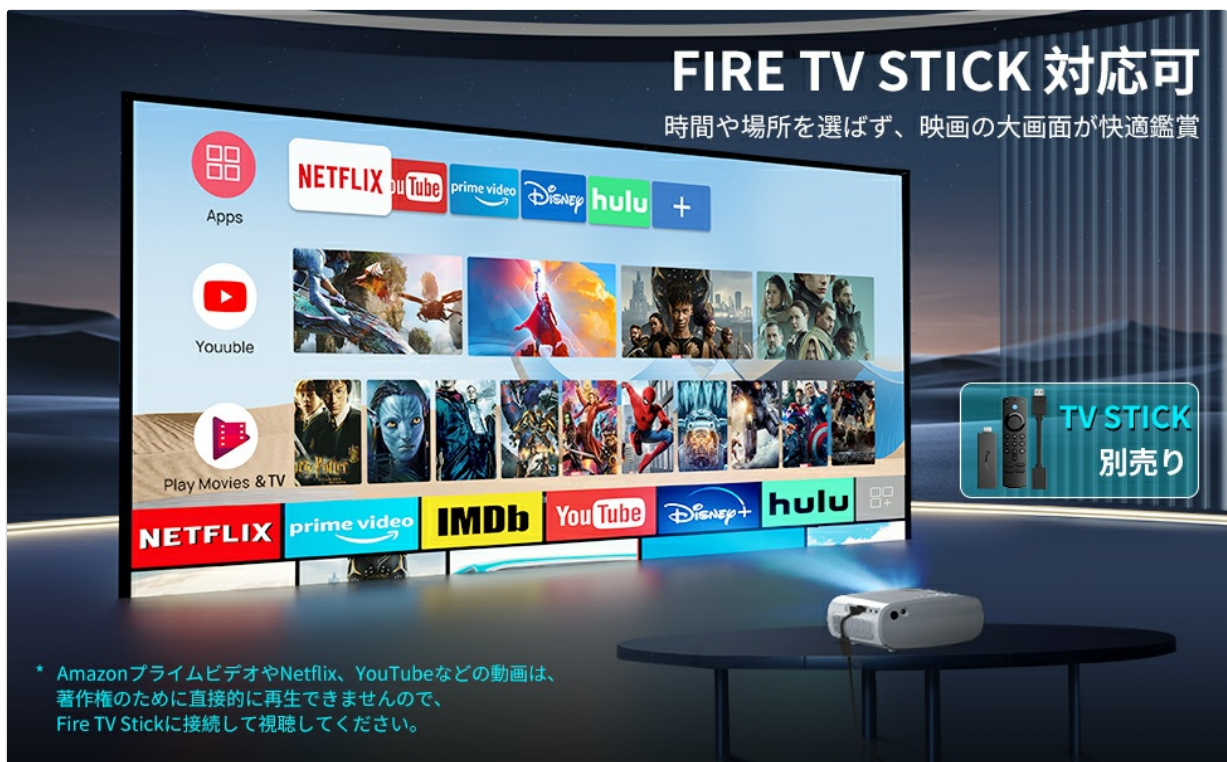
Image: Demonstrating compatibility with Fire TV Stick for streaming services.

Your browser does not support the video tag.