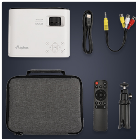
Image: All items included in the ELEPHAS BL128 Mini Projector package.