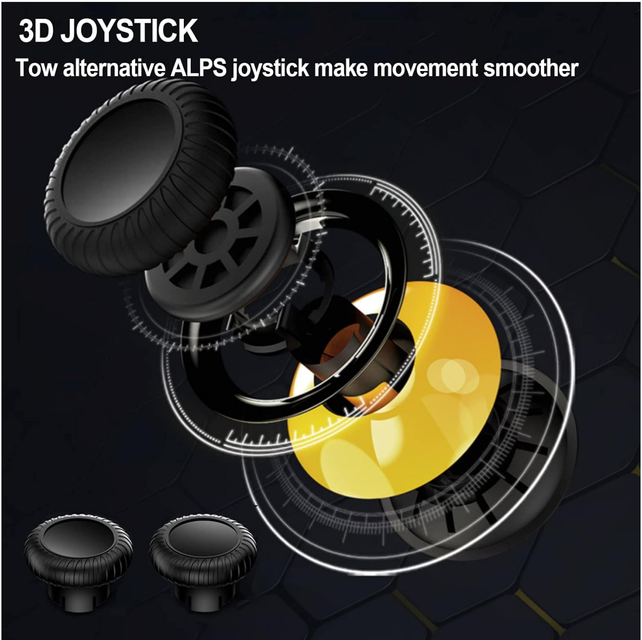
Image: A detailed view of the 3D joystick, highlighting its internal components for smooth and precise control.

Tow alternative ALPS joystick make movement smoother