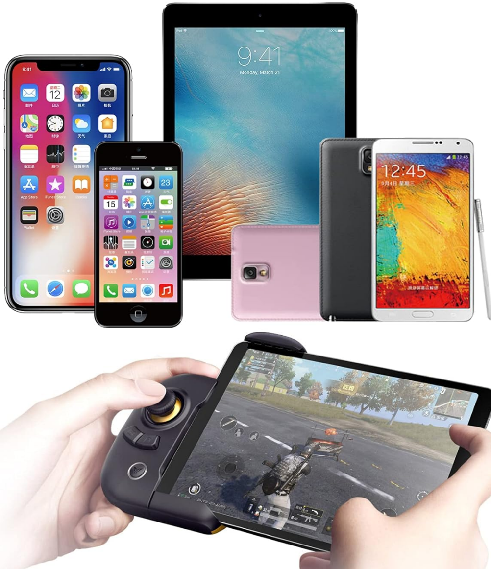
Image: A visual representation of the controller's wide compatibility across different mobile phones and tablets.

Compatible with Android and ios, Mobile phones and Tablets/ipad