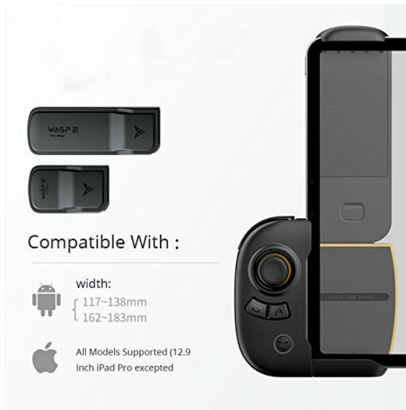
Image: FLYDIGI Wasp 2 controller with two different sized cradles, illustrating compatibility with various Android and iOS device widths.