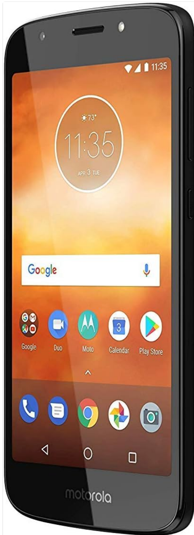
Figure 3: Angled front view of the Motorola Moto E5 Play, showing the display and icons.