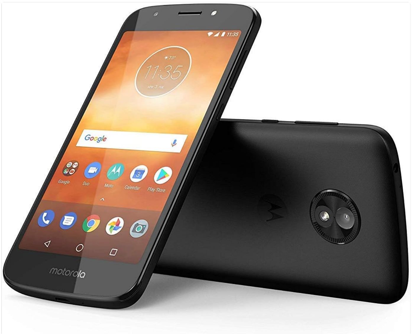
Figure 4: Front and back angled view of the Motorola Moto E5 Play.