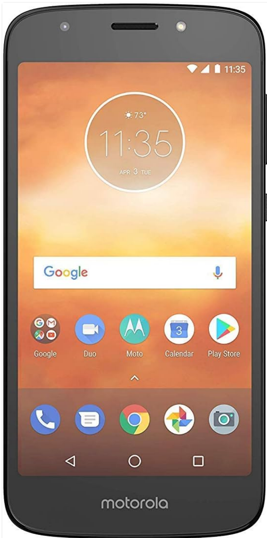
Figure 1: Front view of the Motorola Moto E5 Play.