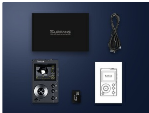
The Surfans F20 package includes the player, USB cable, and user manual.

Carefully open the product packaging and ensure all components are present. The standard package includes the Surfans F20 player, a USB charging/data cable, a pre-installed 64GB micro SD card, and this user manual.