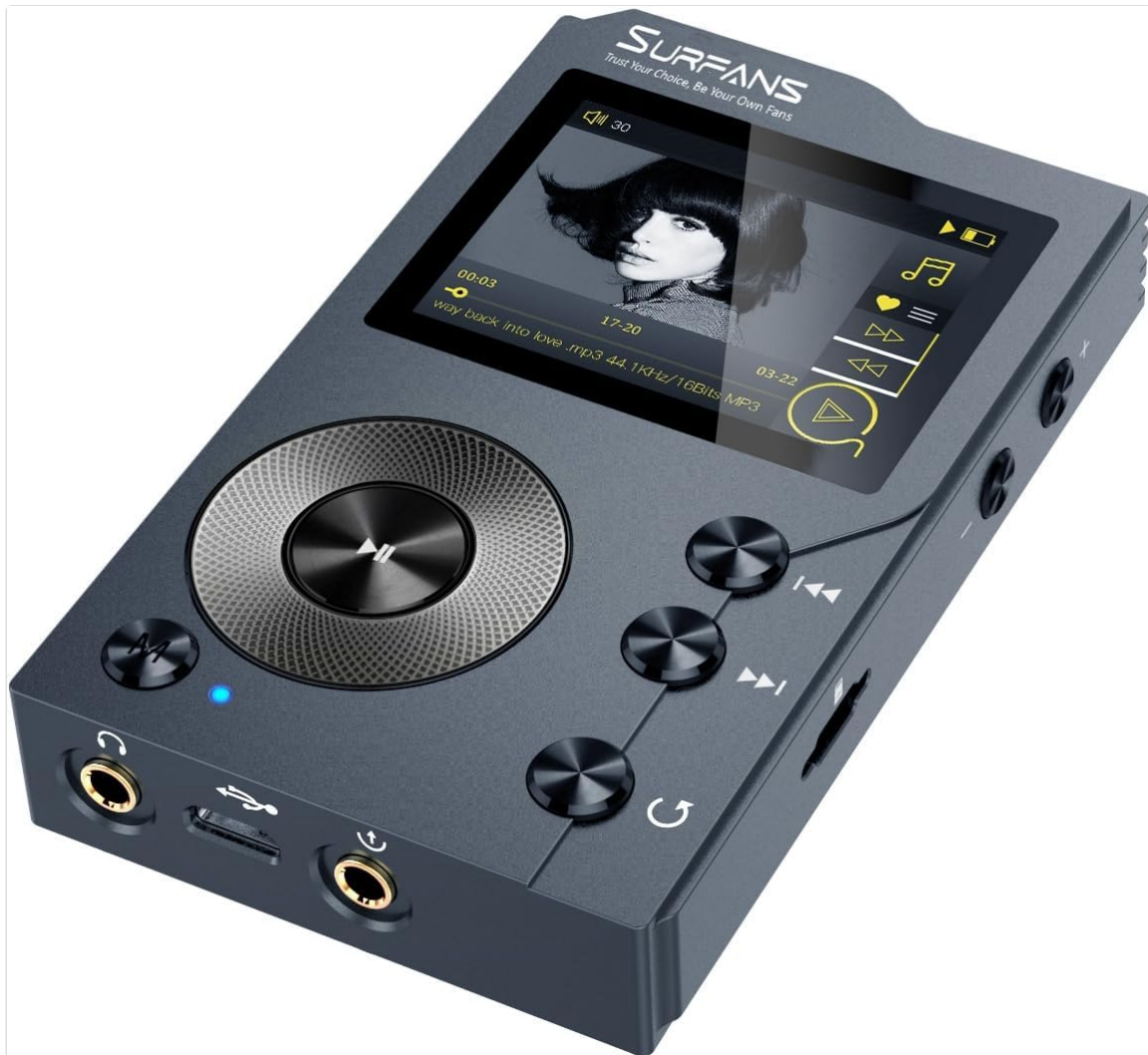
Front view of the Surfans F20 HiFi MP3 Player, showcasing its display, scroll wheel, and control buttons.