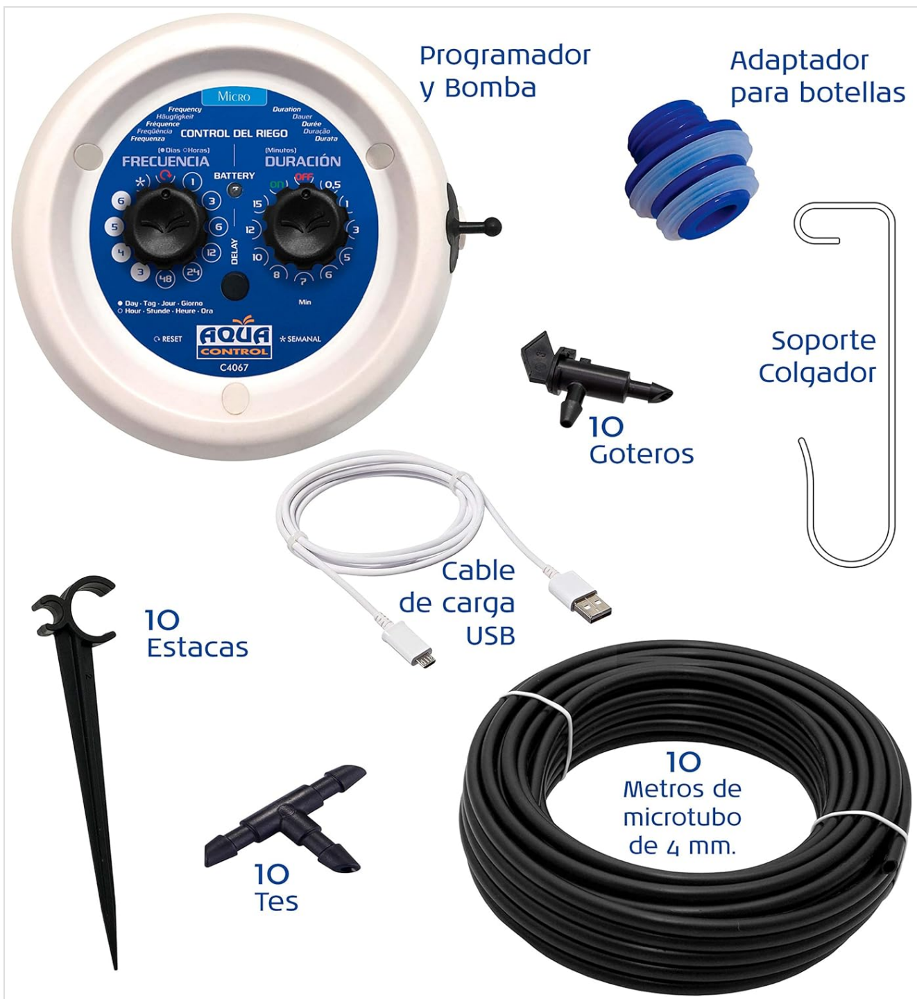
Image: All components of the Aqua Control C4067 irrigation set.