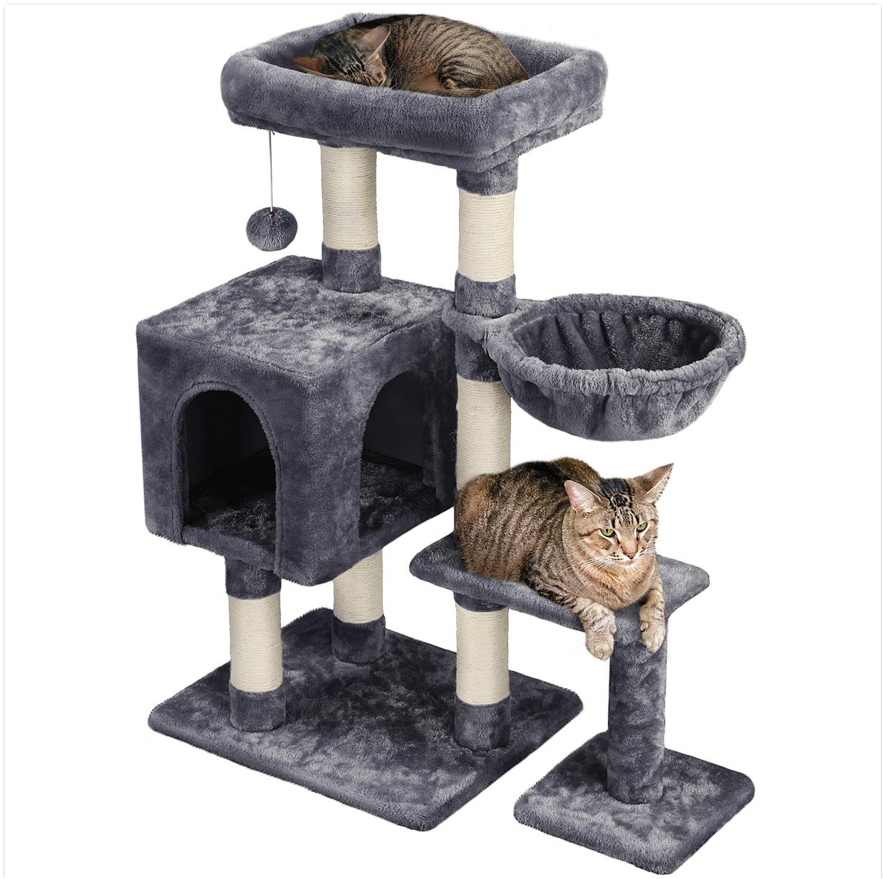
Image 1.1: Overall view of the Yaheetech 96cm Multi-Level Cat Tree.