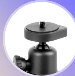
360° panning bed & 90° tilt