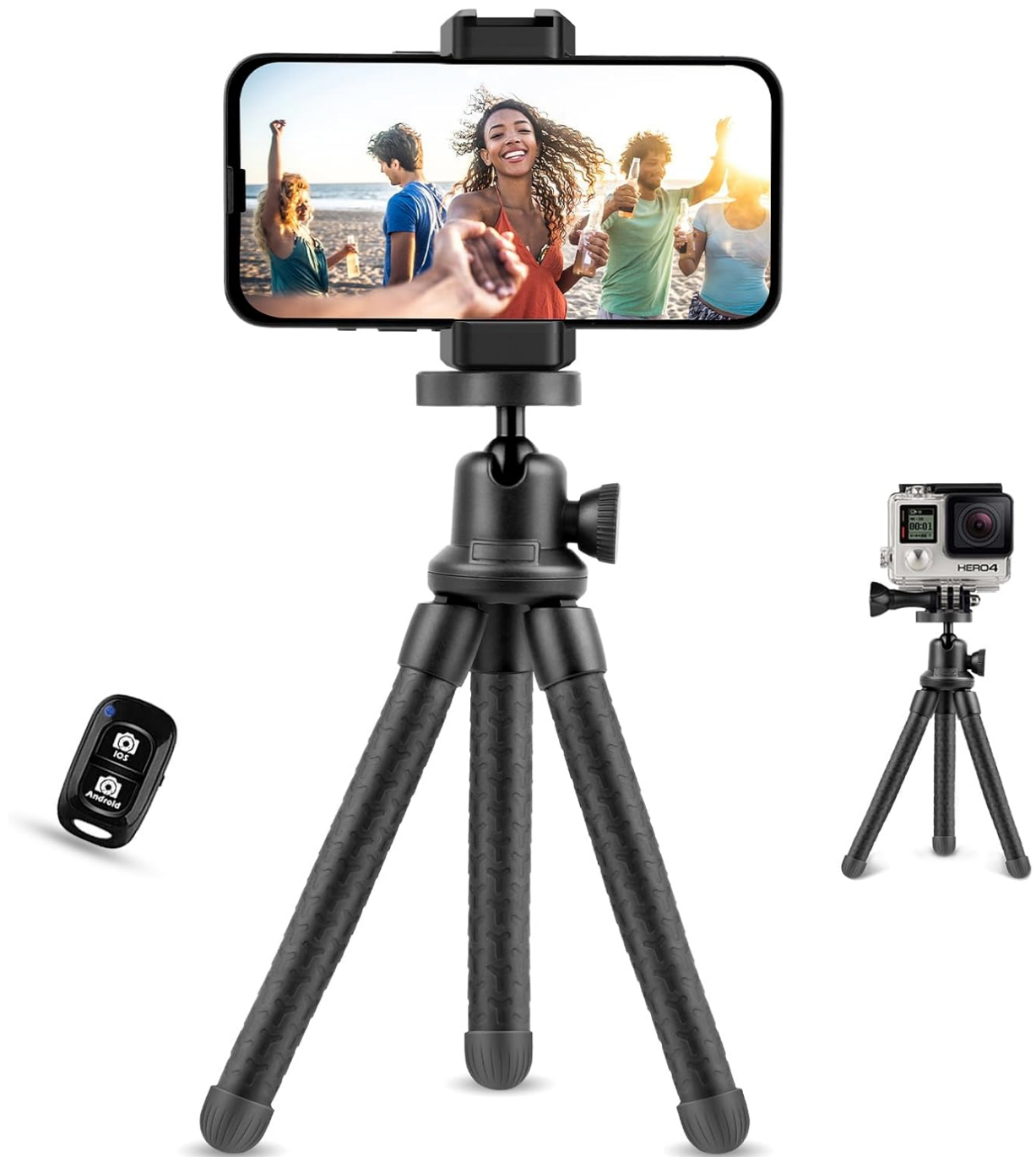
Image 2.1: The UBeeSize TBC001 Flexible Tripod, shown with a smartphone mounted and the Bluetooth remote control.