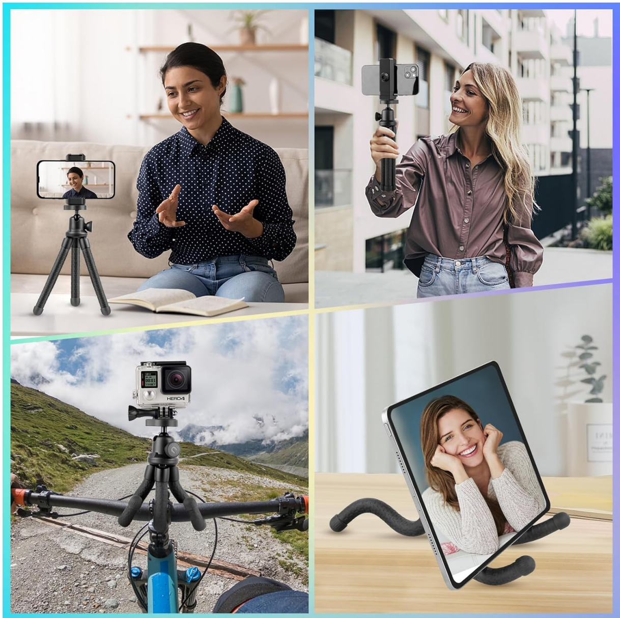
Image 4.1: Examples of the tripod's versatility, including use as a tabletop stand, a handheld grip, mounted on a bicycle, and as a flexible stand for a tablet.