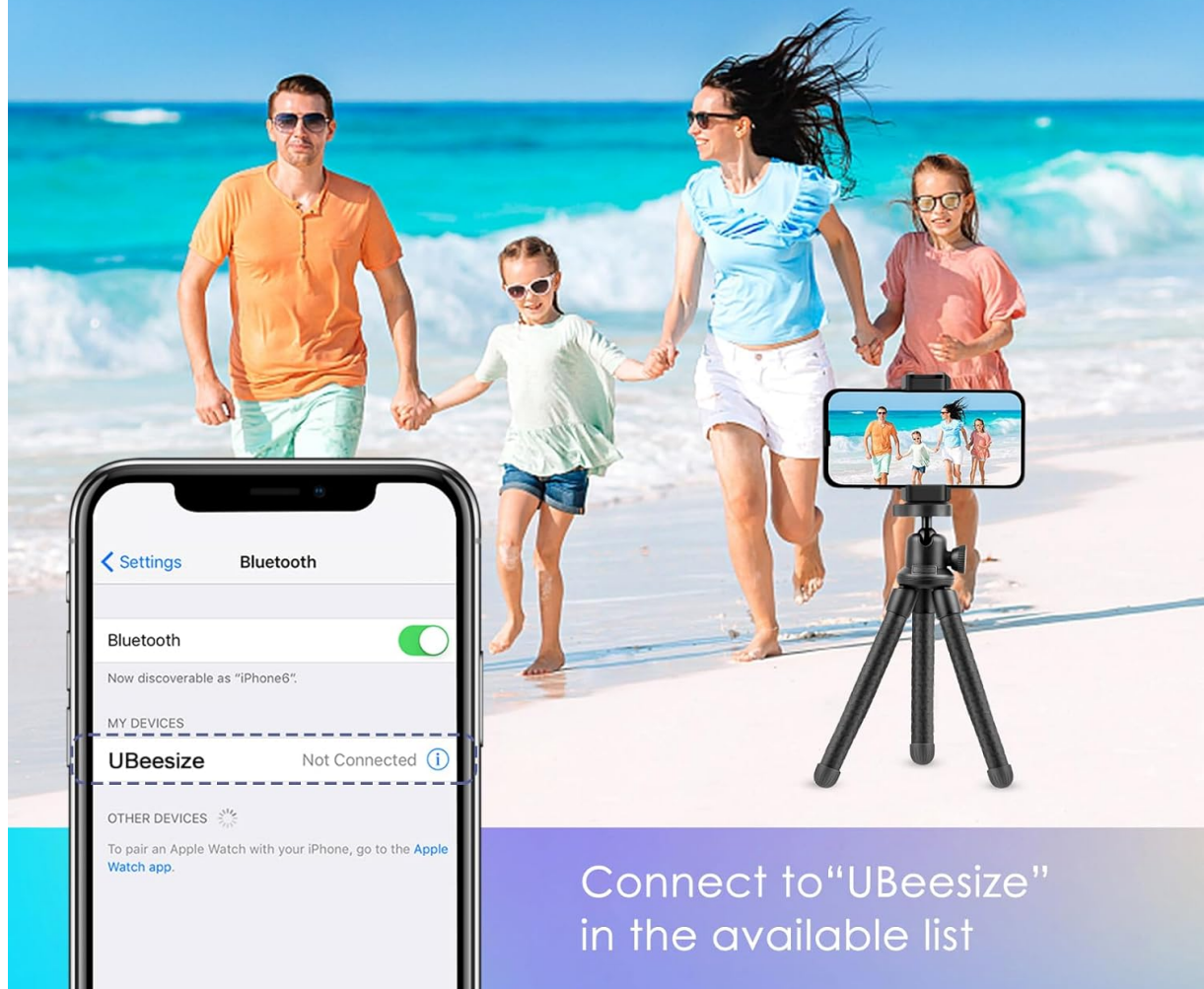
Image 3.3: Visual guide for pairing the wireless Bluetooth remote with a smartphone, showing the device listed as "UBeesize" in the Bluetooth settings.

Allow 10m/33ft distance Photo/Video taking