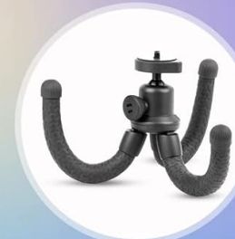
Flexible & Durable legs