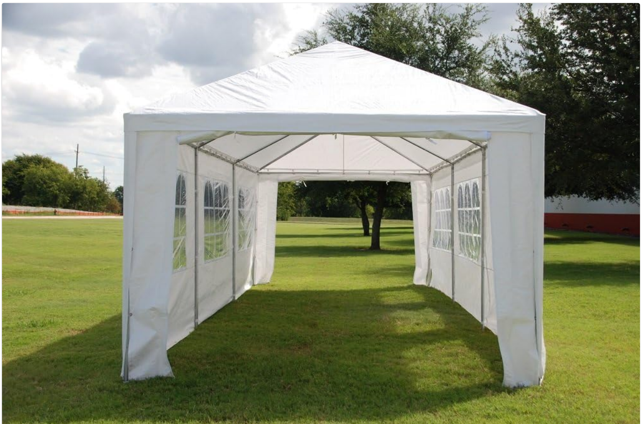
Image 3: A front view of the assembled tent, showing the entrance and windowed sidewalls.