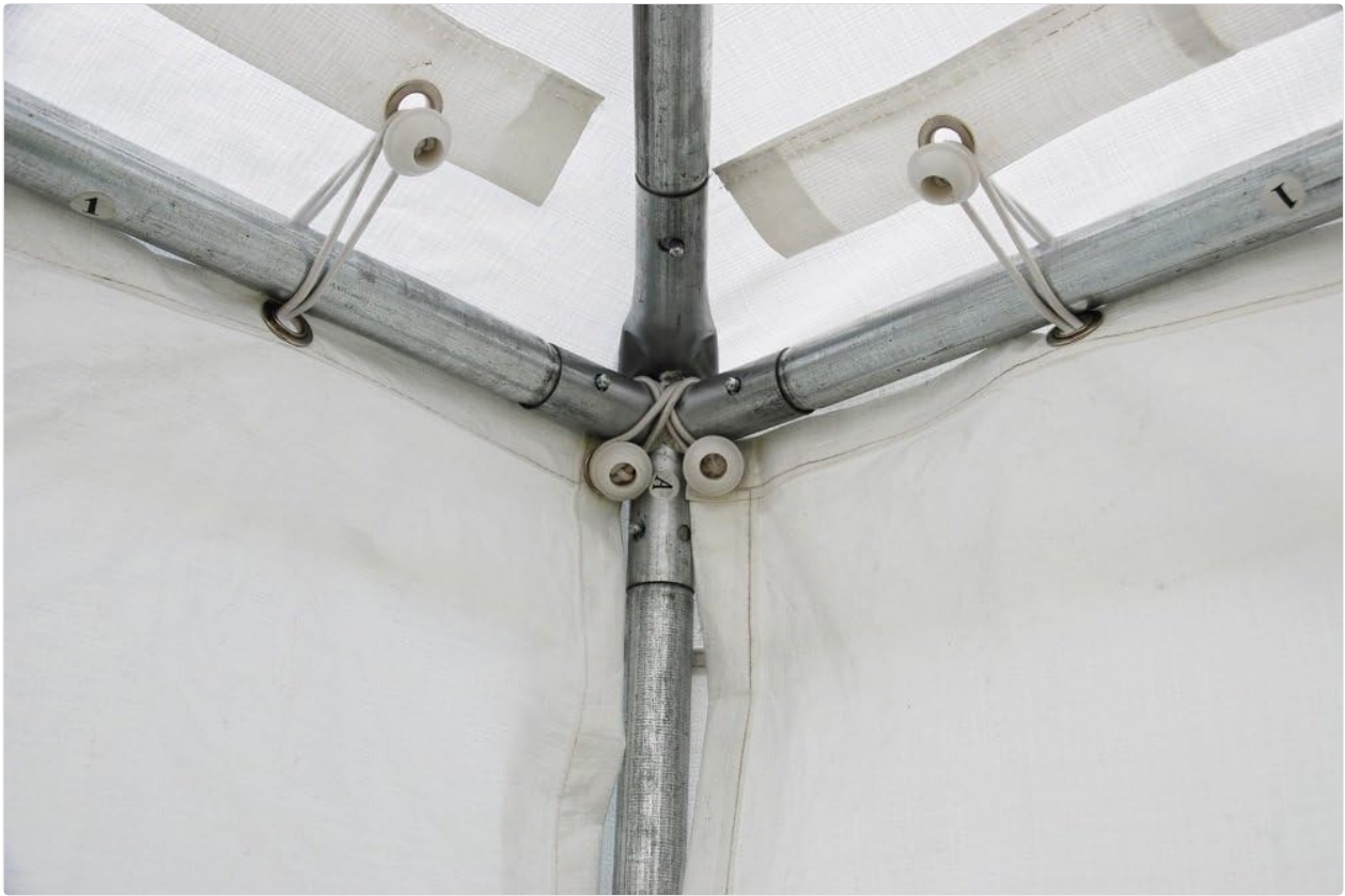
Image 4: Detail of the galvanized steel frame and metal connectors, illustrating a secure joint.