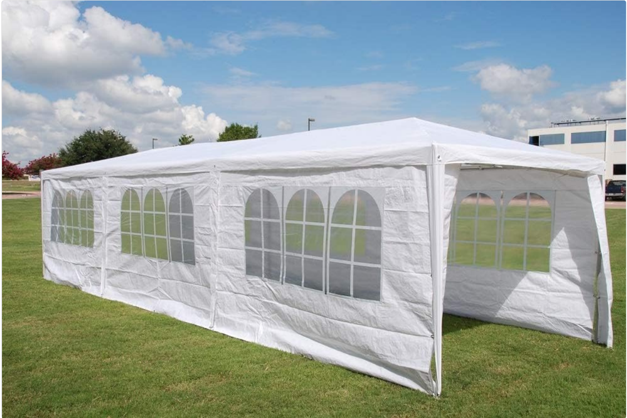
Image 2: The tent fully assembled on a grassy area, showcasing its side profile.