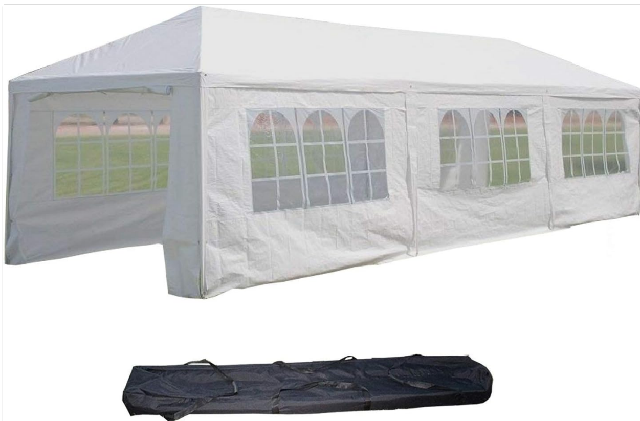
Image 1: The DELTA 10'x30' WDMT PE Wedding Party Tent shown with its included carry bag.