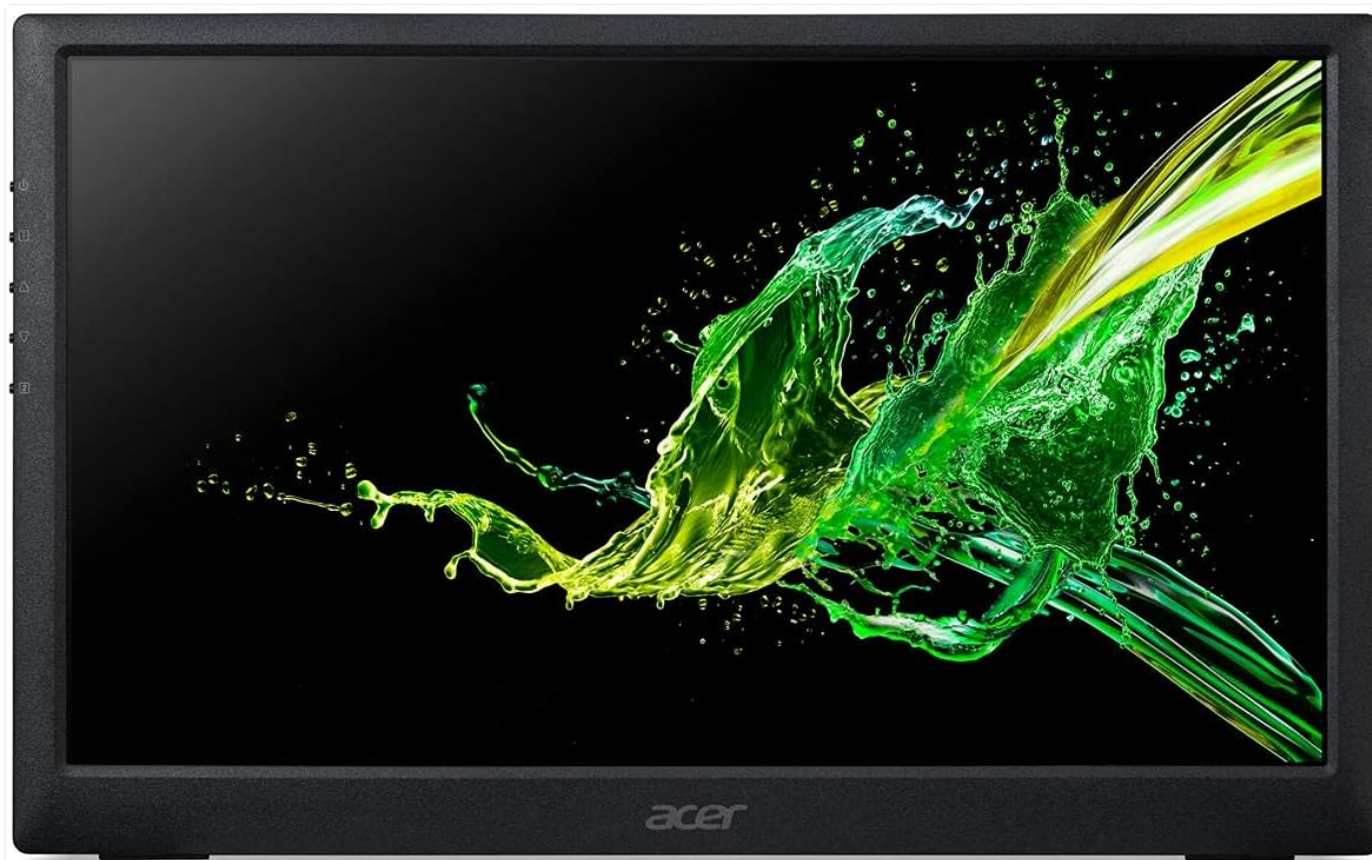
Figure 1: Front view of the Acer PM161Q bu Portable Monitor.

The Acer PM161Q 15.6" portable monitor offers Full HD (1920 x 1080) resolution, providing a high-definition viewing experience. It features IPS technology for accurate color performance and wide viewing angles (170° Horizontal, 170° Vertical). Designed for portability, it has a slim 0.79" profile and weighs only 2.1 lbs, making it easy to transport in notebook bags. This monitor is an ideal secondary display for work, study, or dual-monitor presentations, offering a versatile portable solution.