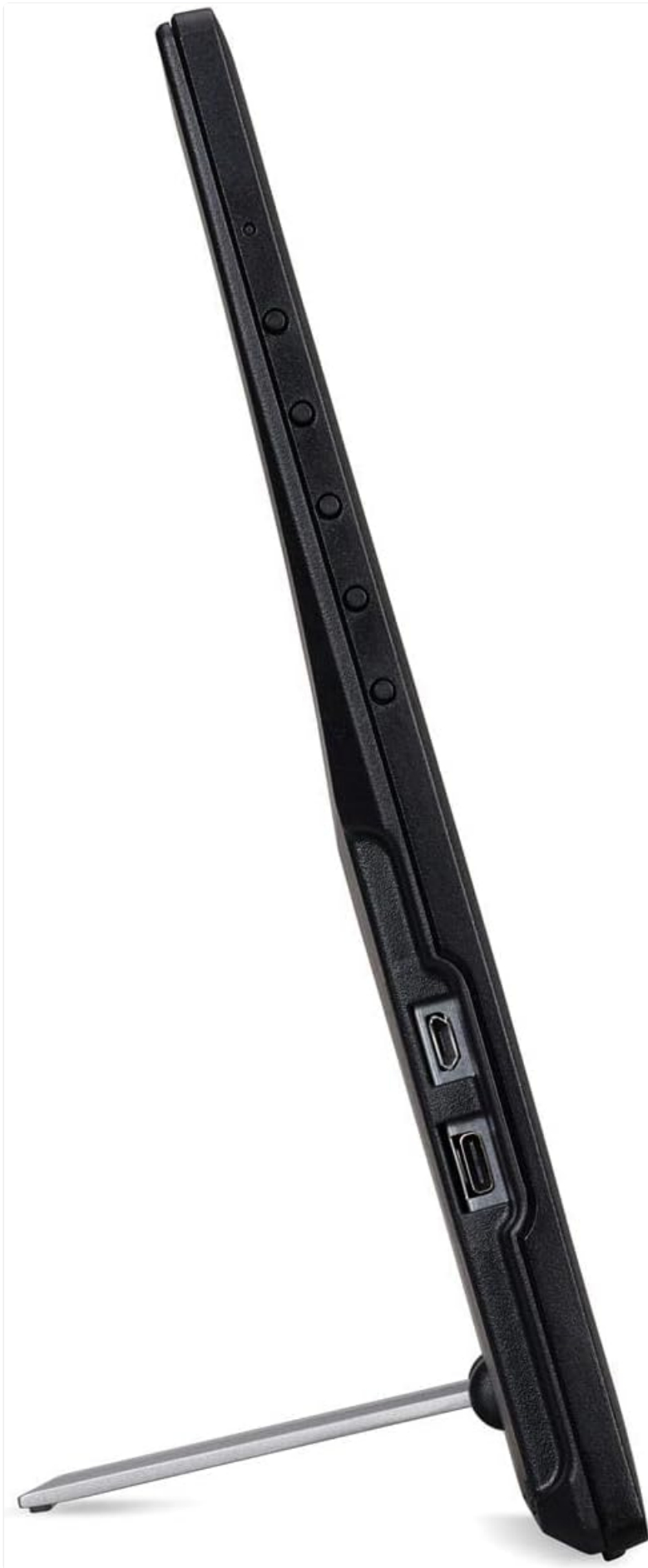
Figure 2: Side view illustrating the USB Type-C and Micro USB ports.