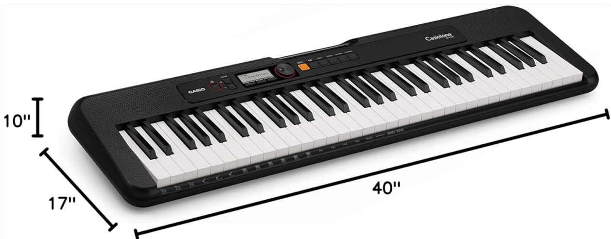
Figure 8.1: Approximate dimensions of the Casio Casiotone CT-S200.