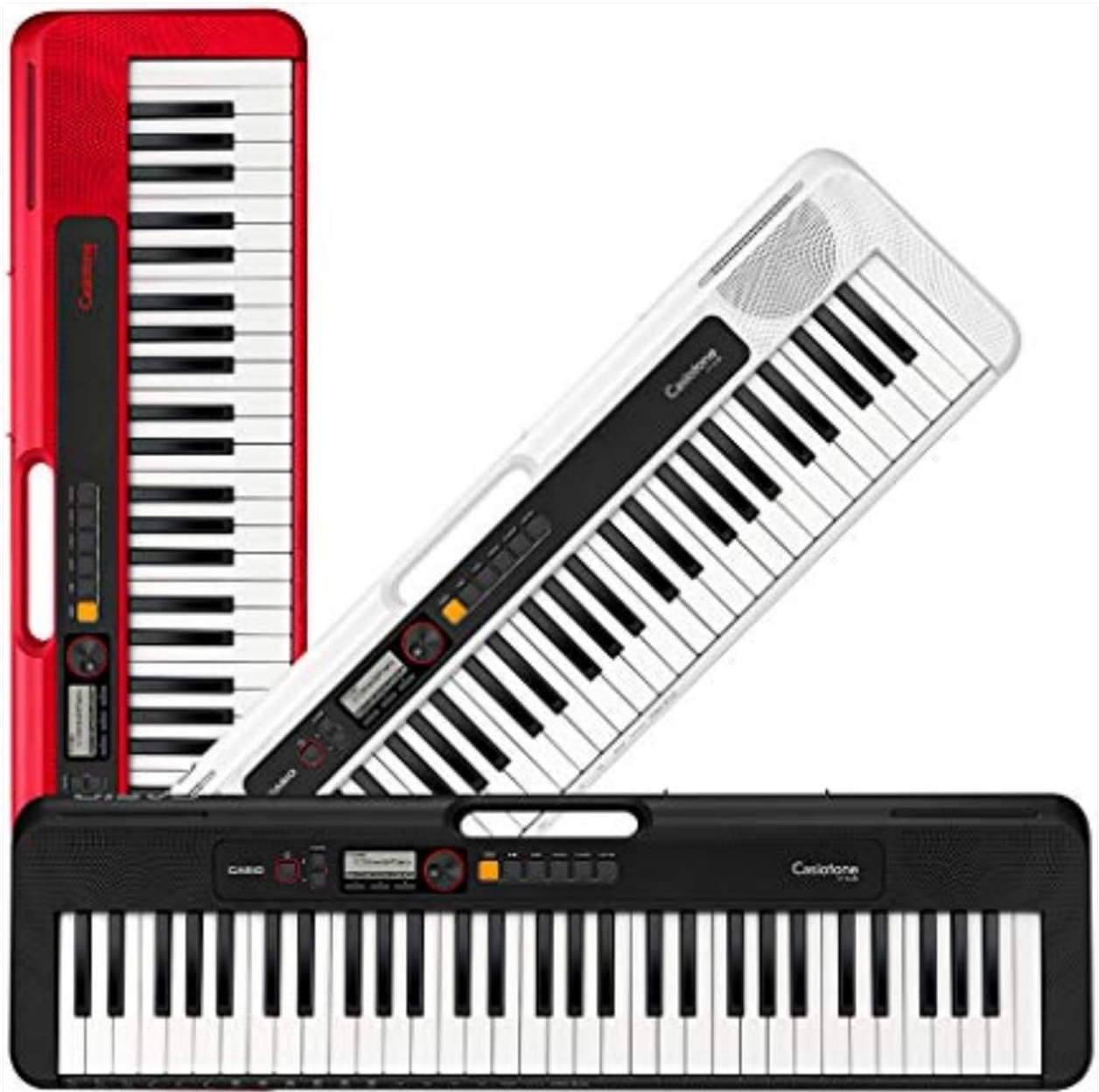
Figure 3.1: Front view of the Casio Casiotone CT-S200 portable keyboard.

The Casio Casiotone CT-S200 is a compact and lightweight 61-key portable keyboard. It features an intuitive control panel, built-in speakers, and a convenient carrying handle for easy transport.