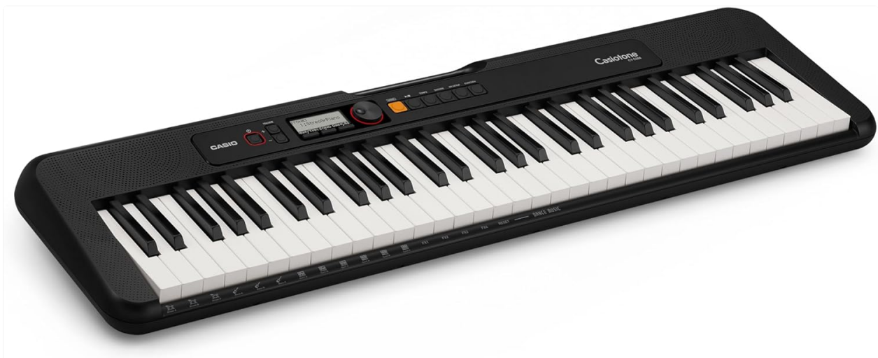
Figure 3.3: The integrated carrying handle allows for easy portability of the keyboard.

The keyboard's design emphasizes portability and ease of use, making it suitable for practicing at home, taking to lessons, or playing on the go.