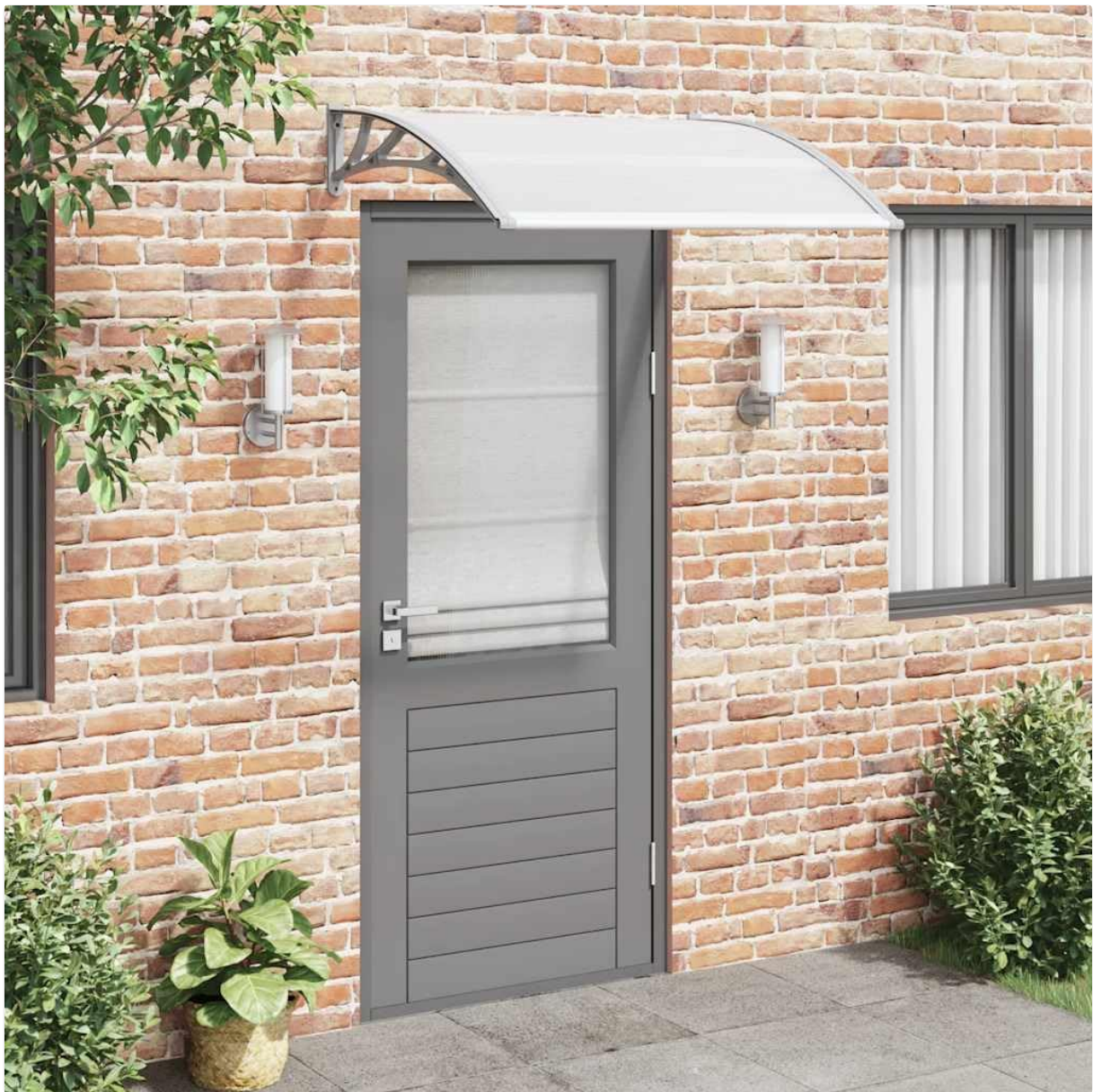
Image 1.1: The vidaXL Door Awning providing shelter over an entrance.