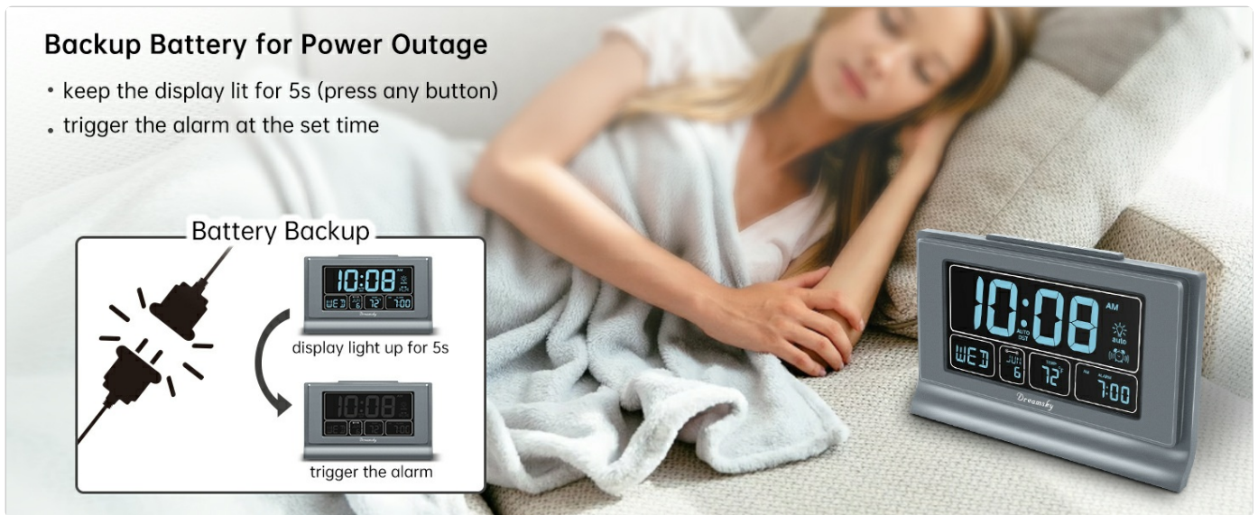
Figure 2.2: Battery Backup for Power Outage. This image explains how the clock functions during a power loss, keeping the display lit briefly and triggering the alarm.