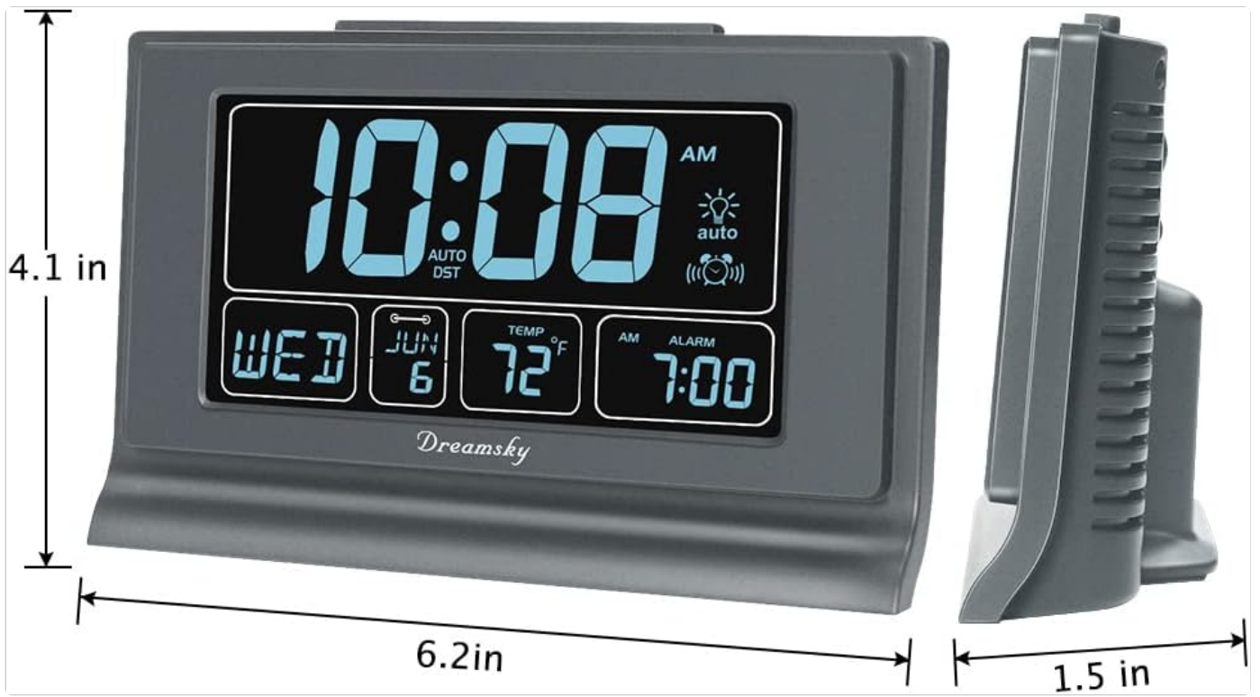
Figure 6.1: Product Dimensions.