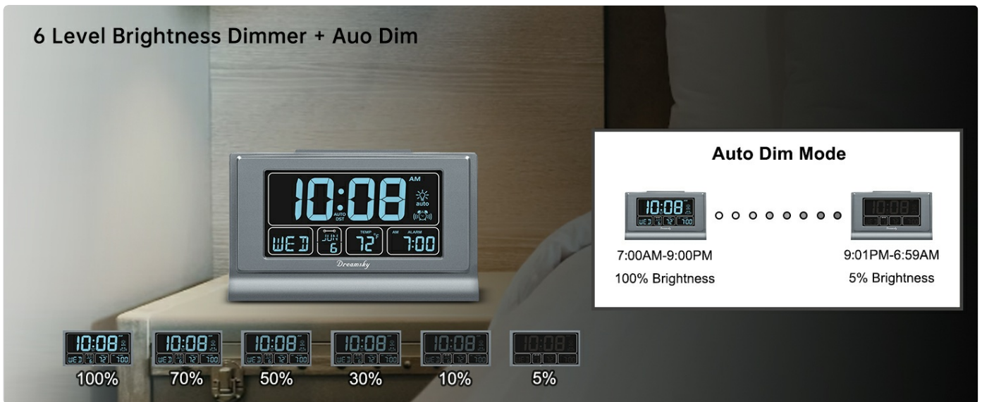
Figure 3.4: 6-Level Brightness Dimmer and Auto Dim feature.