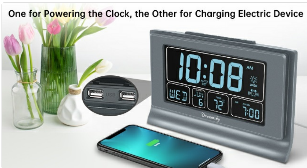
Figure 3.5: USB charging ports for electronic devices.