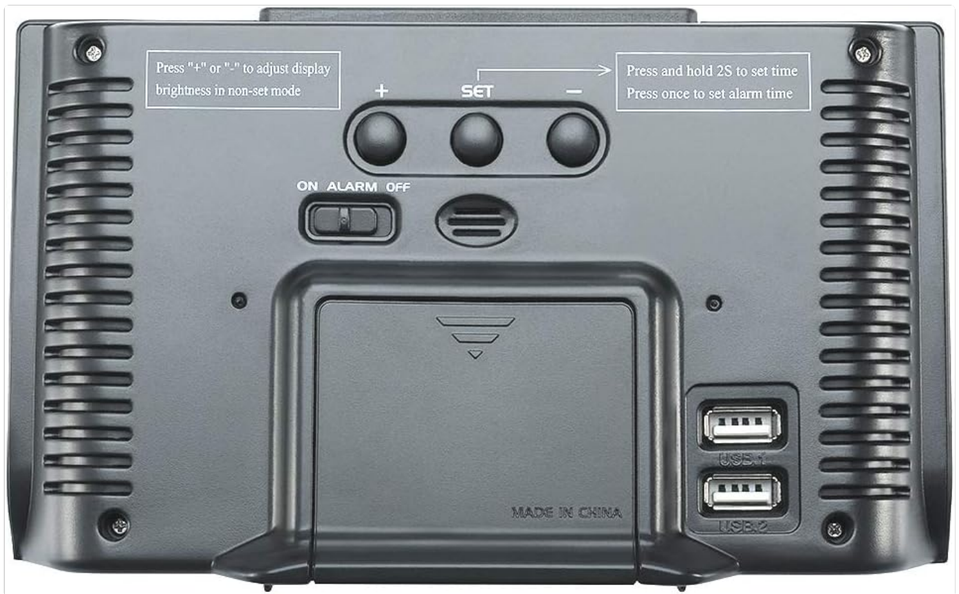
Figure 2.3: Rear panel controls of the alarm clock. This image highlights the location of the setting buttons and USB ports.