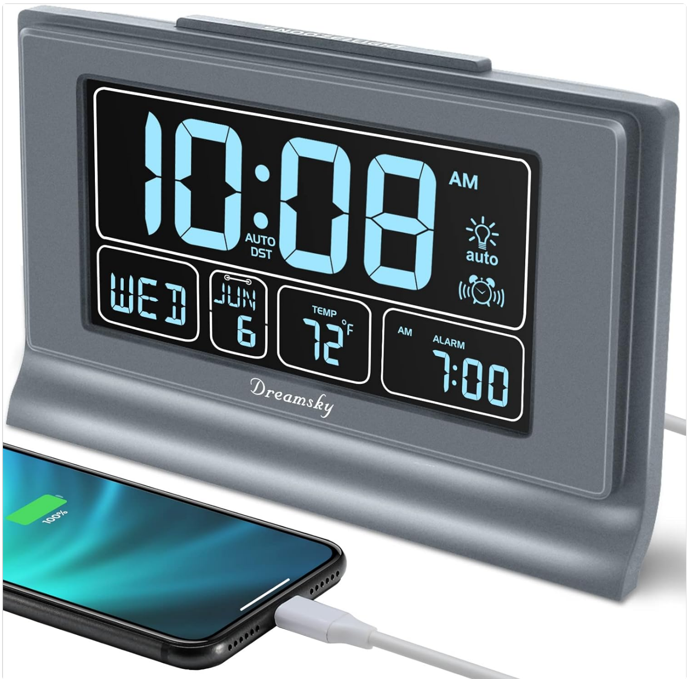
Figure 1.1: DreamSky Digital Alarm Clock (Model DS313) with a smartphone connected for charging.