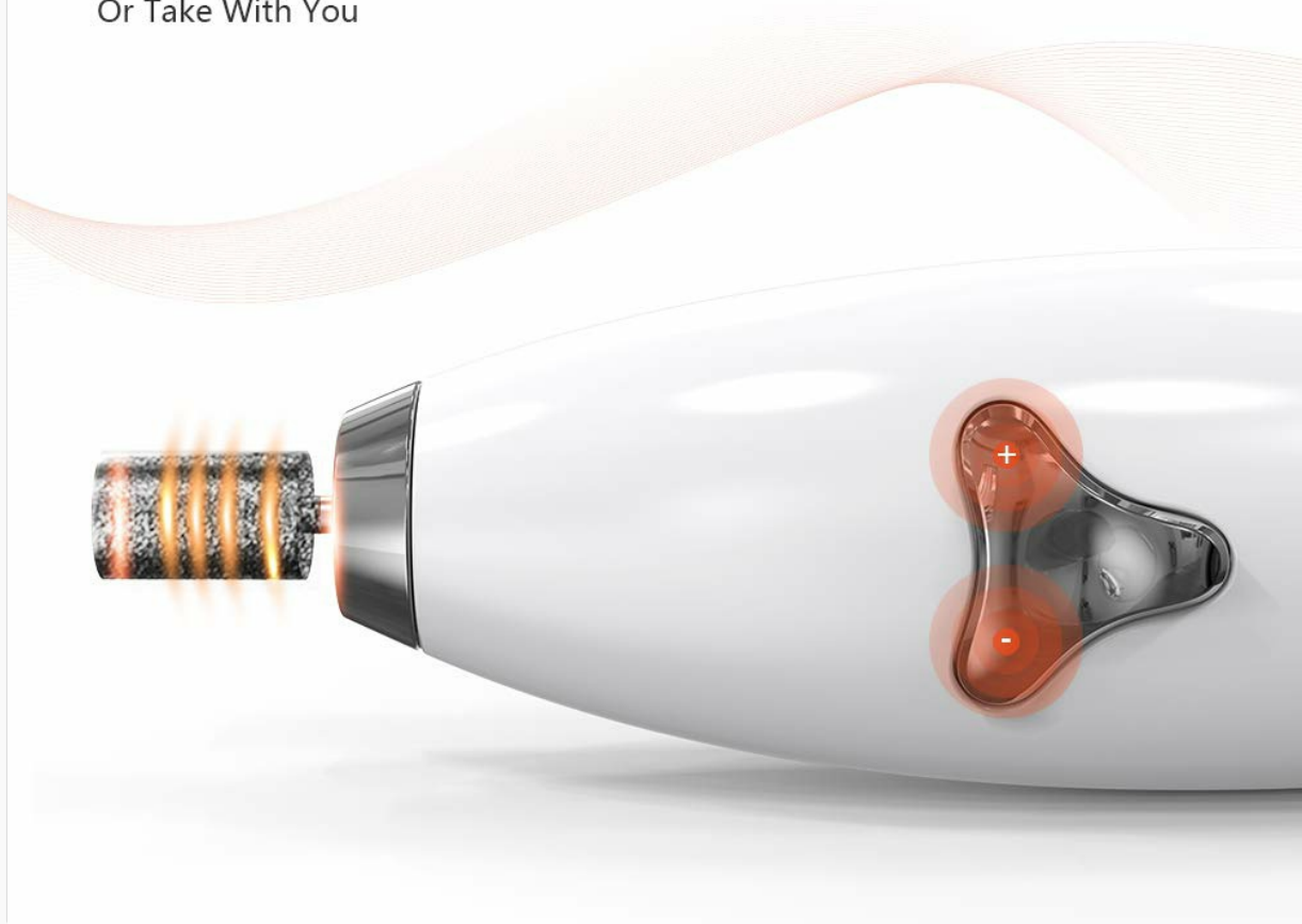
Figure 3: Example of using the Tungsten Steel Head for nail gel removal.

A Storage Case For You To Neatly Pack Away Or Take With You