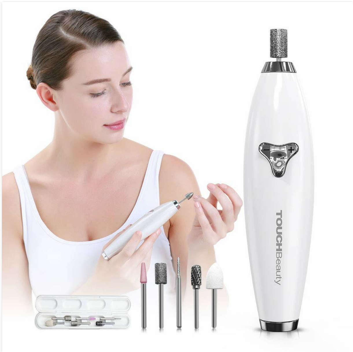
Figure 1: TOUCHBeauty TB-1733 Electric Nail Drill and its key features.