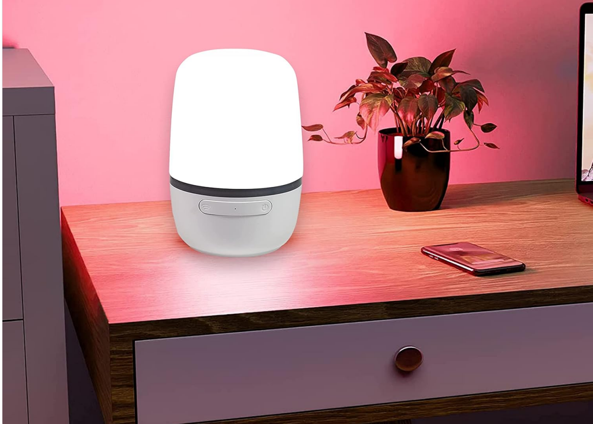
Figure 5: 16 million color options. This image highlights the lamp's extensive color palette, showing it illuminating rooms in different hues like pink and blue.

Change light color or dim the lights to set the perfect mood for any occasion.