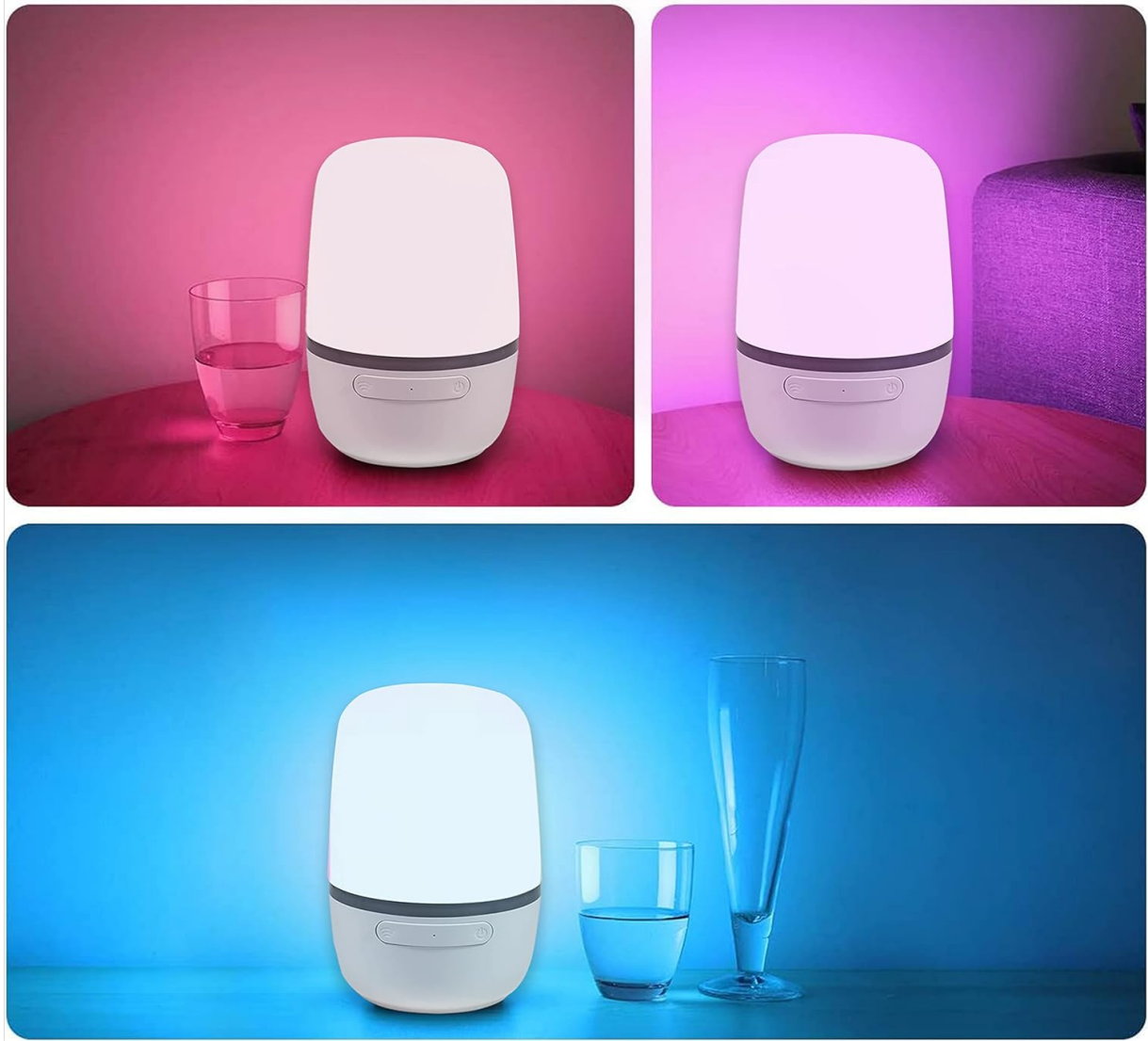
Figure 2: Ematic Smart Lamp displaying a range of colors. This image illustrates the lamp's ability to emit different colors, such as pink, purple, and blue, to suit various moods or settings.