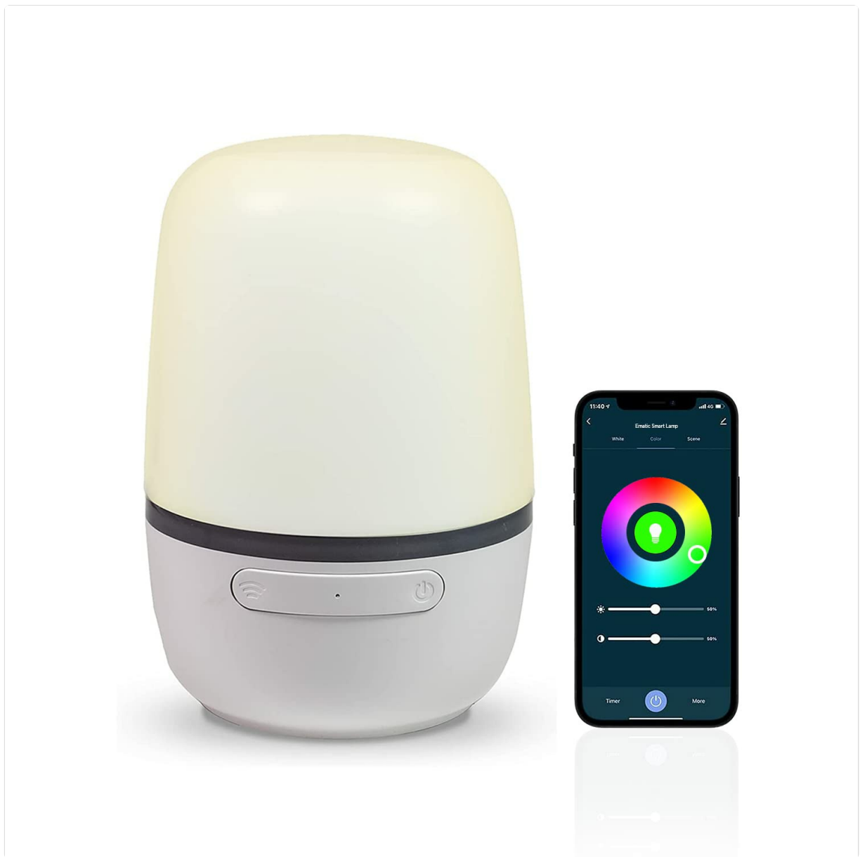
Figure 1: Ematic Smart Lamp EMSL420. This image displays the compact design of the smart lamp, highlighting its white light diffuser and grey base.