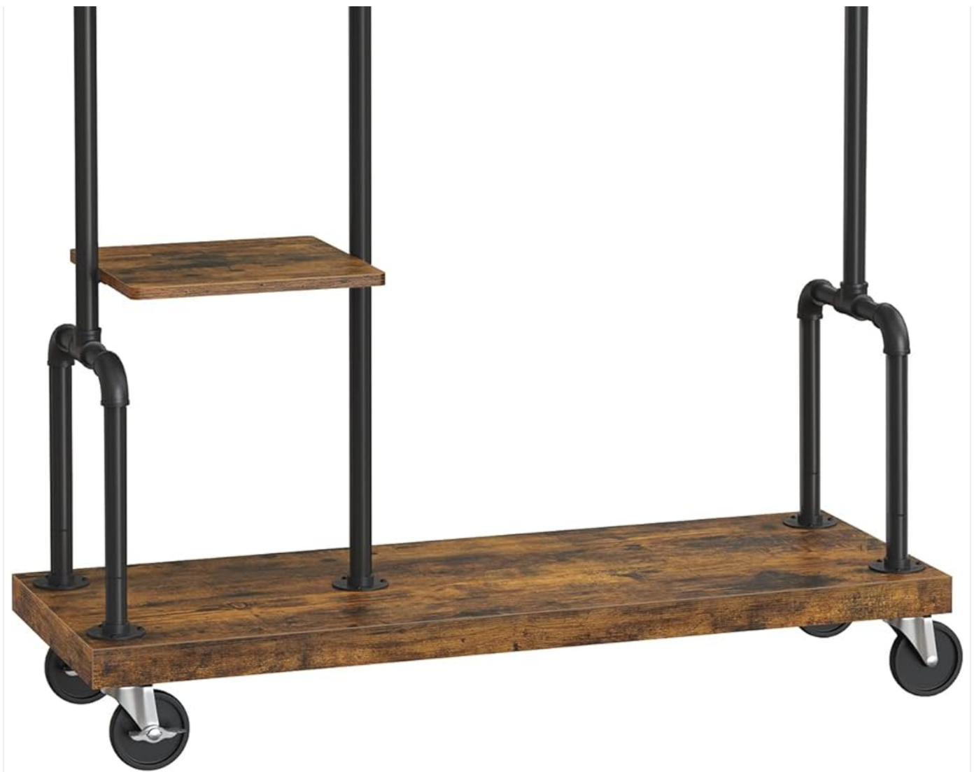
Image: Front view of the VASAGLE Clothes Rack, showcasing its industrial pipe design and rustic brown shelves.