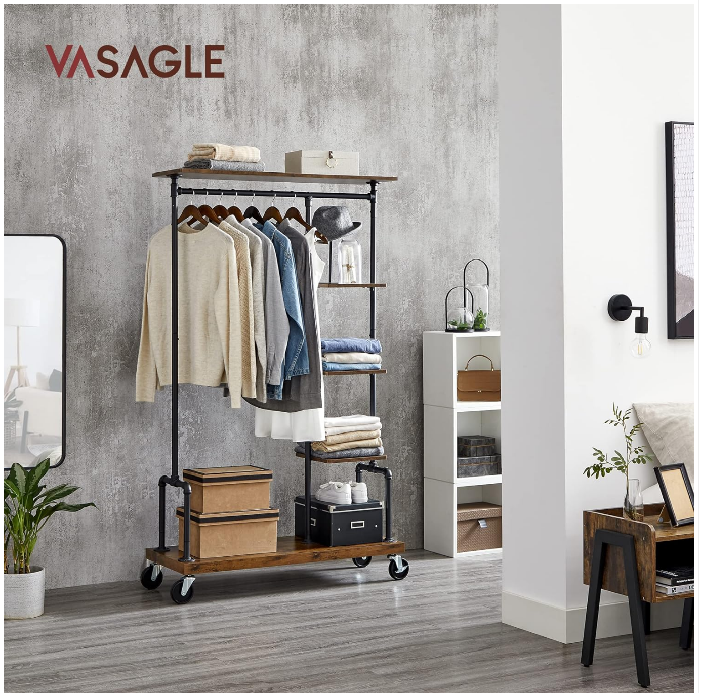
Image: The clothes rack positioned in a room, displaying various garments, shoes, and accessories on its hanging rod and shelves.