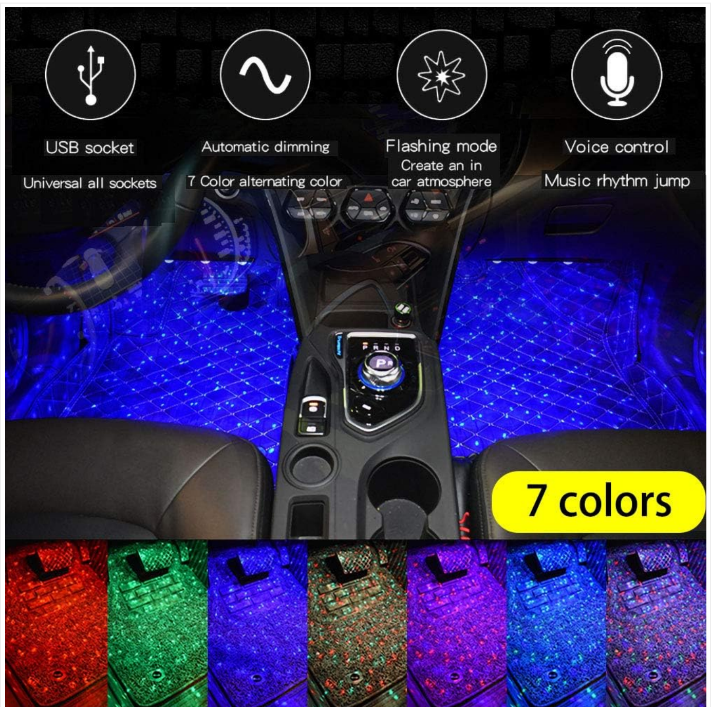
Figure 2.2: Feature Overview. This image highlights the main functionalities including USB power, automatic dimming, flashing modes for atmosphere creation, and voice control for music synchronization.