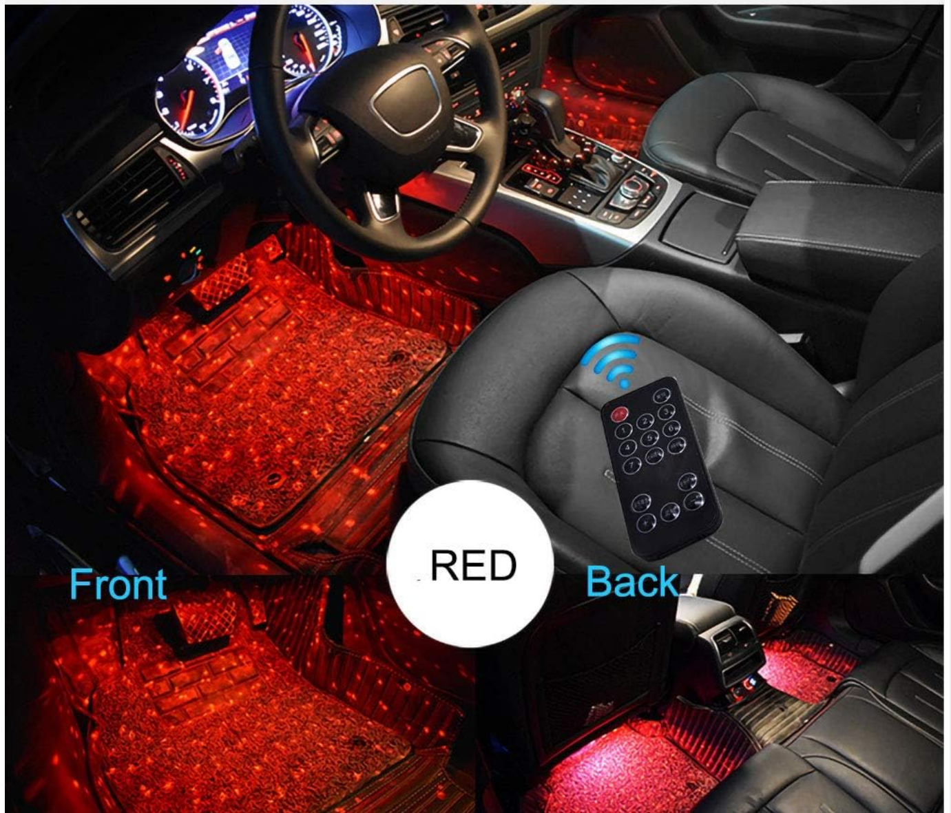
Figure 3.1: Lights Position and Effect. This image demonstrates typical installation points for the LED light bars in both front and rear passenger footwells, illustrating the projected light patterns.