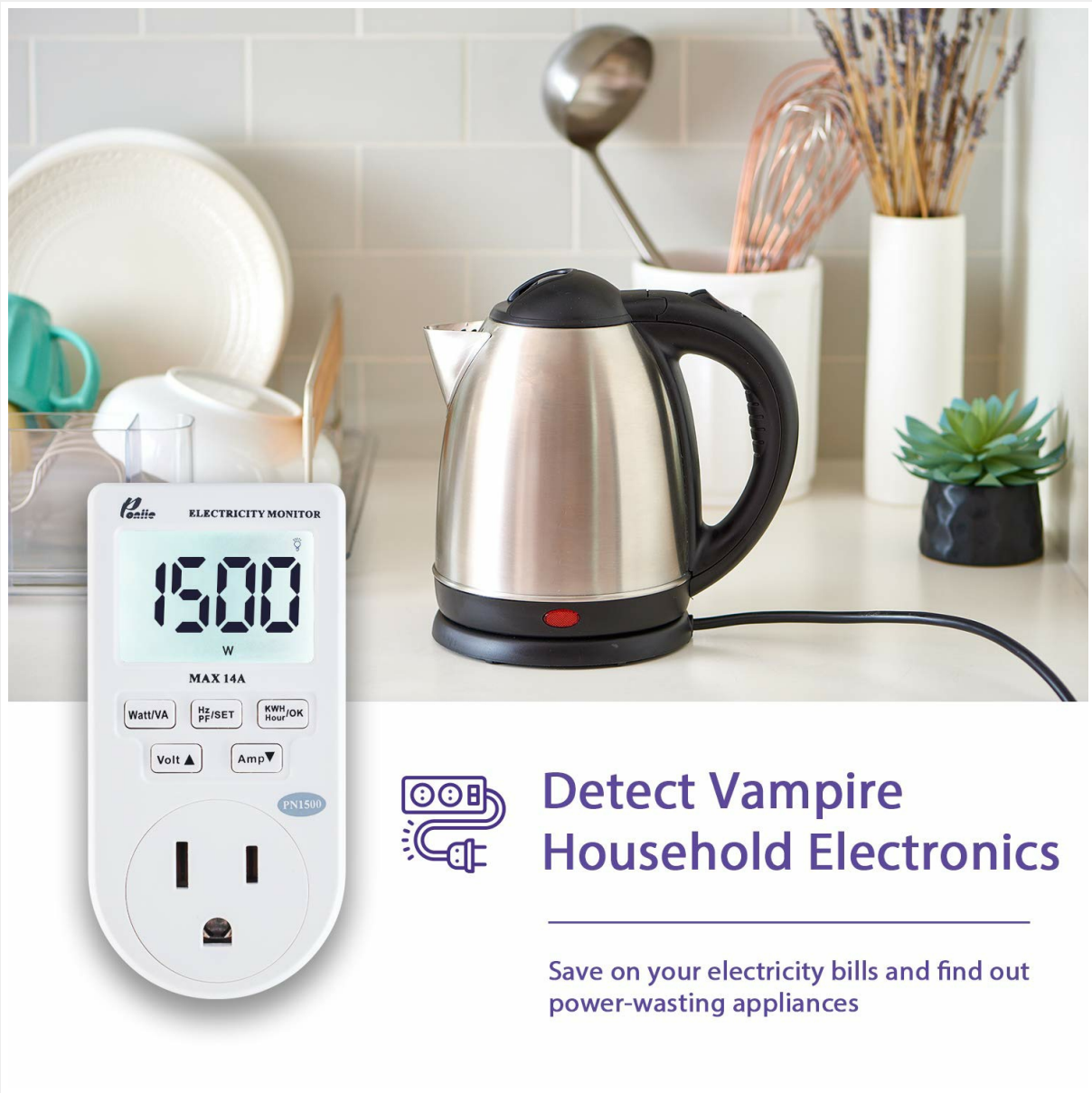
Figure 5.1: The Ponii PN1500 displaying power consumption while monitoring a kitchen kettle, illustrating its use in identifying energy usage.