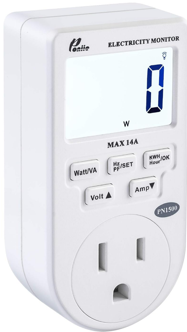
Figure 3.1: Front view of the Ponie PN1500 Electricity Usage Monitor, showing the display, control buttons, and power outlet.

The Ponie PN1500 features a compact design with a large LCD display and intuitive control buttons. The device plugs directly into a standard 110V wall outlet, providing a pass-through outlet for the appliance to be monitored.