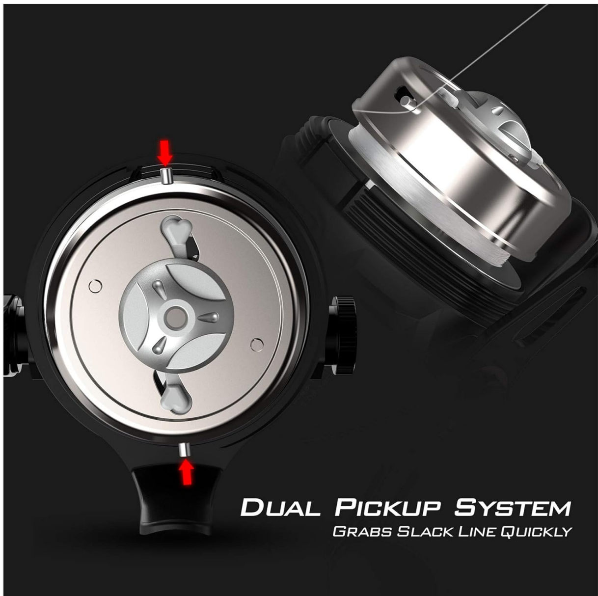
Image: A detailed view of the KastKing Brutus Spincast Reel's Dual Pickup System, showing the two pins that grab the fishing line quickly.