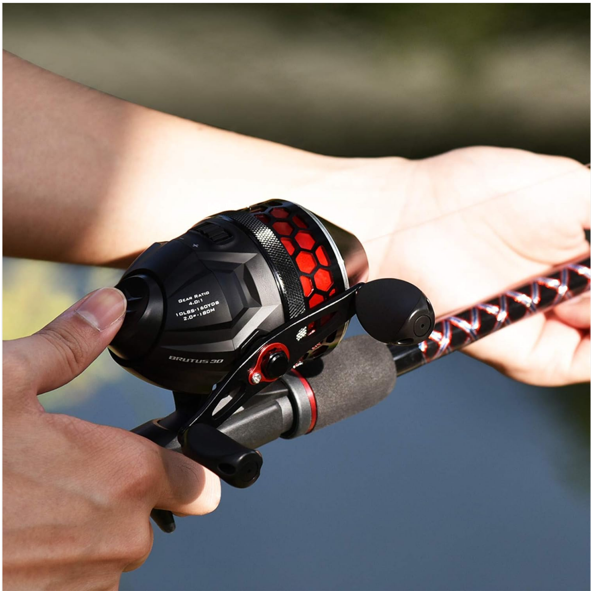
Image: A person demonstrating the push-button casting technique with the KastKing Brutus Spincast Fishing Reel mounted on a rod.