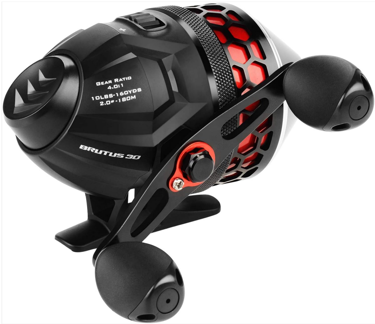
Image: The KastKing Brutus Spincast Fishing Reel Model 30, showcasing its sleek black and red design with dual handle knobs.