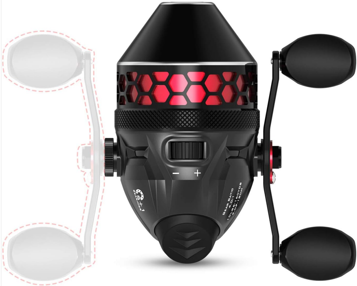
Image: The KastKing Brutus Spincast Fishing Reel highlighting its dual handle knobs and reversible retrieve feature, showing how the handle can be positioned for either left or right-handed use.