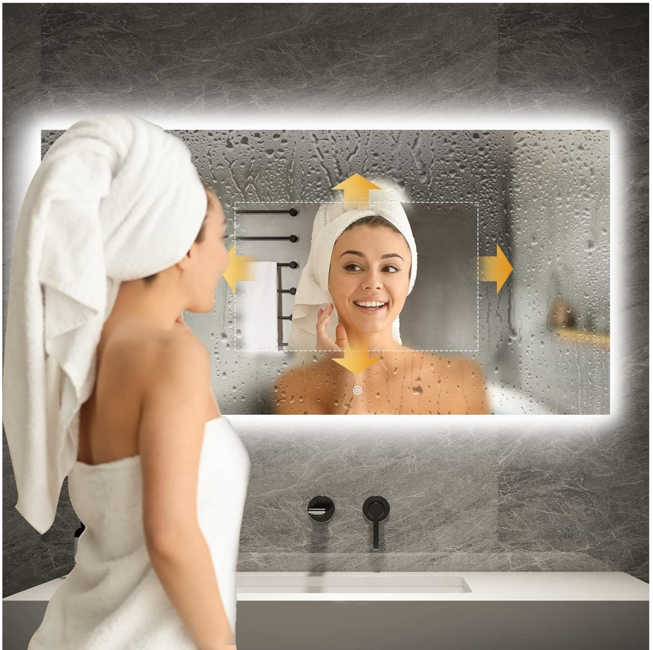
Figure 6: Smart Wi-Fi Connection Display Details