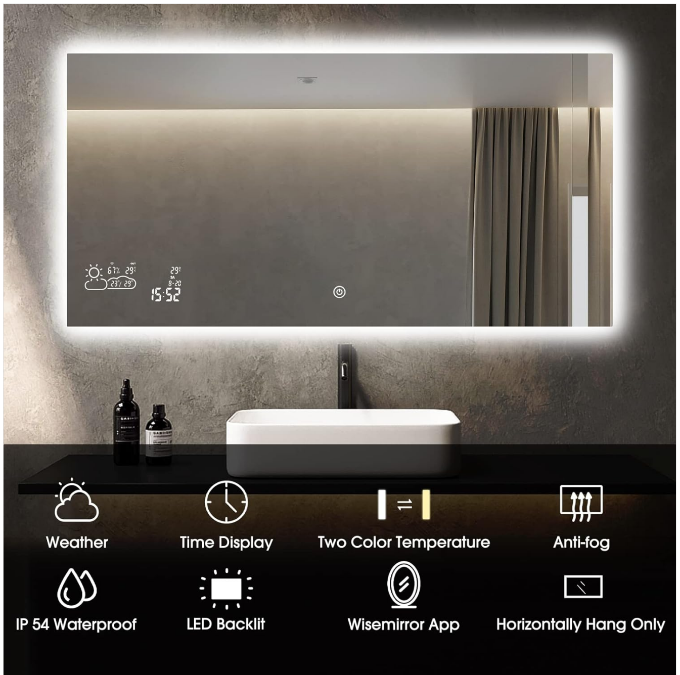
Figure 5: Overview of Smart Features