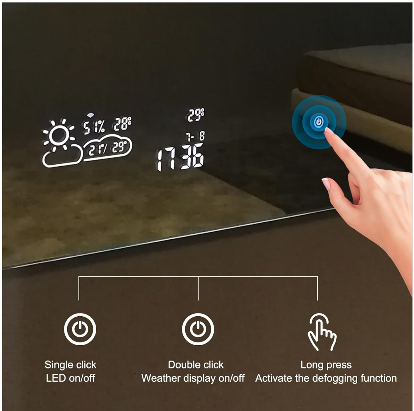
Figure 7: Heated Defogging Function