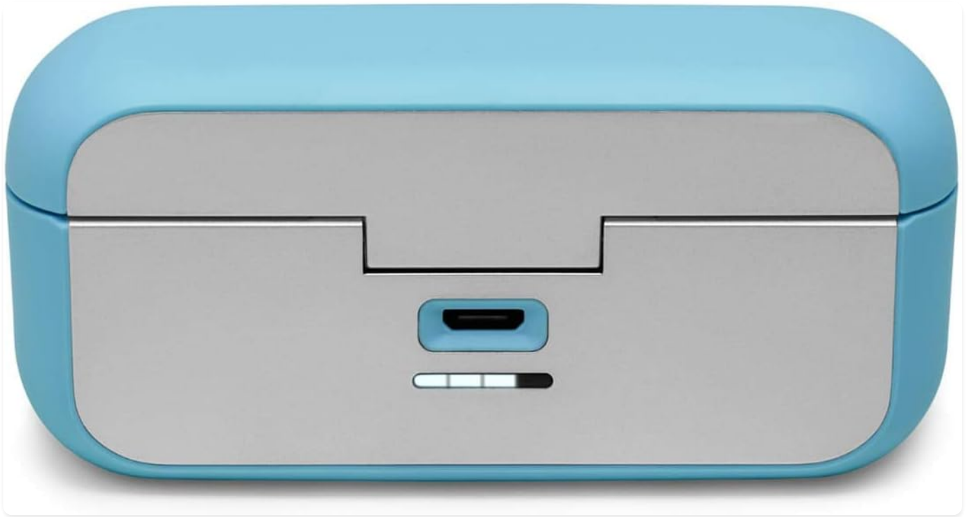
Figure 3: The charging case with its USB-C port and LED battery indicator.