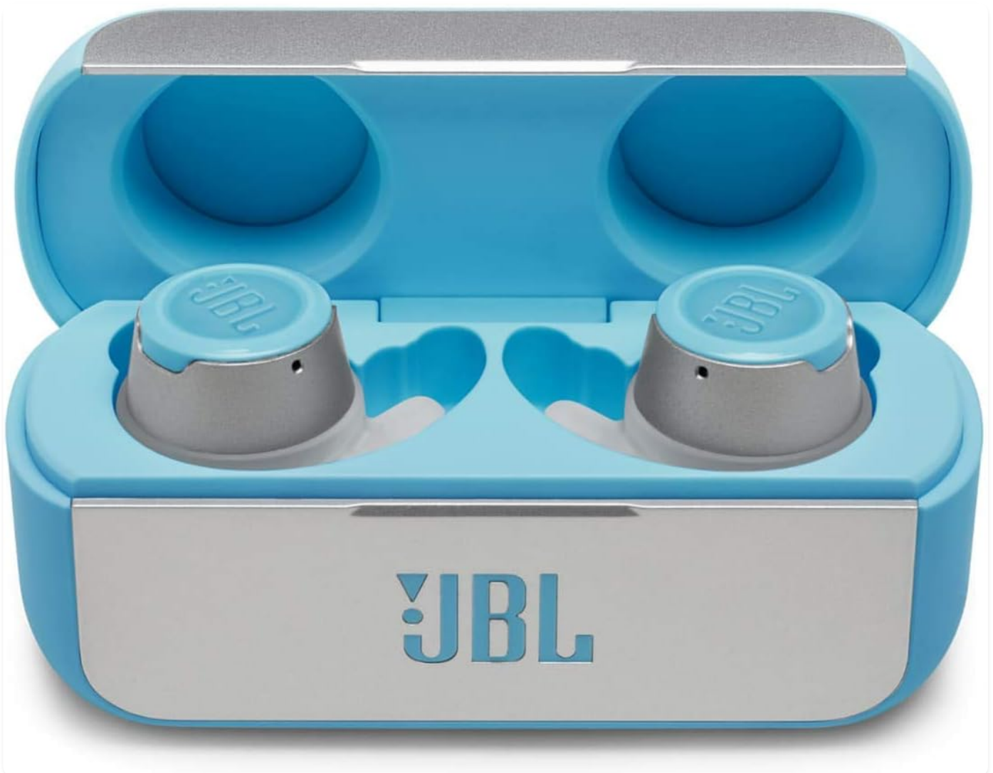
Figure 4: Earbuds correctly placed inside the charging case for charging.