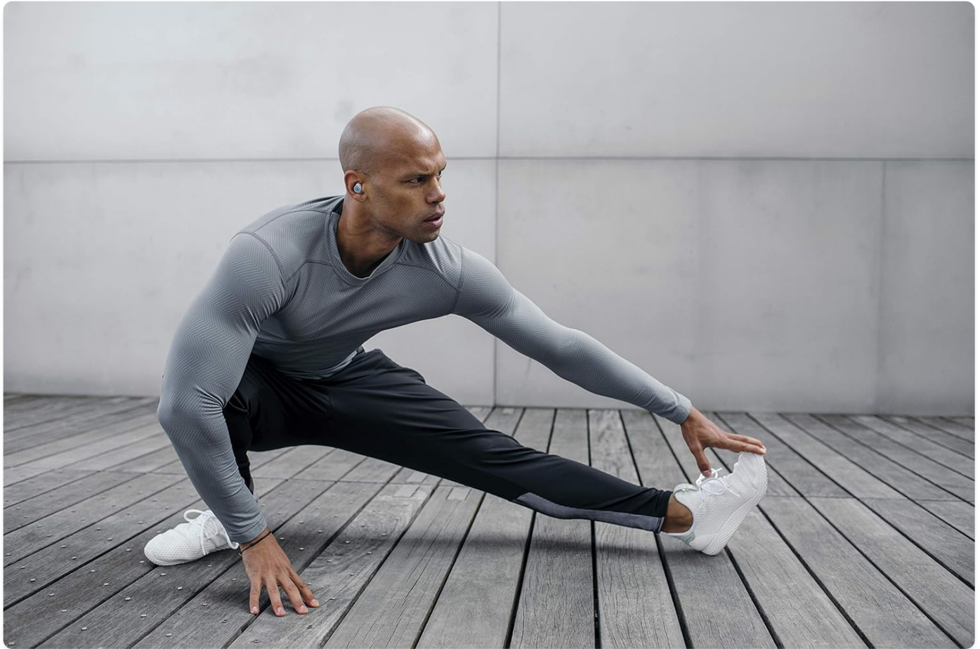
Figure 5: The earbuds are designed for active use, including during exercise.