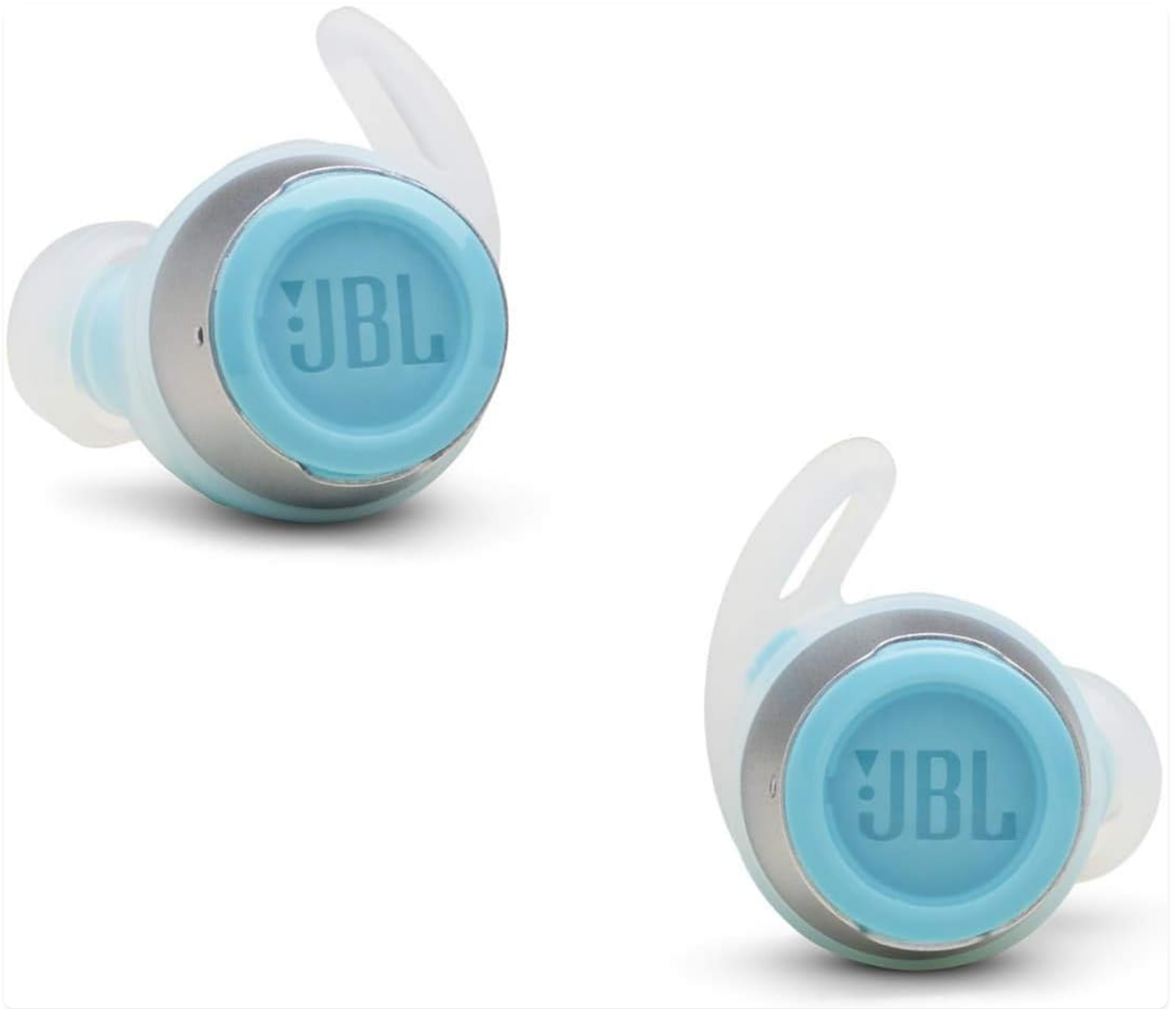
Figure 1: JBL Reflect Flow Teal True Wireless Earbuds.