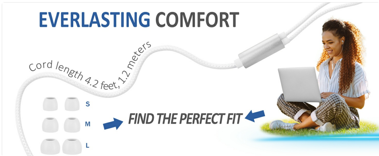
Image: LUDOS Clamor earbuds with various ear tip sizes (S, M, L) and a person wearing them, demonstrating comfort and fit.