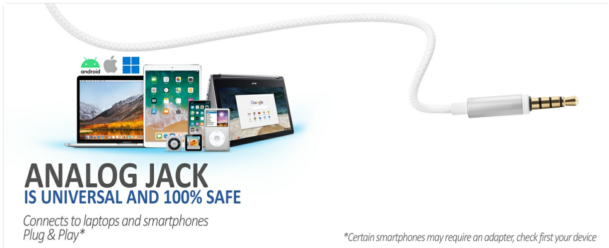
Image: Diagram illustrating the universal compatibility of the 3.5mm analog jack with various devices.