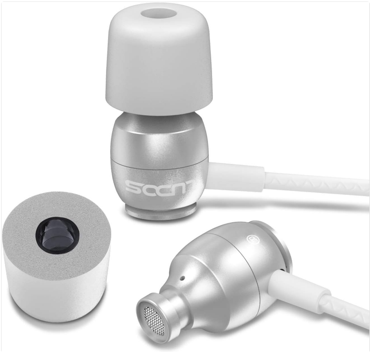
Image: LUDOS Clamor earbud with memory foam tip and internal components, illustrating included ear tips.