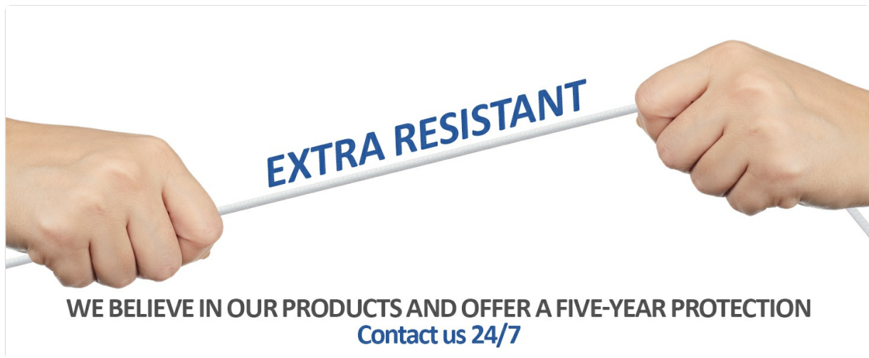
Image: Hands demonstrating the extra resistant nature of the earbud cable.