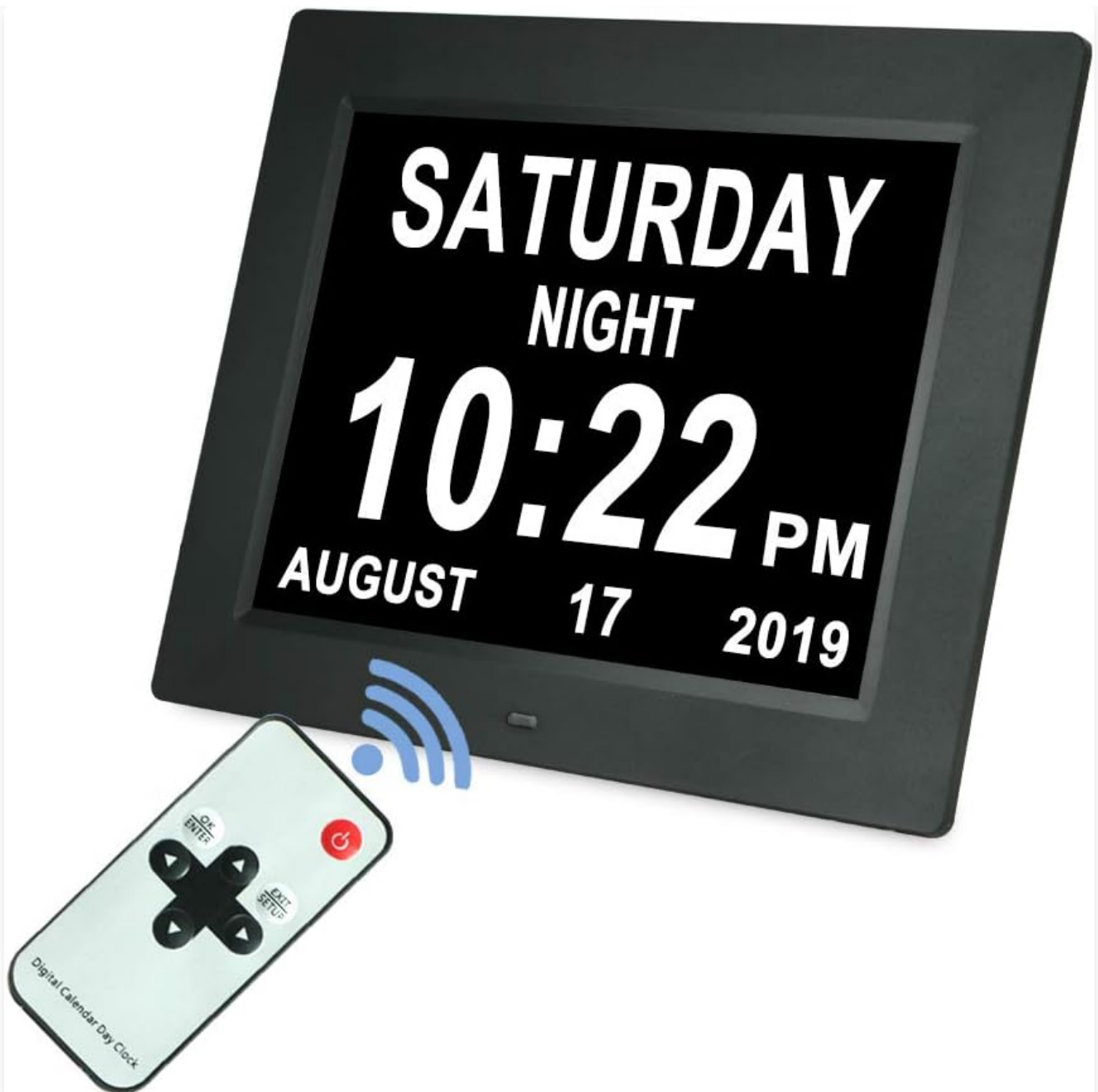
Image 1: Aowasi 10-Inch Digital Day Calendar Clock with Remote Control