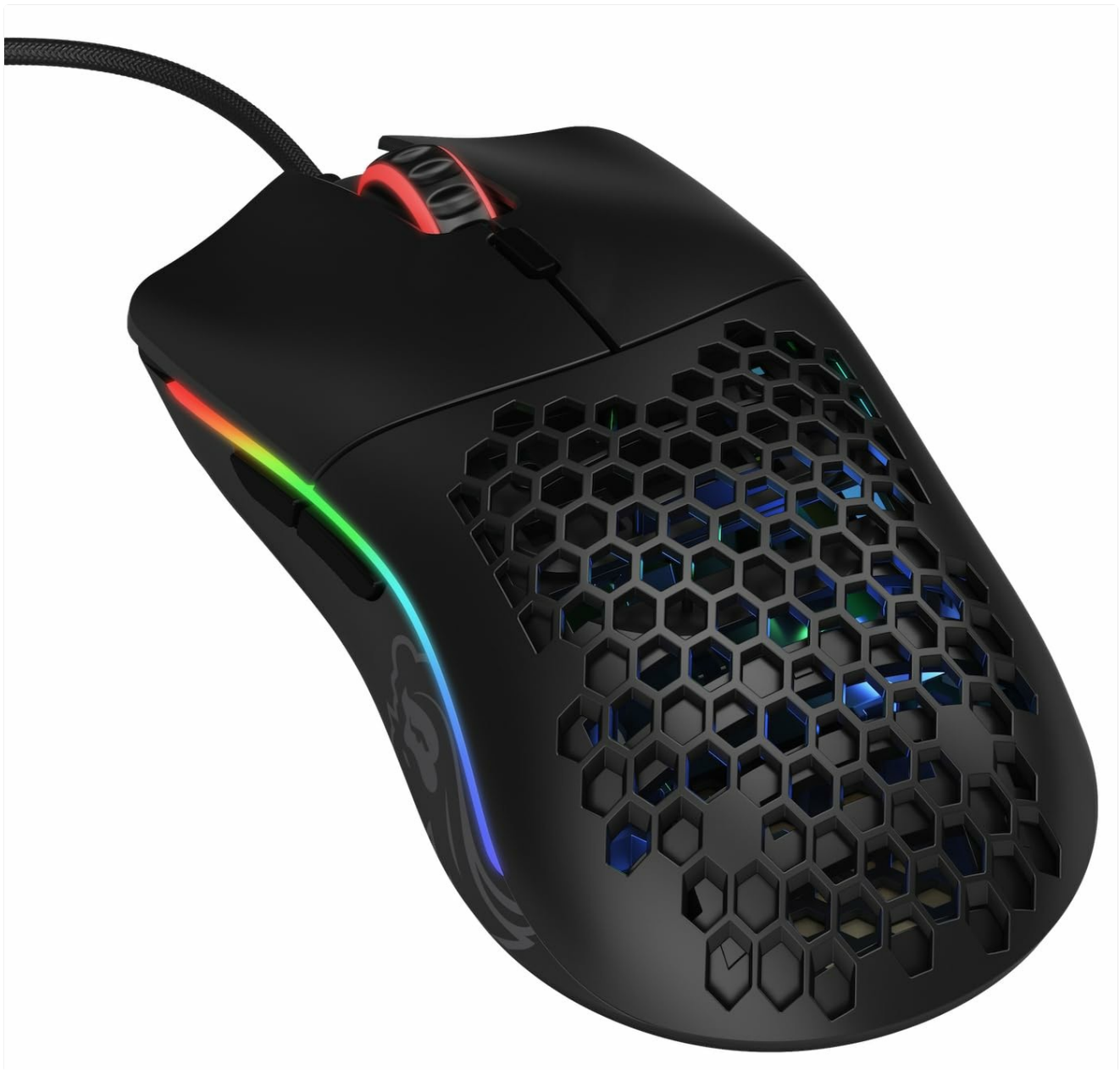
Image: Top-down view of the Glorious Model O- (Minus) mouse, showcasing its honeycomb shell and RGB lighting.