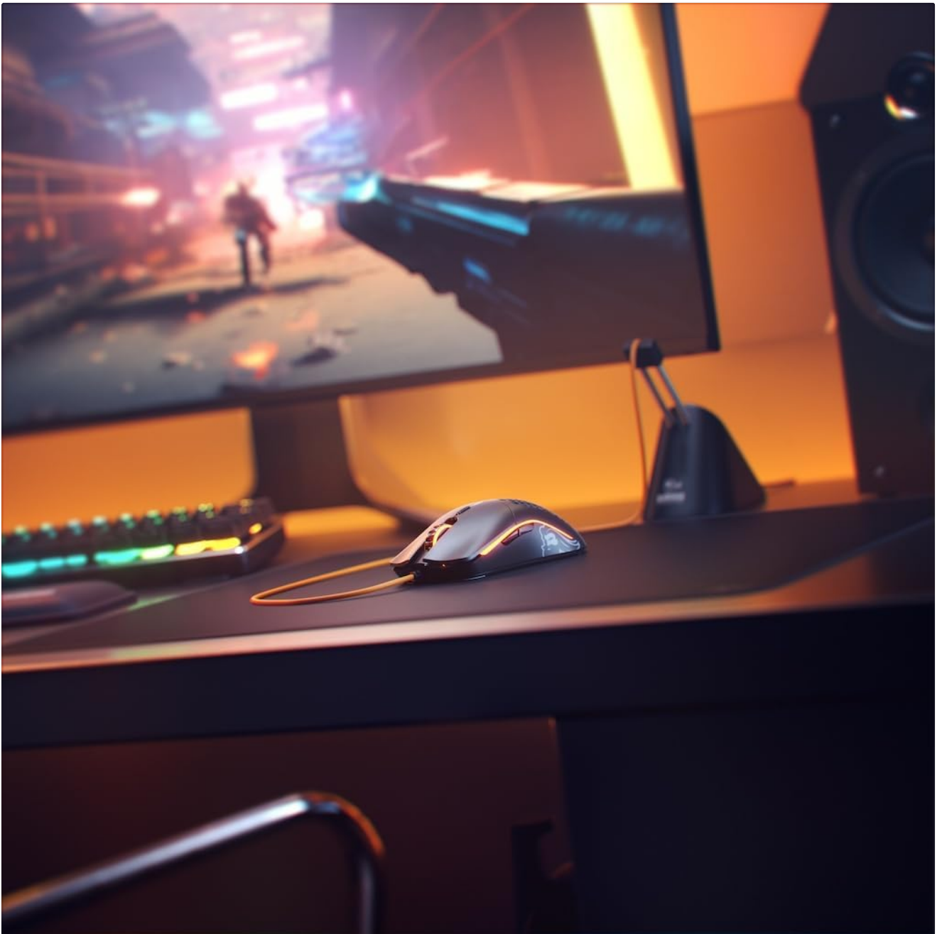
Image: The Glorious Model O- (Minus) mouse connected via its lightweight, flexible Ascended Cord.