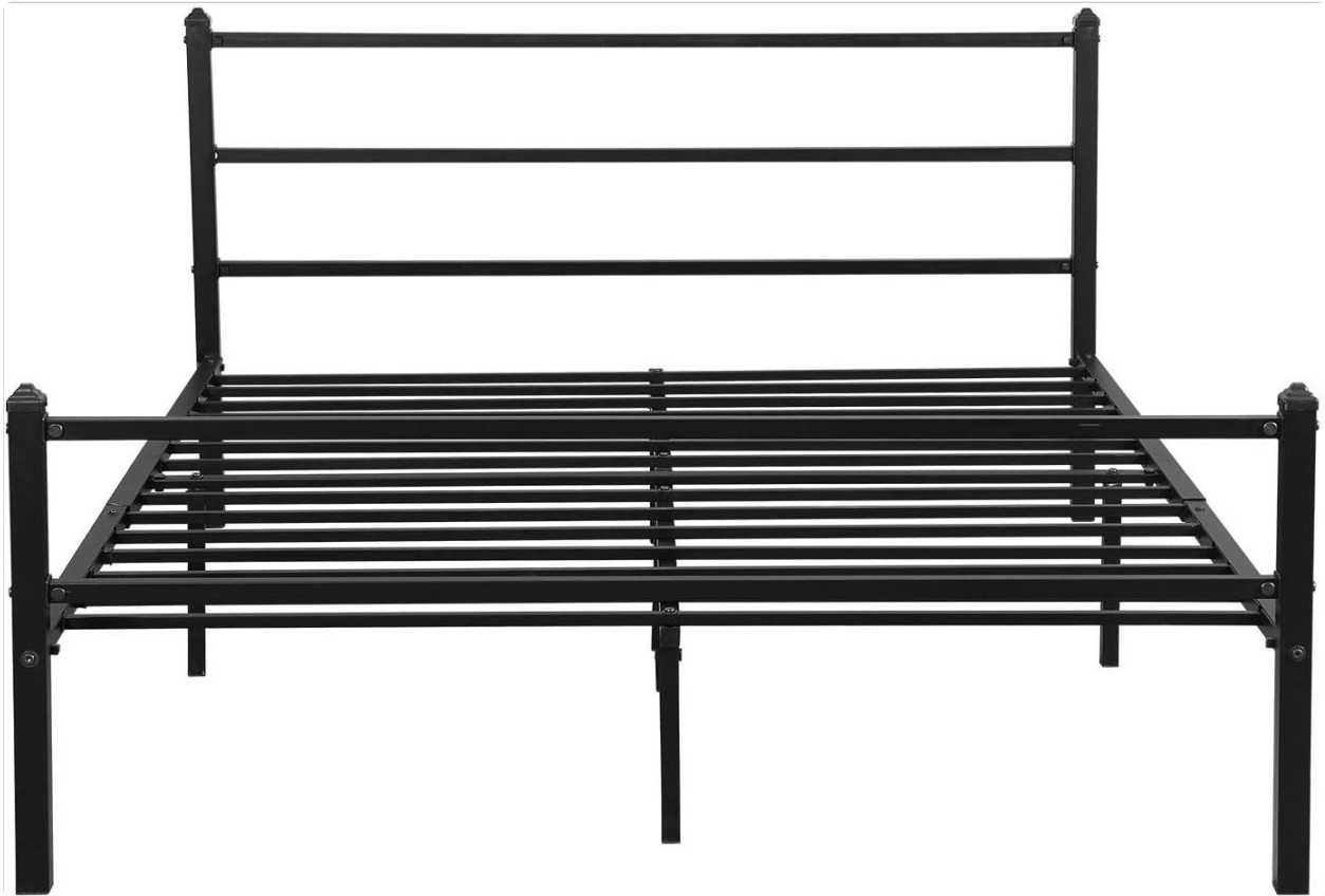
Image: Overview of the GreenForest Full Bed Frame structure, showing the headboard, footboard, side rails, and steel slats before a mattress is placed. This illustrates the main components.