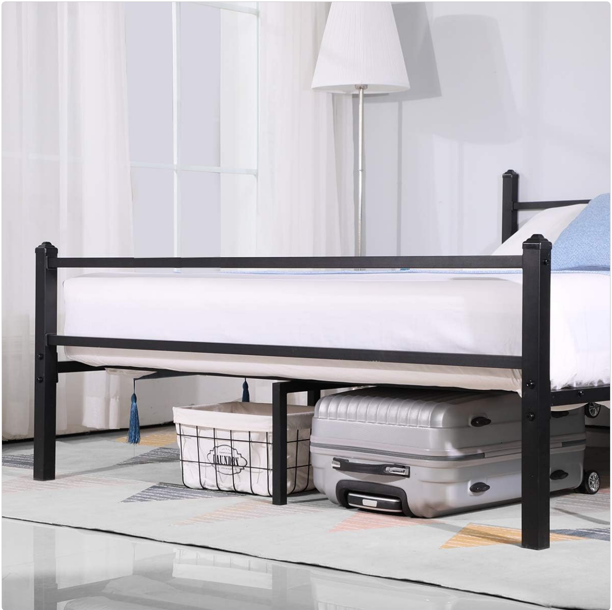
Image: The GreenForest bed frame with items stored underneath, demonstrating the available under-bed clearance for storage solutions like boxes and suitcases.