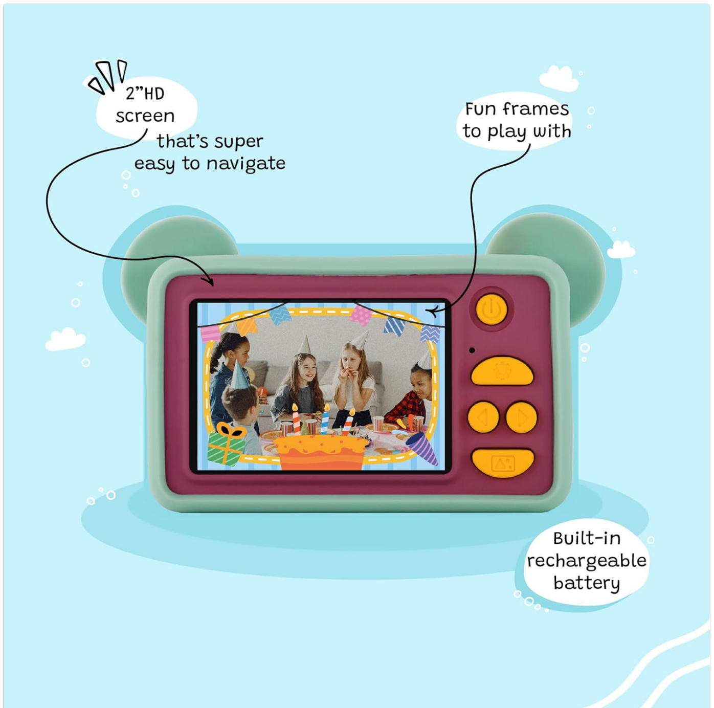
Image: Front view of the Kidamento Model C Mikayo The Bear camera.

The camera is equipped with a 2-inch IPS screen for easy viewing and navigation, along with intuitive buttons for various functions.