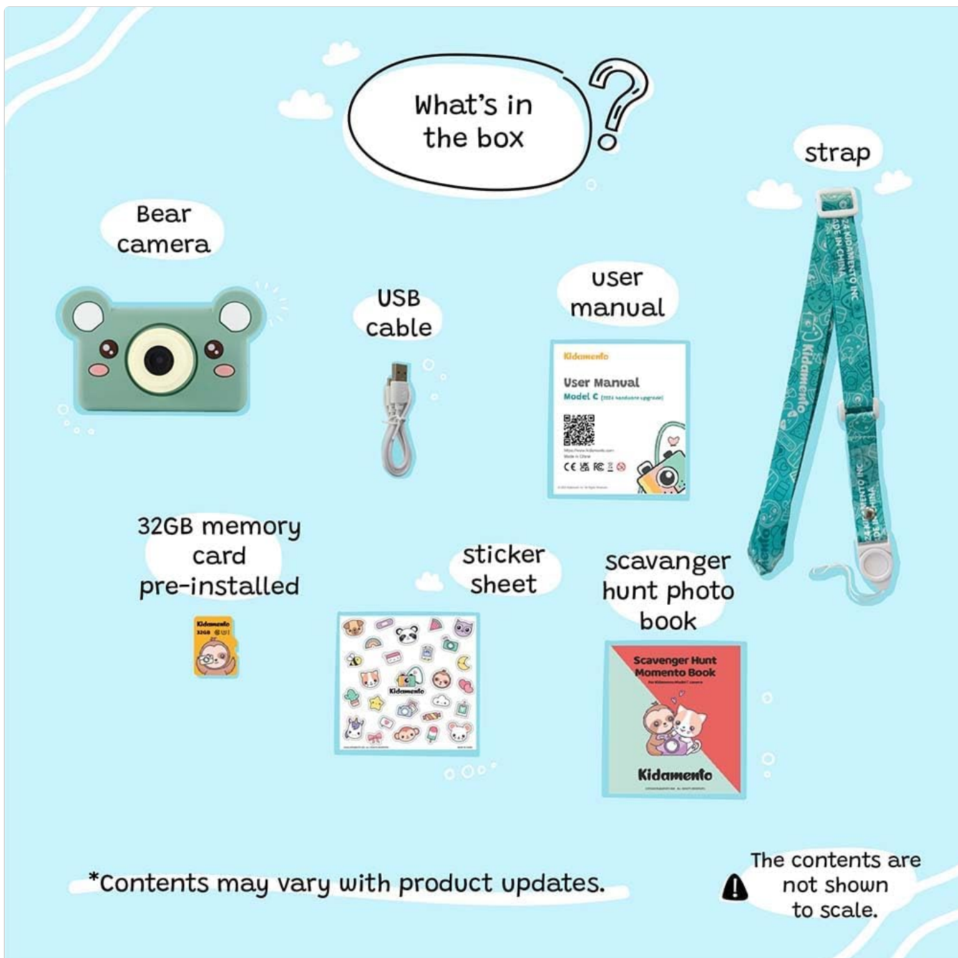
Image: All items included in the Kidamento Model C camera package.