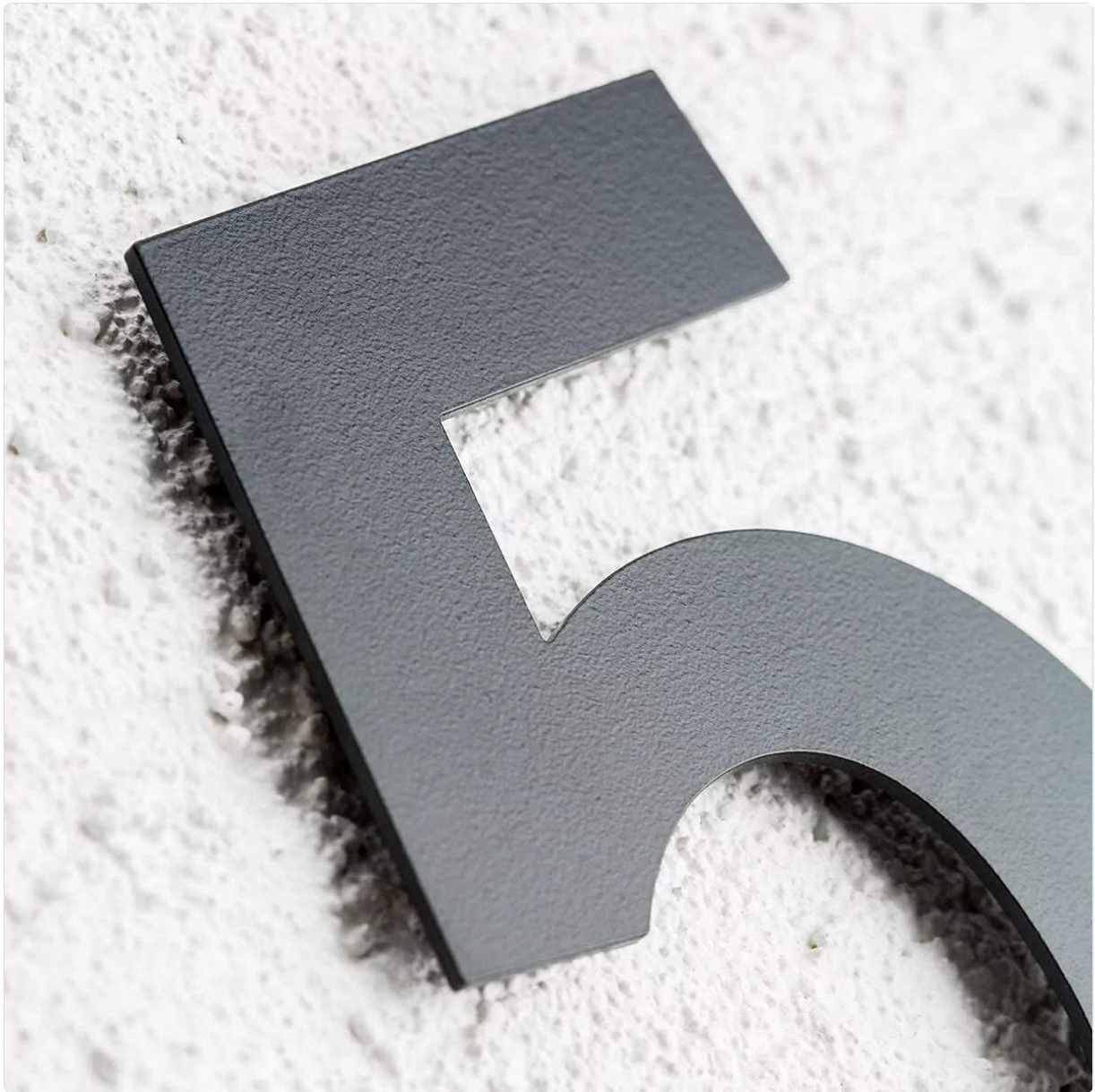
Image 2.2: Close-up view of the fine textured anthracite powder coating, highlighting the durable finish.