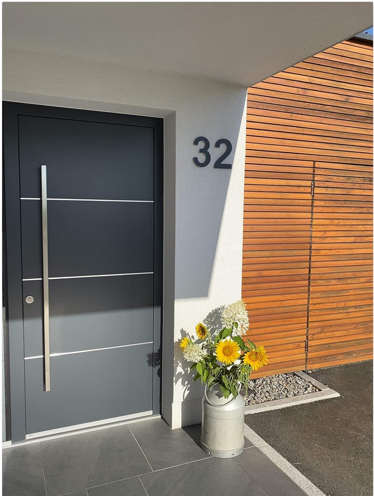
Image 4.1: Example of a Metzler House Number '32' installed on a modern facade, demonstrating visibility and aesthetic integration.