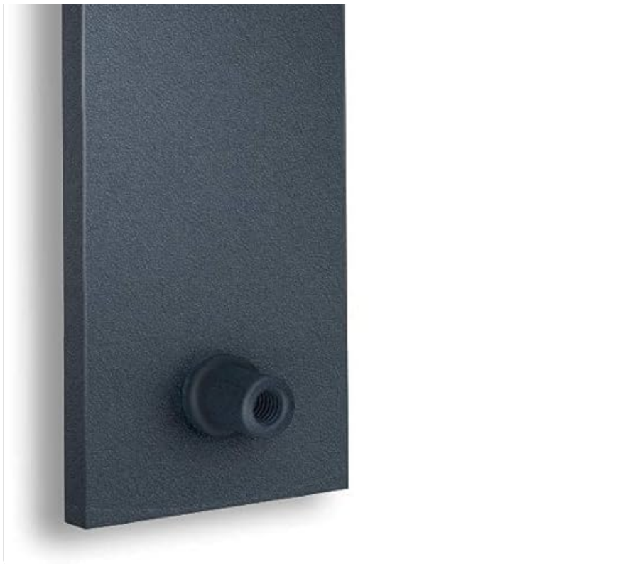
Image 3.1: Rear view of the house number, showing the welded threaded sleeves for invisible mounting.