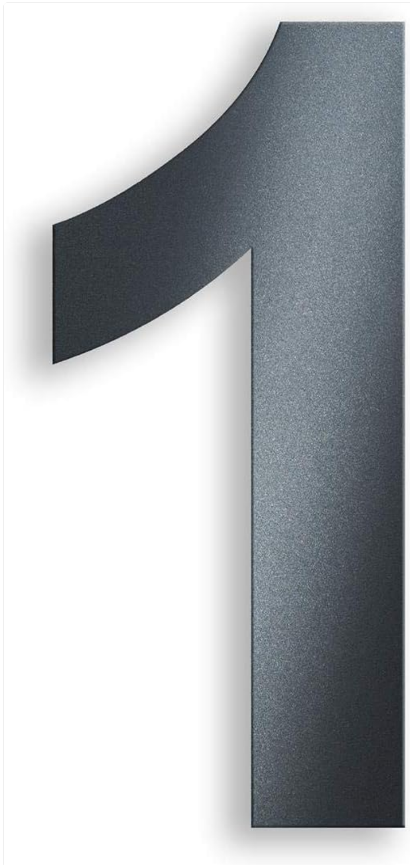
Image 2.1: Front view of the Metzler House Number '1', showcasing its anthracite finish and Arial font.