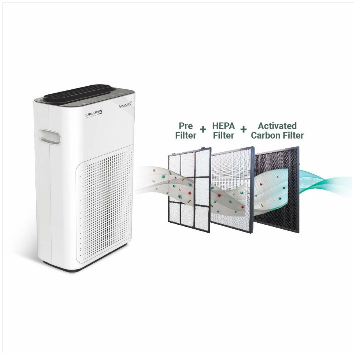
Image: Diagram illustrating the three filter layers: Pre-filter, HEPA Filter, and Activated Carbon Filter, with arrows showing air passing through them.