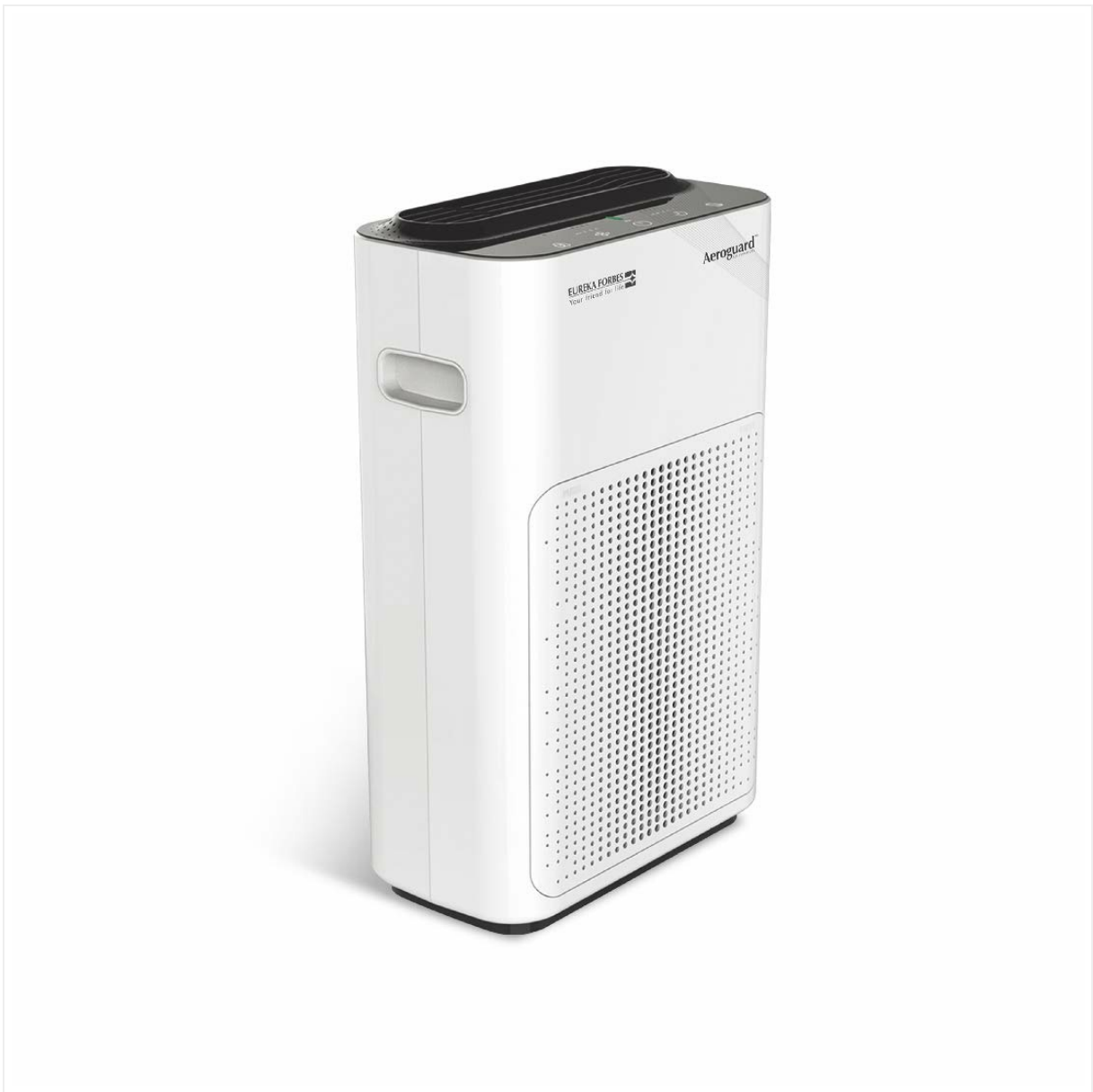
Image: The Eureka Forbes Aeroguard AP 500 Air Purifier, a white rectangular unit with a dark top panel and perforated air intake on the front.