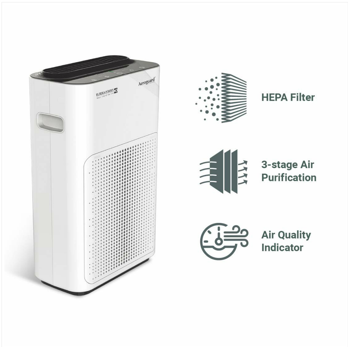
Image: Diagram illustrating key features: HEPA Filter icon, 3-stage Air Purification icon, and Air Quality Indicator icon next to the air purifier unit.