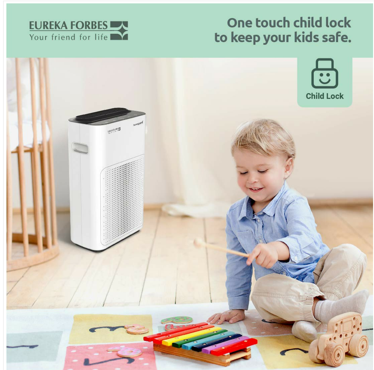
Image: A child playing near the Aeroguard AP 500, highlighting the "One touch child lock to keep your kids safe" feature with a lock icon.

To prevent accidental changes to settings, the Aeroguard AP 500 includes a child lock feature. Activate this function by pressing and holding the designated button (often indicated by a lock icon) for a few seconds. Repeat the action to deactivate.