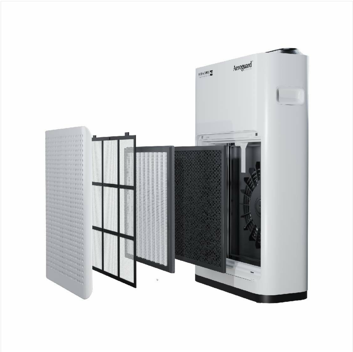
Image: Exploded view of the Aeroguard AP 500 showing the side panel removed and the three filter layers (Pre-filter, HEPA filter, Activated Carbon filter) being inserted into the unit.