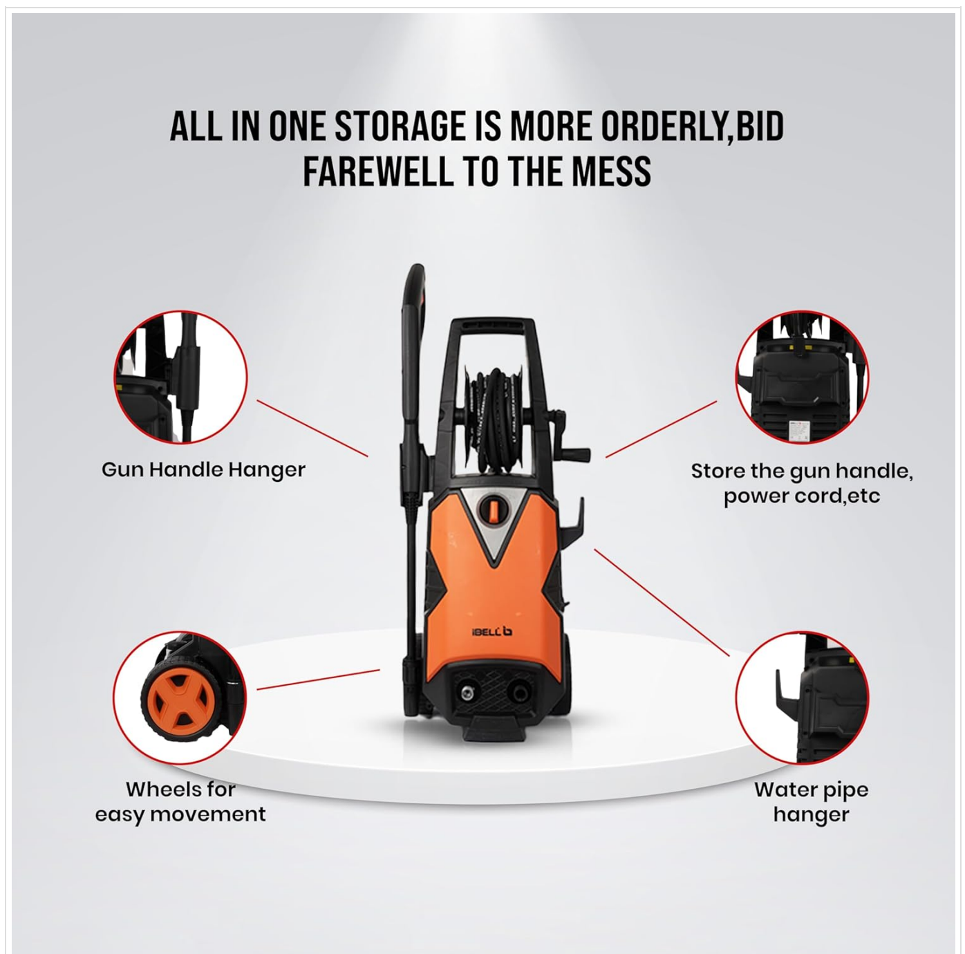
Image 7.1: The pressure washer features integrated storage for the gun handle, power cord, and water pipe, promoting an organized and

Store the pressure washer in a dry, frost-free area. Freezing temperatures can damage the pump and hoses.