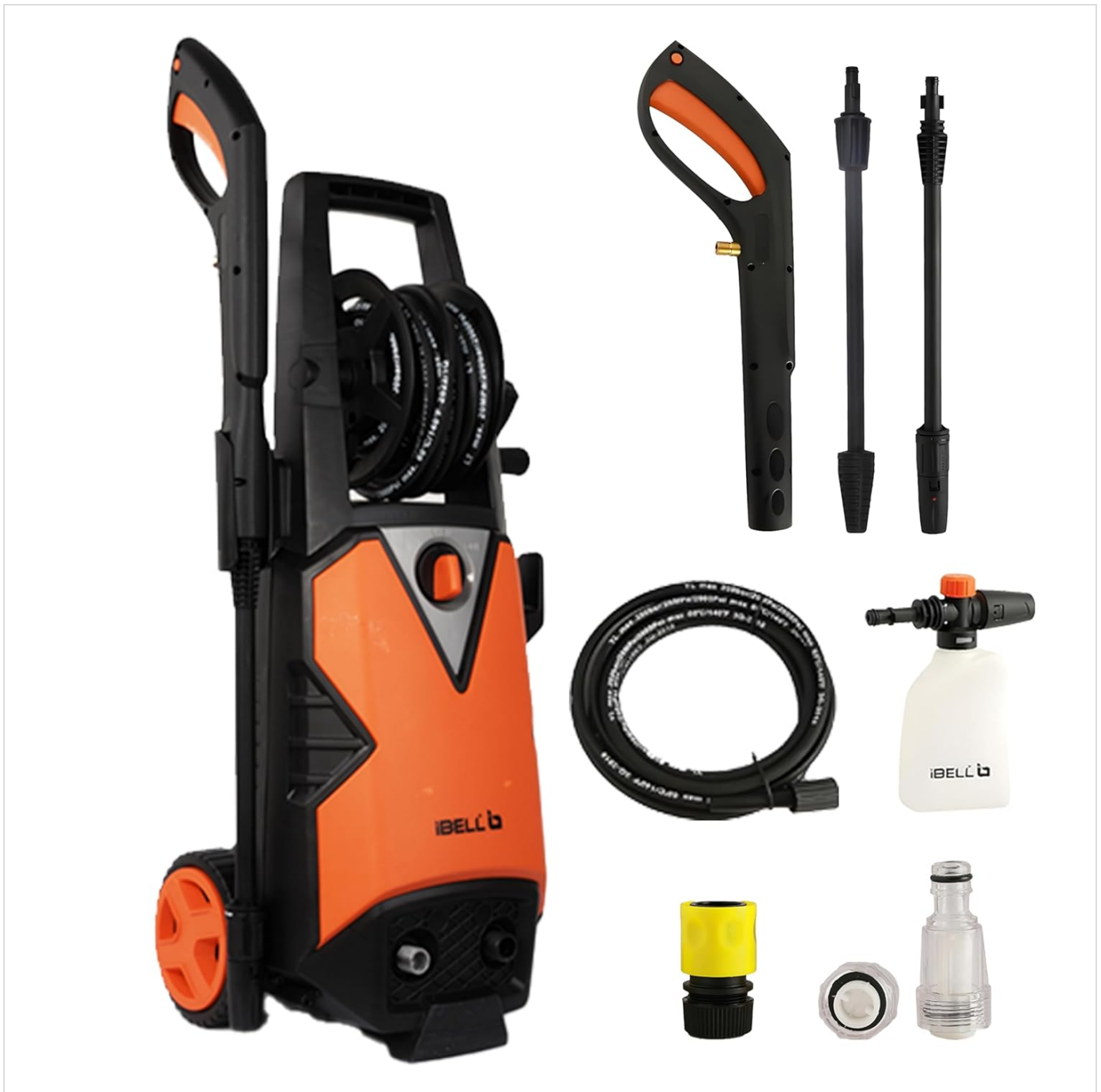
Image 1.1: The IBELL WIND79 PRO High Pressure Washer with its included accessories, showcasing the main unit, spray gun, hose, and various nozzles.