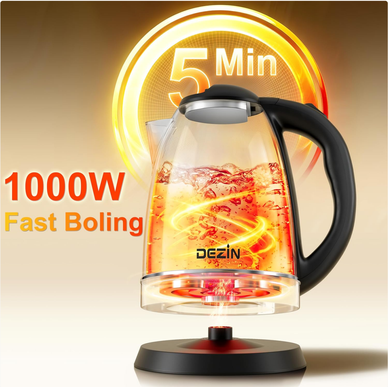
Image: The 1000W heating element ensures fast boiling, typically within 5 minutes.