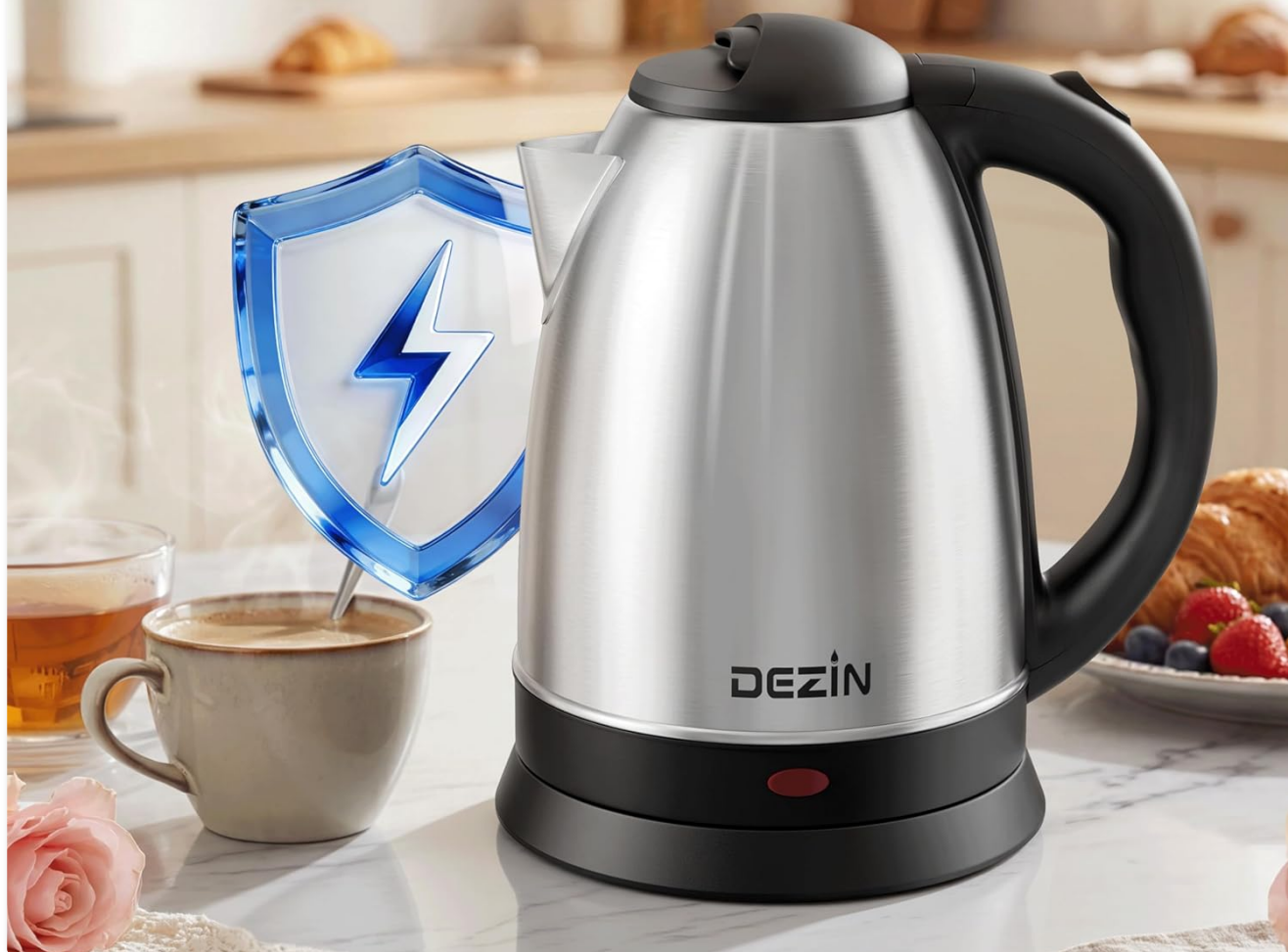
Image: Double safety features include automatic shut-off and boil-dry protection for enhanced user safety.