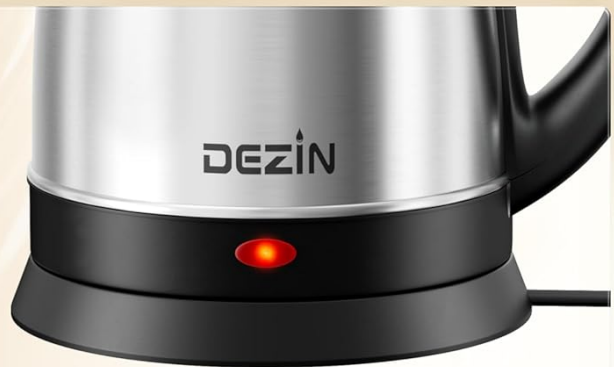
Image: The kettle's base features a storable cord for tidy counter placement, and the handle is designed for an ergonomic, cool touch.