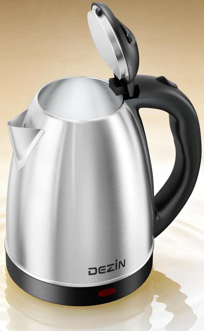
Image: The kettle features a safe and odorless design with a stainless steel inner lid, spout, and interior, ensuring no plastic contact with water.