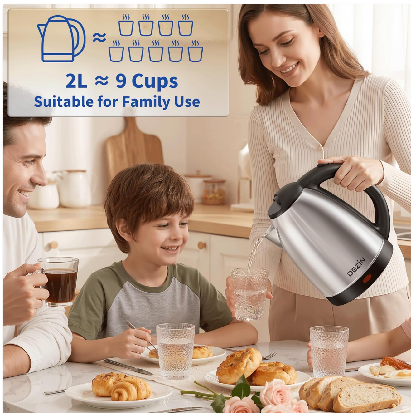
Image: The 2L capacity of the DEZIN Electric Kettle is suitable for preparing up to 9 cups of hot beverages, ideal for family use.