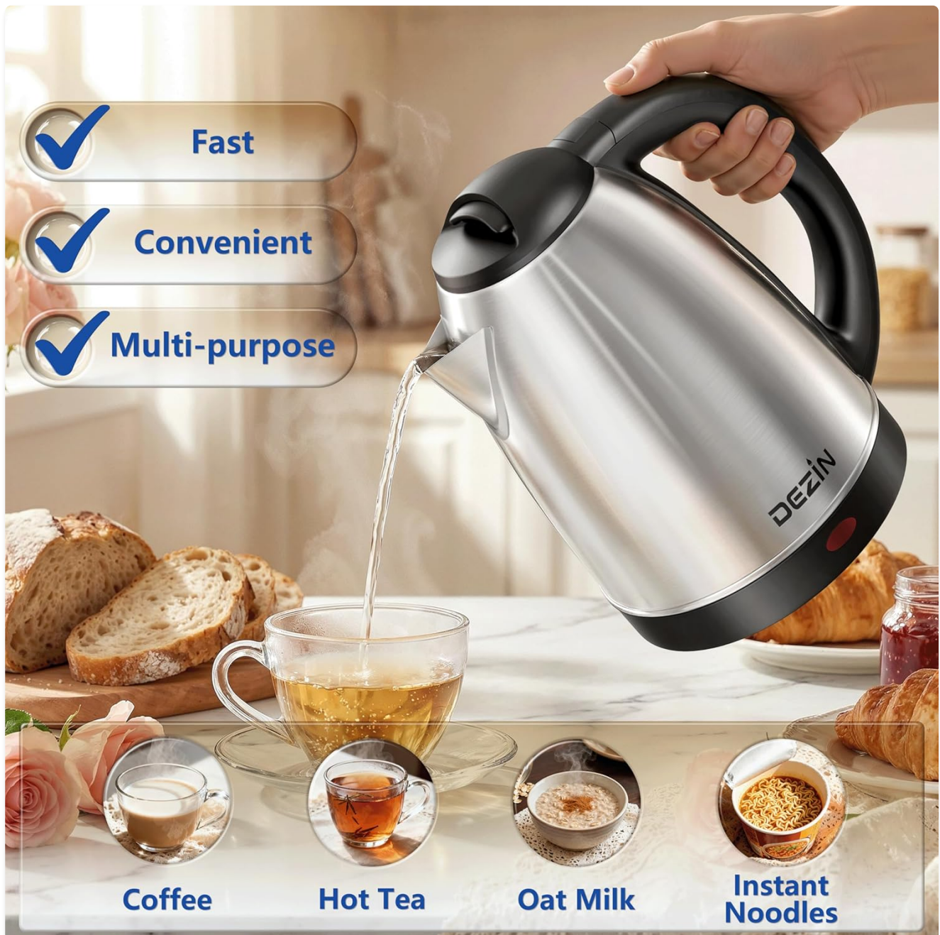
Image: The kettle is fast, convenient, and multi-purpose, suitable for preparing coffee, hot tea, oat milk, and instant noodles.

Your browser does not support the video tag.