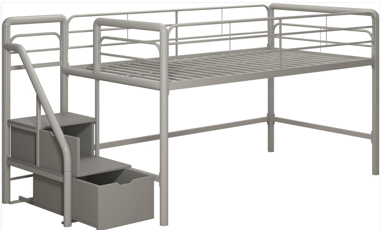
Image: Close-up of the integrated storage steps with pull-out drawers.