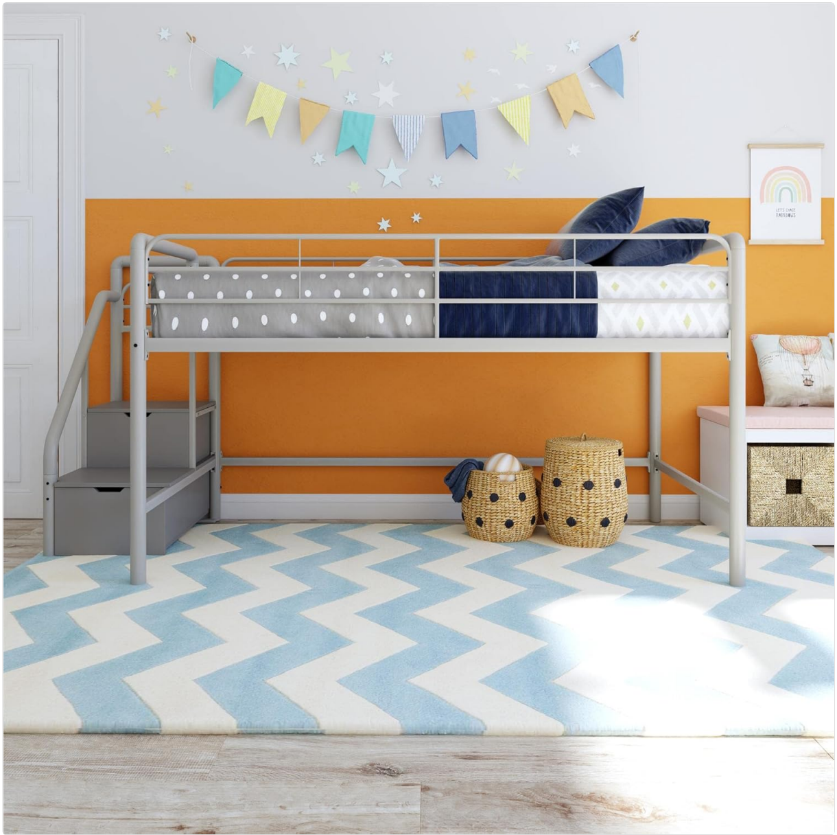
Image: Another view of the DHP Junior Twin Metal Loft Bed in a decorated room.