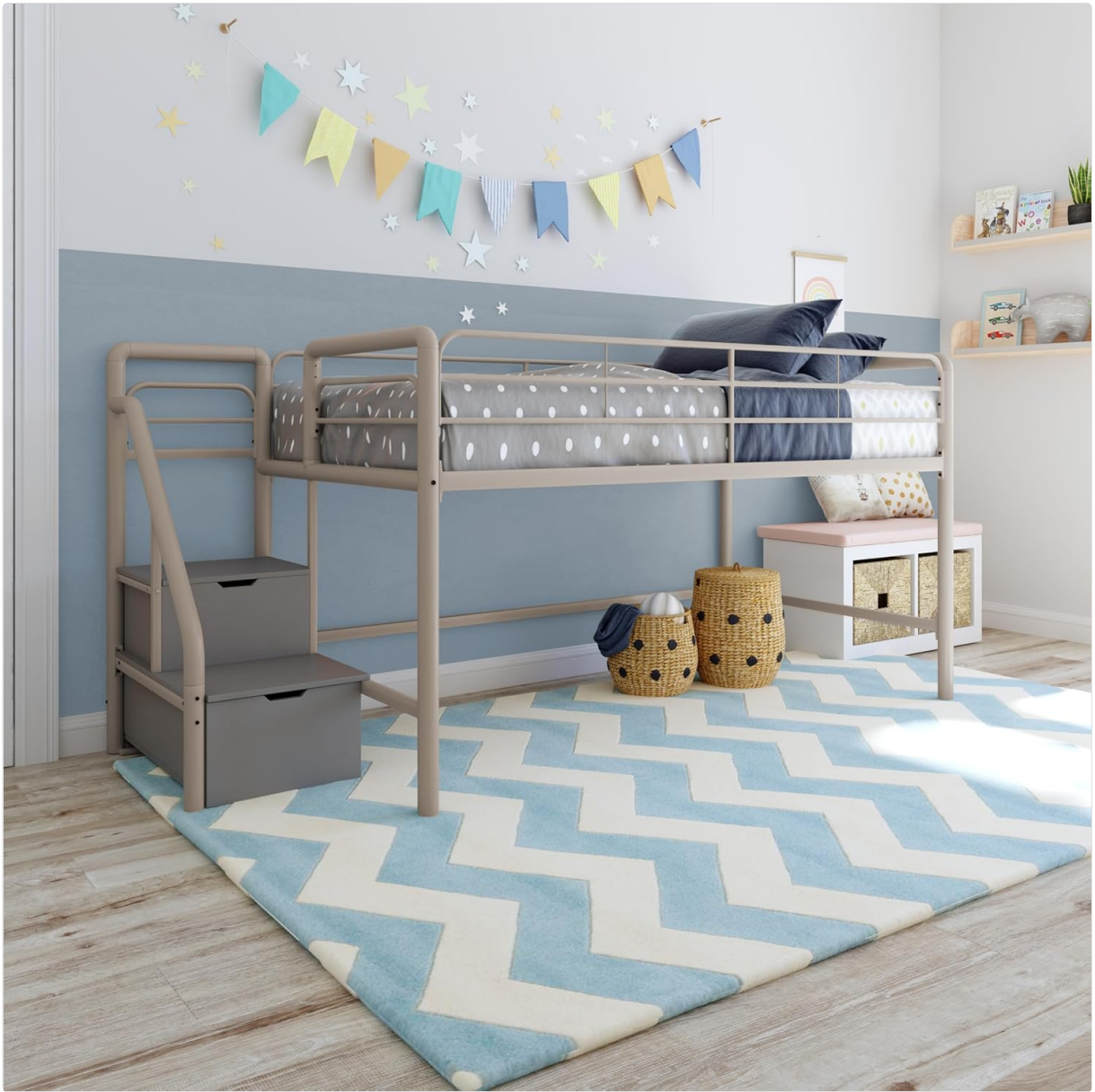
Image: DHP Junior Twin Metal Loft Bed with Storage Steps.