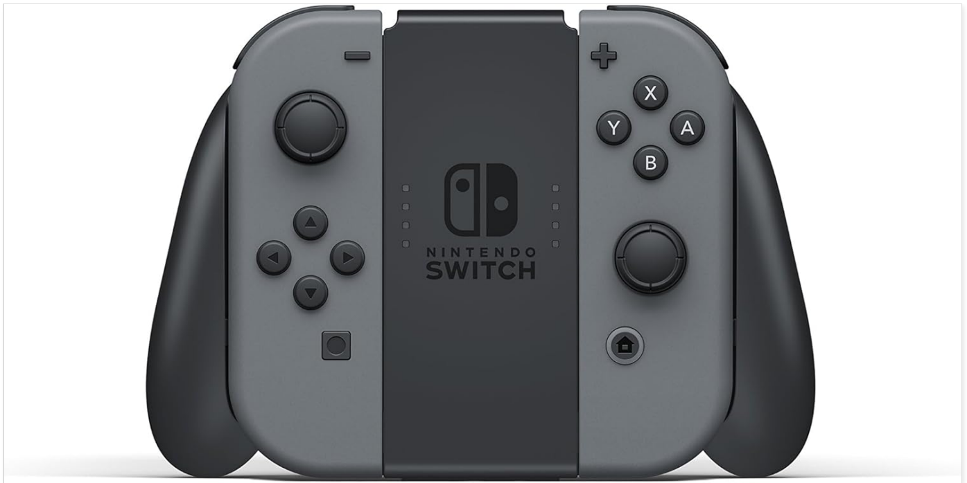
Figure 5.1: The Gray Joy-Con controllers combined with the Joy-Con Grip, forming a single, more traditional controller layout.