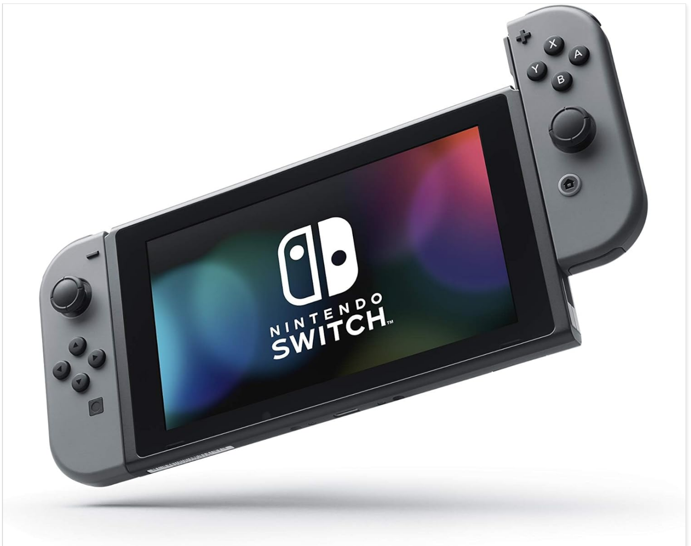
Figure 4.1: The Nintendo Switch in handheld mode, ready for portable gaming with Joy-Cons attached.