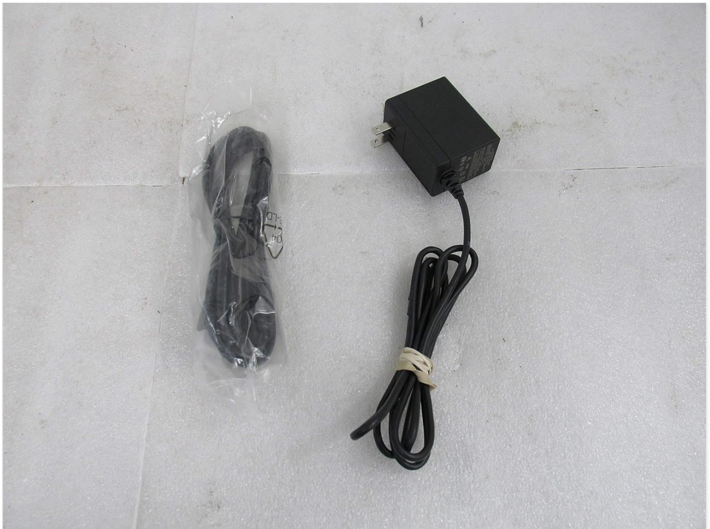
Figure 2.2: The included AC Adapter for power and charging, and the HDMI cable for connecting to a television.