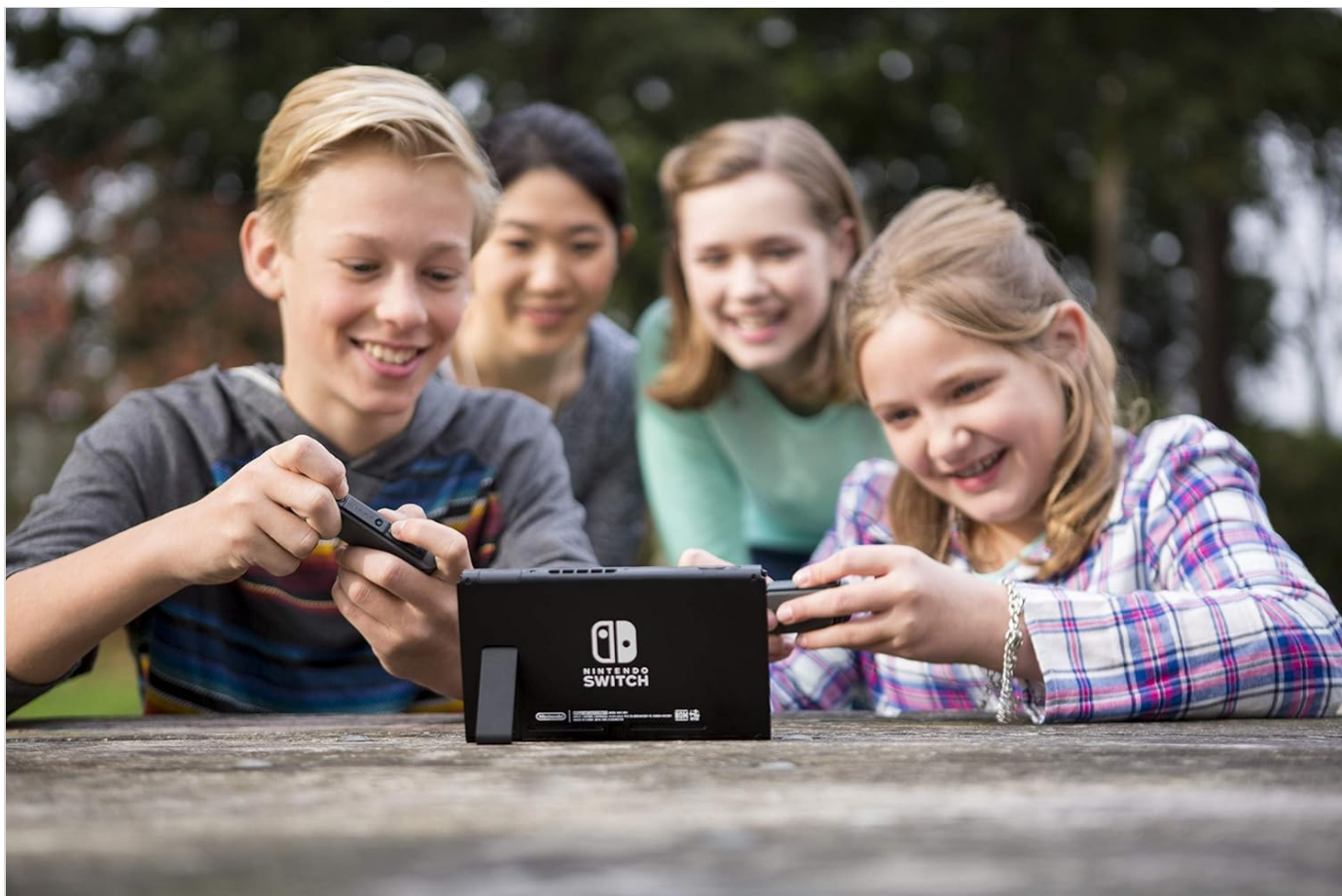
Figure 4.3: Multiple users engaging with the Nintendo Switch in tabletop mode, demonstrating its multiplayer capabilities.