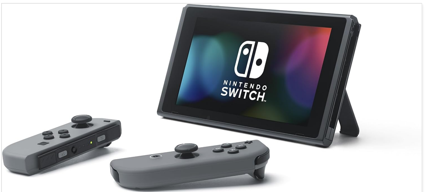
Figure 4.2: The Nintendo Switch console positioned in tabletop mode using its kickstand, with detached Joy-Con controllers for flexible play.

Flip out the console's kickstand and use the detached Joy-Con controllers to play anywhere. This is suitable for multiplayer gaming on a flat surface.