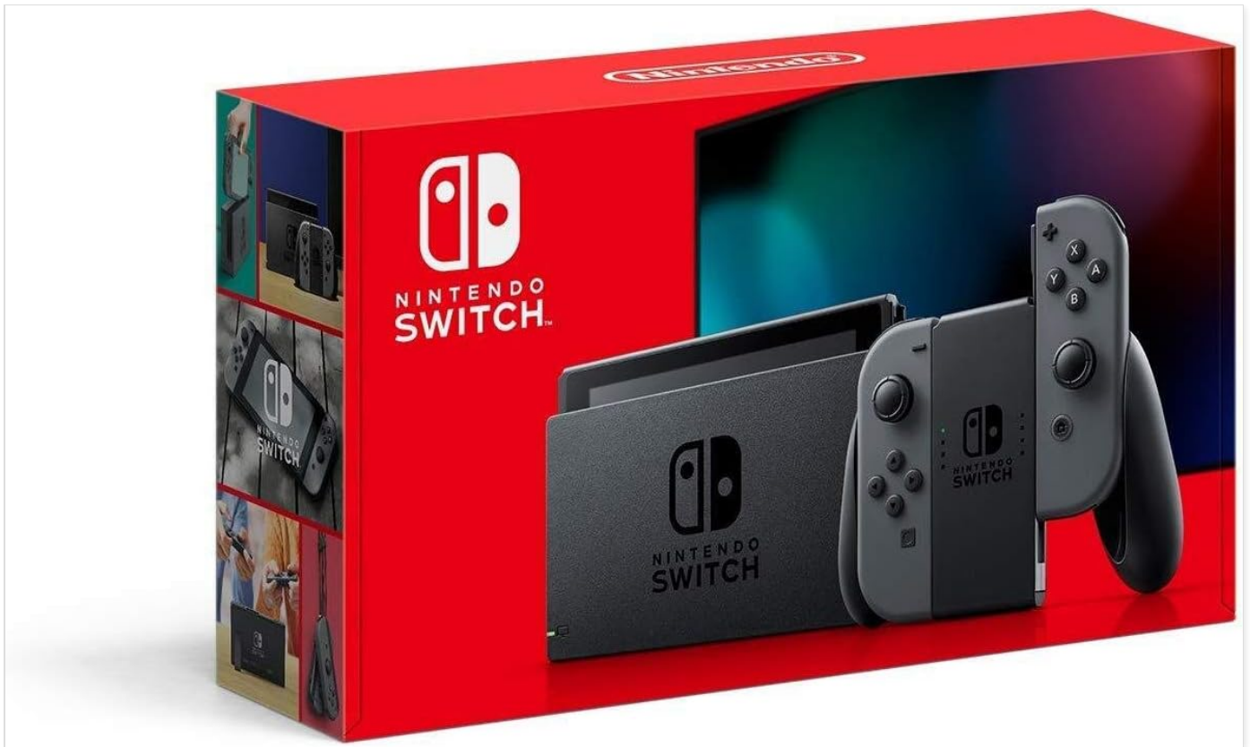
Figure 1.1: Nintendo Switch (HAC-001(-01)) retail packaging.