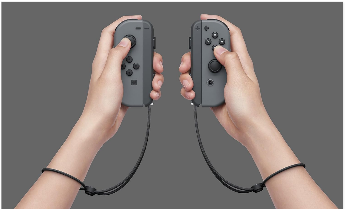
Figure 5.2: Joy-Con controllers with wrist straps, demonstrating their use for motion-controlled games and to prevent accidental drops.