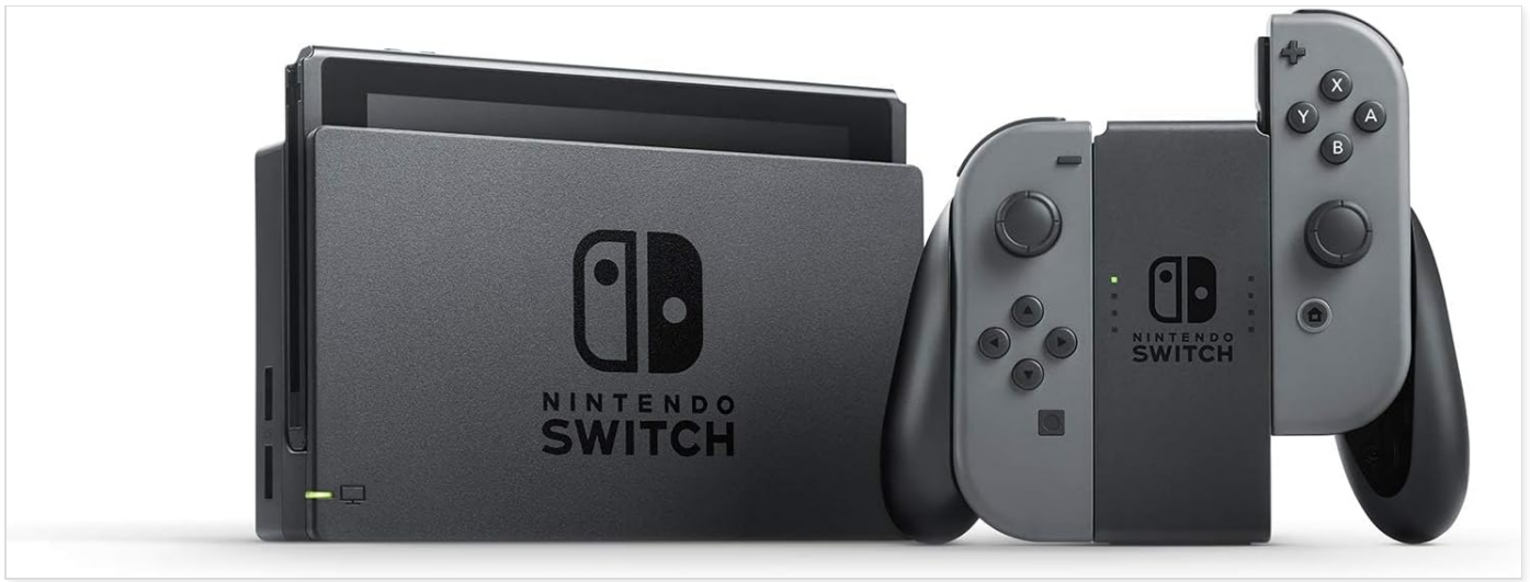
Figure 3.1: The Nintendo Switch console with its detachable Joy-Con controllers and the Joy-Con Grip, illustrating the modular design.