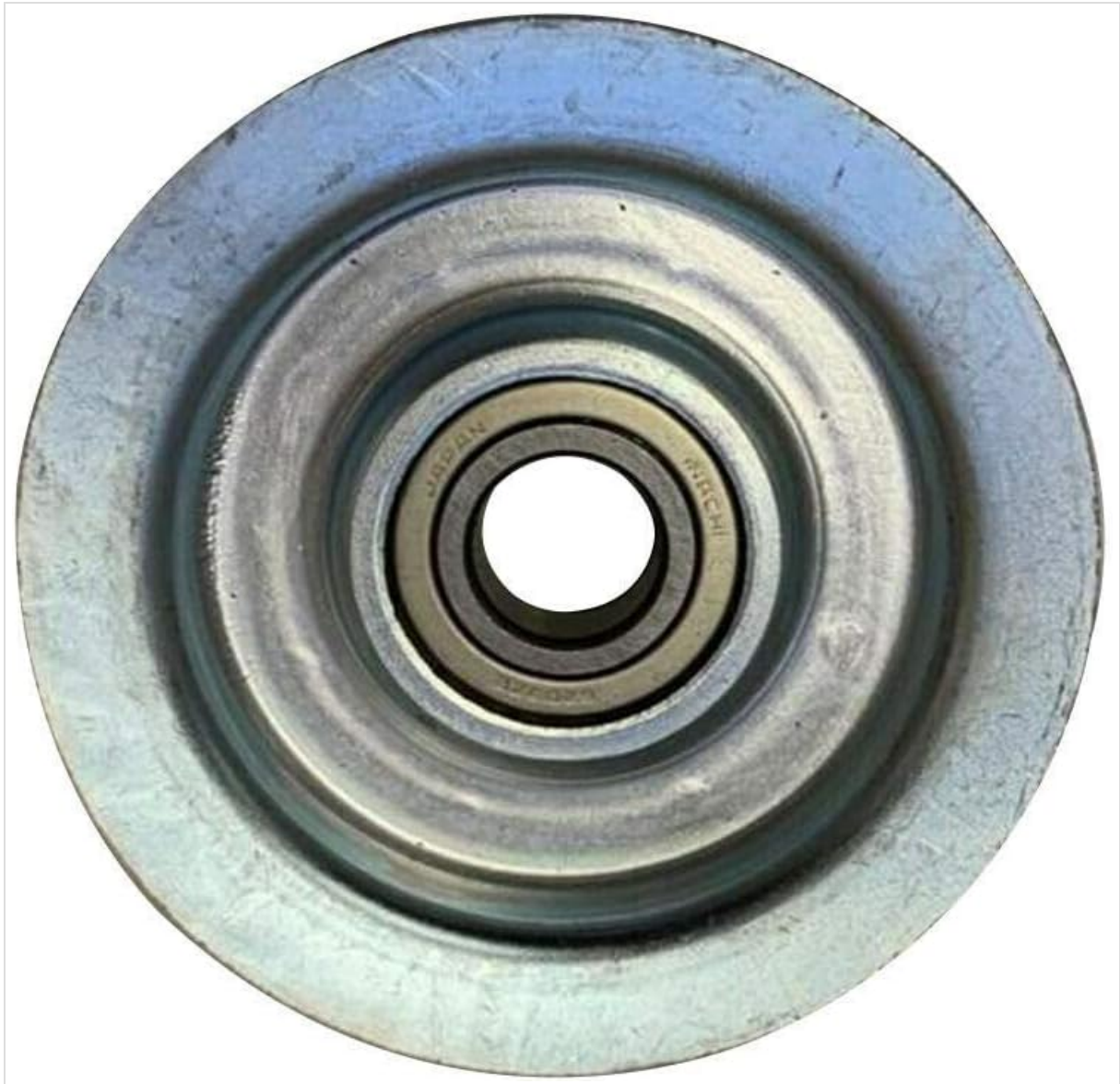
Image: Top-down view of the larger idler pulley, detailing its bearing and structural design.