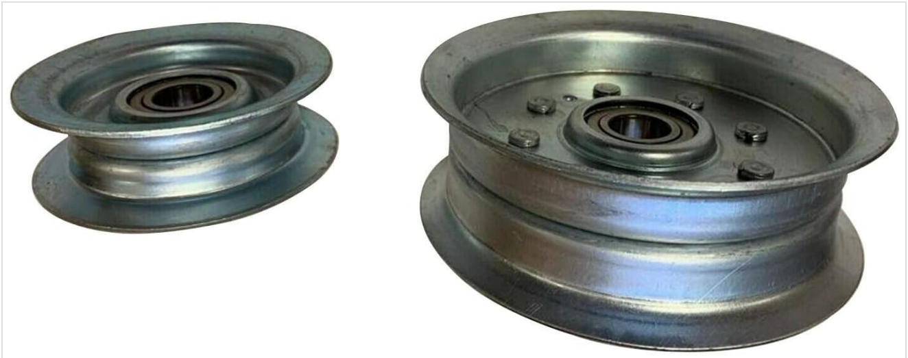
Image: An angled view of both idler pulleys, highlighting their construction and the central bearing mechanism.